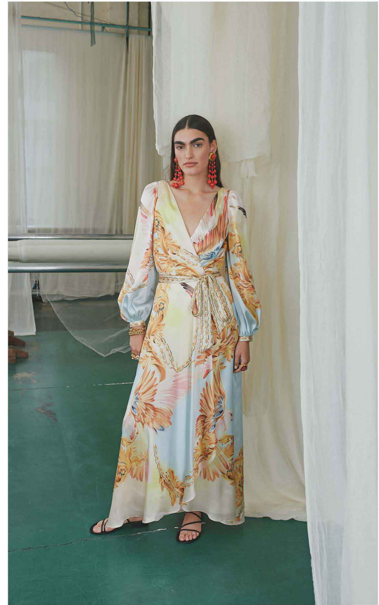
LOOK 14 Akira Wrap Dress