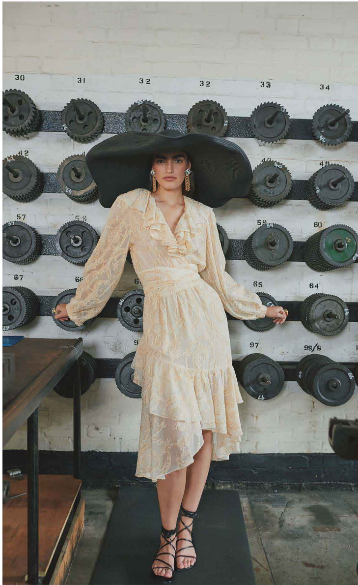
LOOK 17 Garda Skirt & Blouse