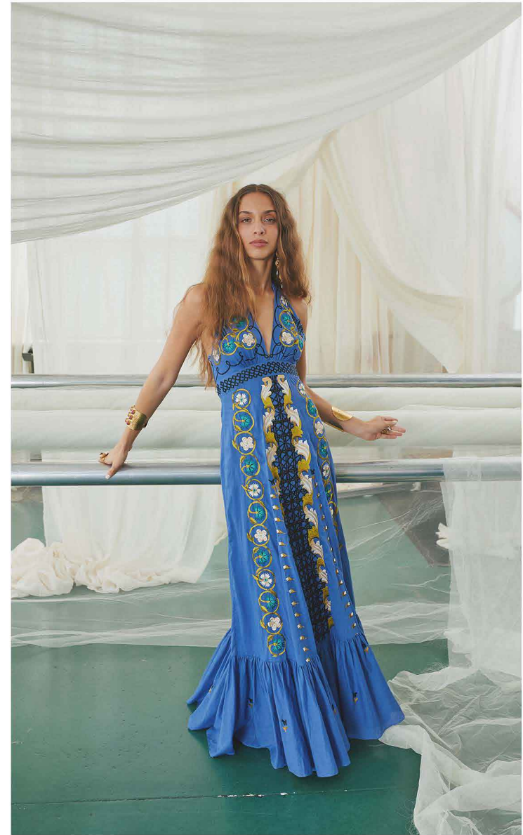
LOOK 22 Florentine Halter Dress