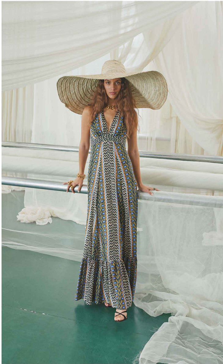
LOOK 25 Gia Halter Dress