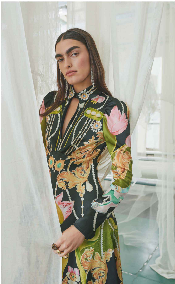
LOOK 11 Akira Dress in Black