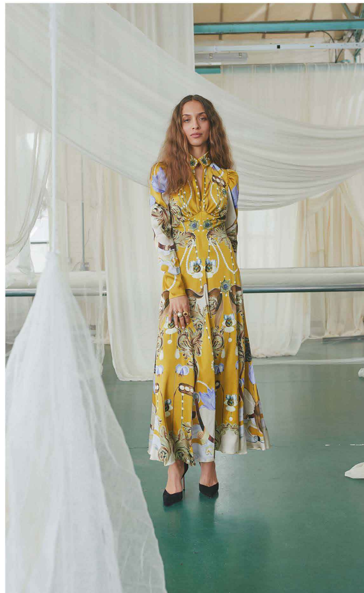
LOOK 12 Akira Dress in Ceylon Yellow