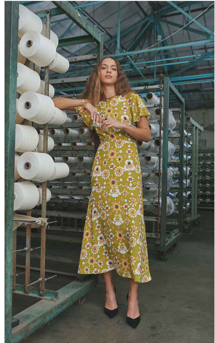
LOOK 18 Alessandro Dress