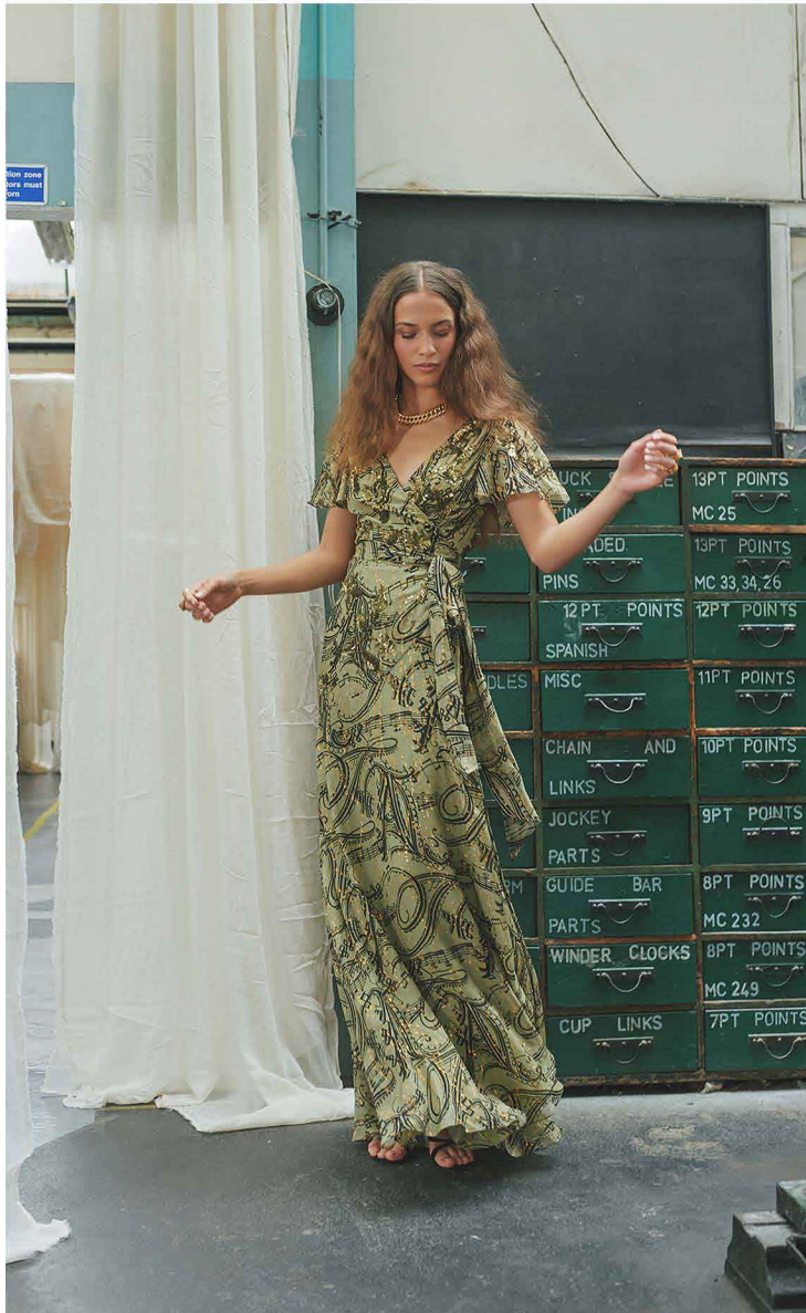
LOOK 15 Silvana Wrap Dress