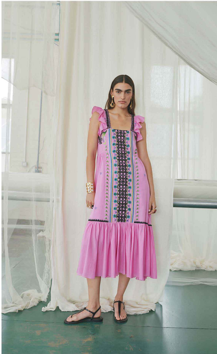
LOOK 21 Florentine Dress