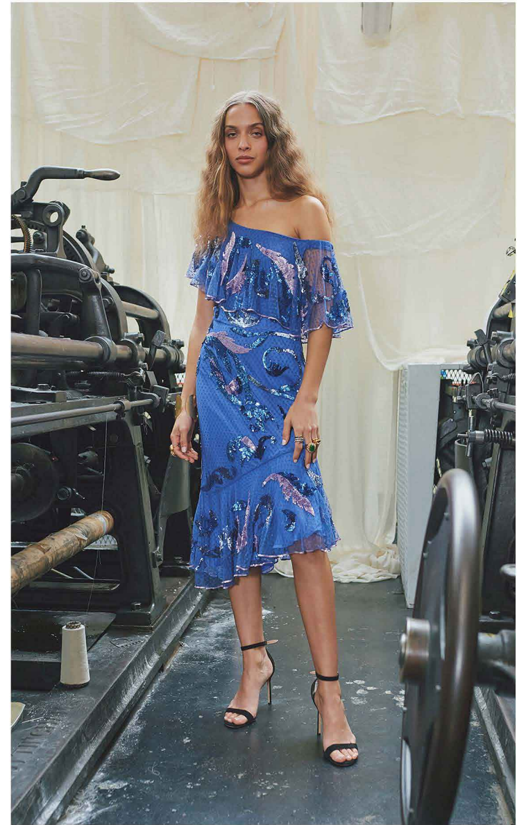
LOOK 26 Novella Ruffle Dress