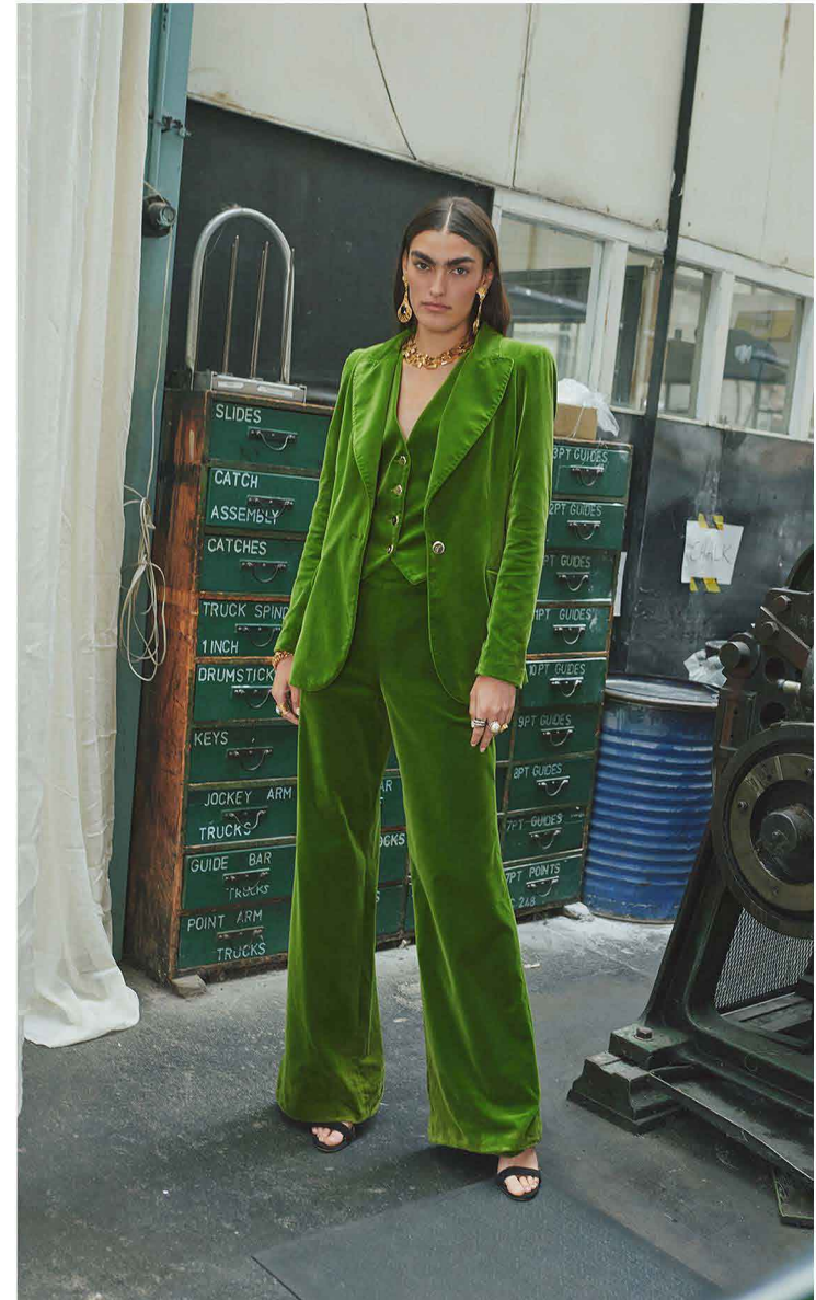
LOOK 16 Clove Jacket, Waistcoat & Trouser