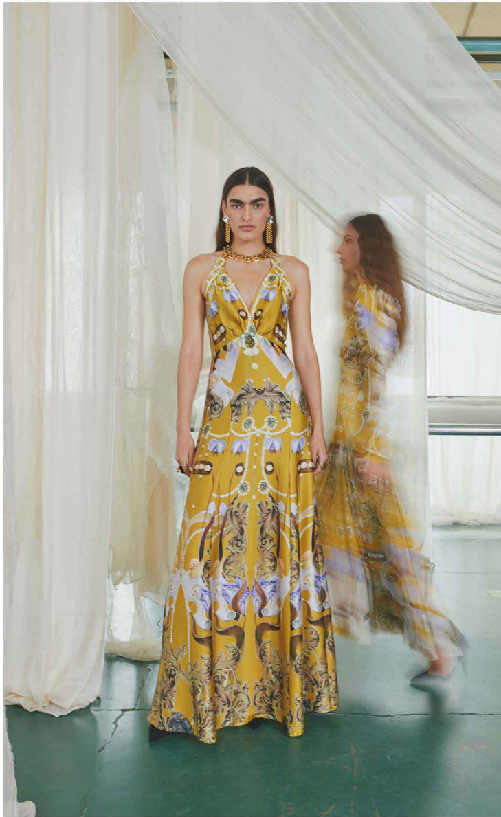
LOOK 13 Akira Strappy Dress