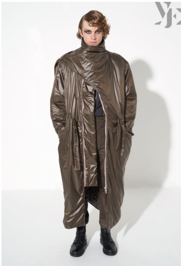
YEF STUDIO CORE-LINE // 2023