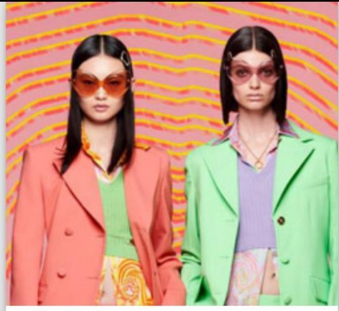
MOD-----A Versace Resort 2022: Psicodelia retro y diversión