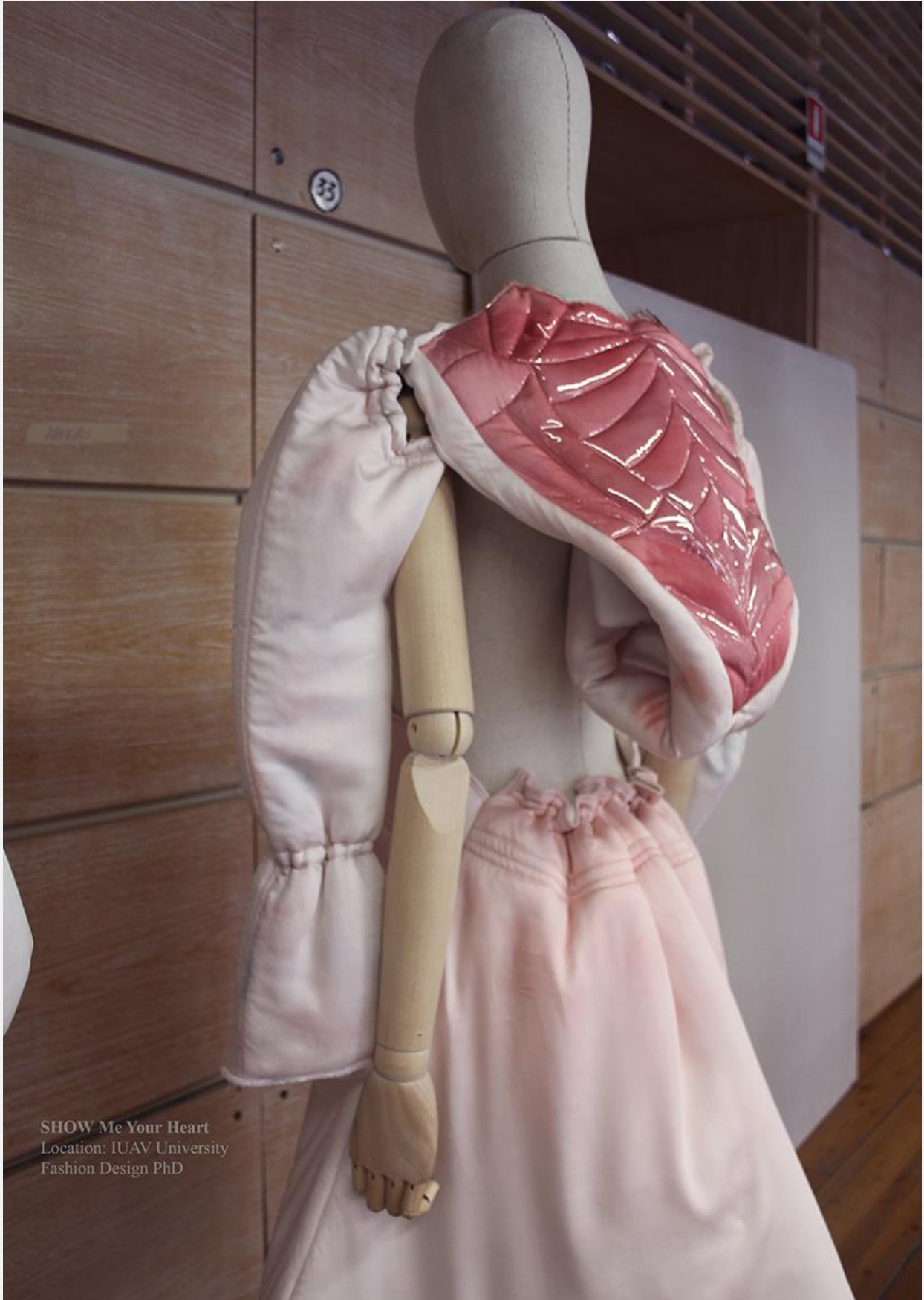
SHOW Me Your Heart Location: IUAV University Fashion Design PhD