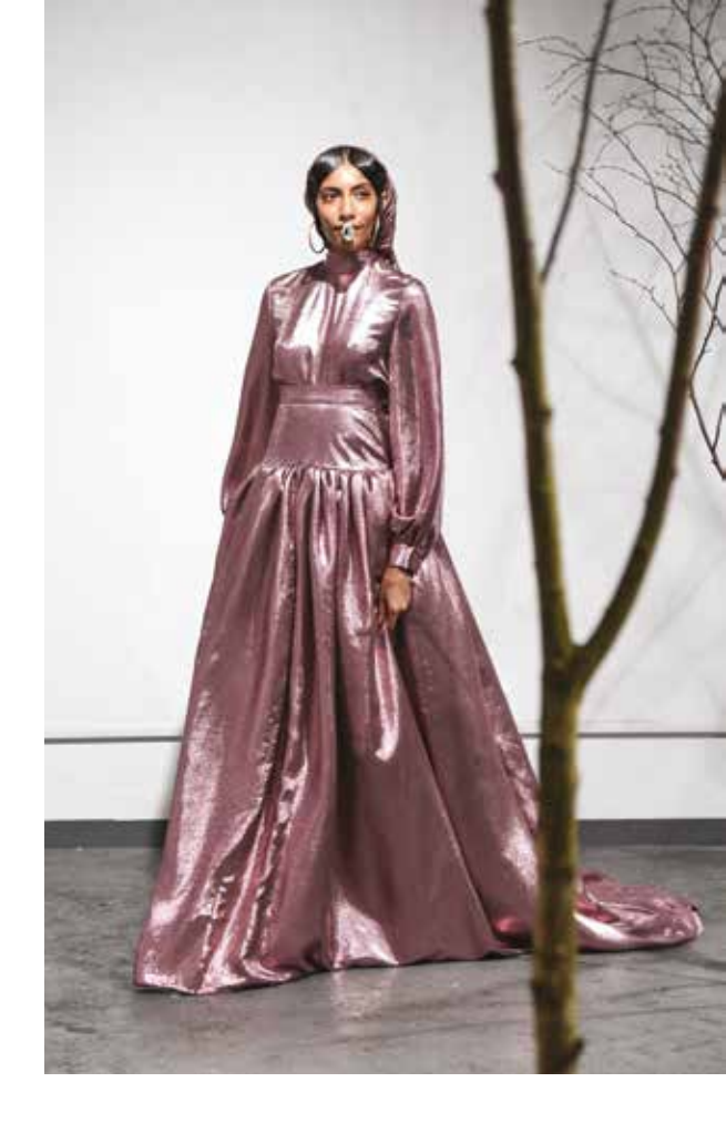
The Princess Blouse, Bloom Skirt and Scarf in Pink Silk Lurex