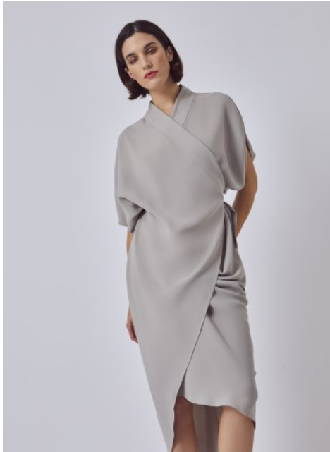
Siya wrap—worn as a dress