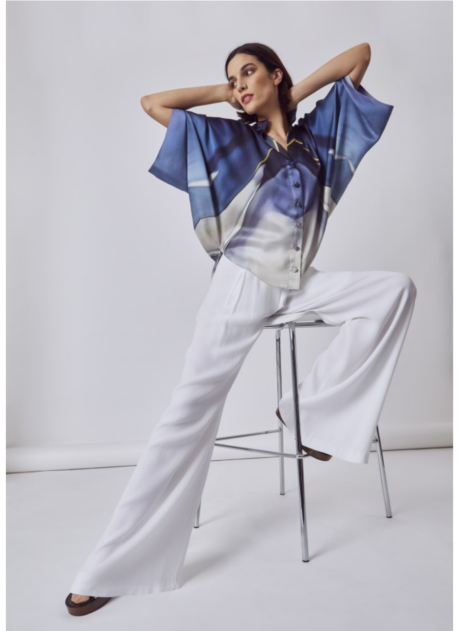
Momoyaya Artwork print blouse and Oxford trousers