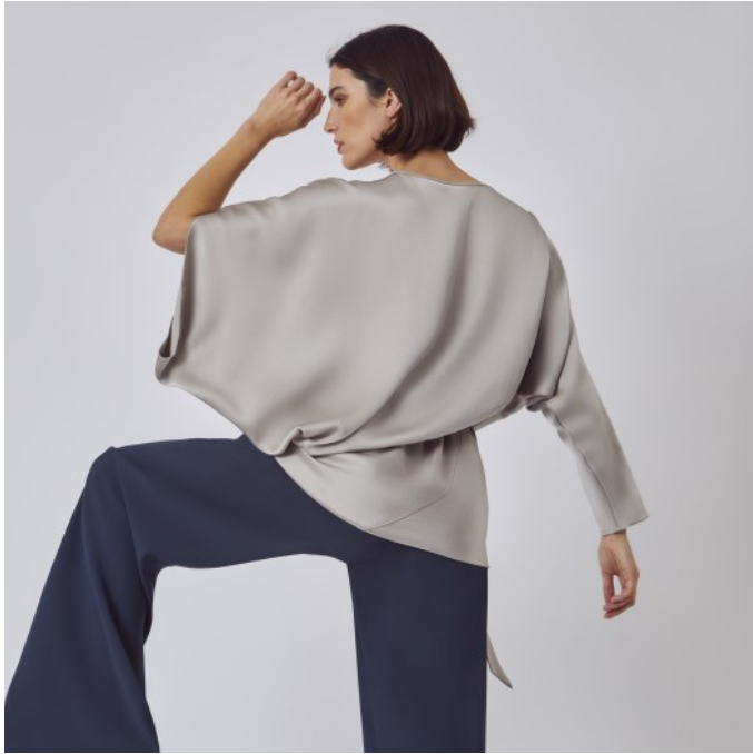
Alruna blouse and Oxford trousers