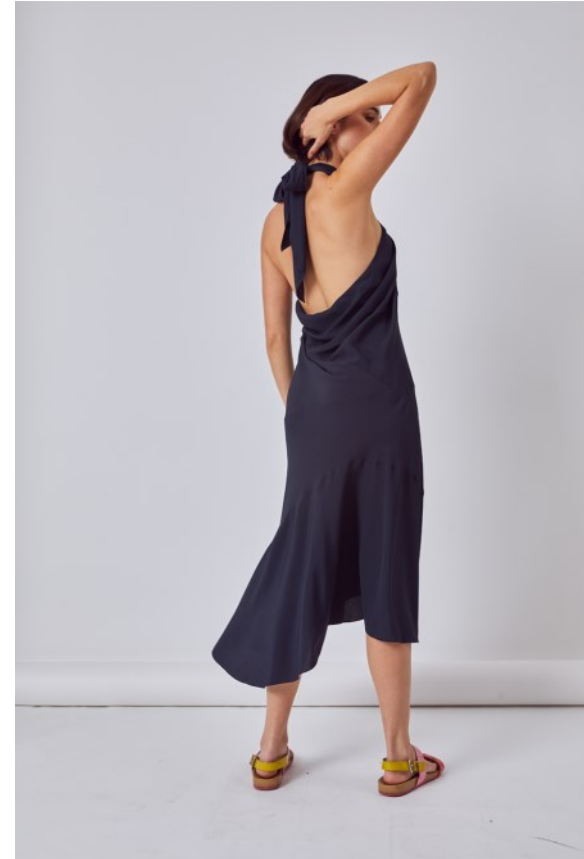
Evaki Sarong—worn as a dress