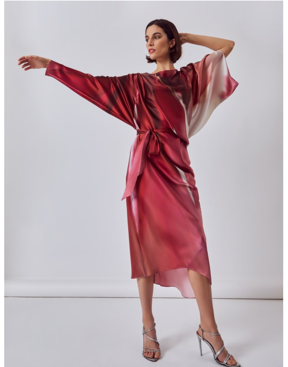
Alruna Artwork print dress