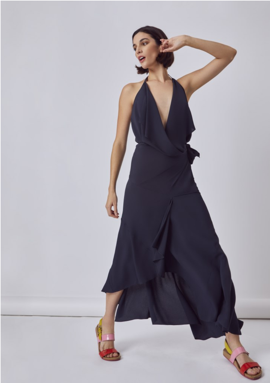
Var top and Evaki Sarong—worn as a skirt