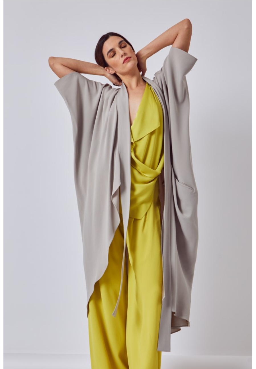
Siya wrap—worn as a jacket