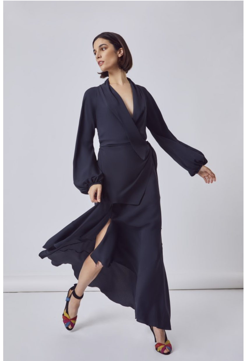
Anukis wrap dress