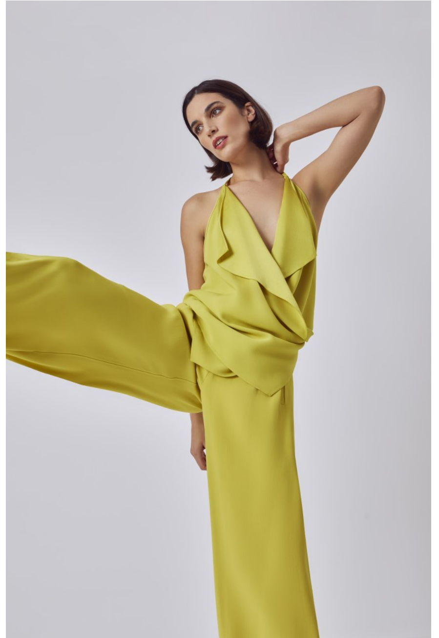
Var top and Oxford Trousers