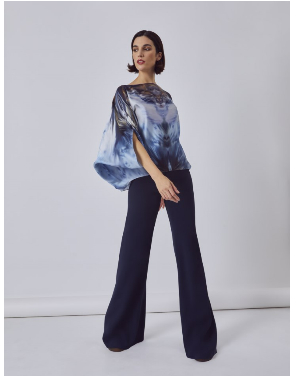
Gaia Artwork print blouse and Magic trousers