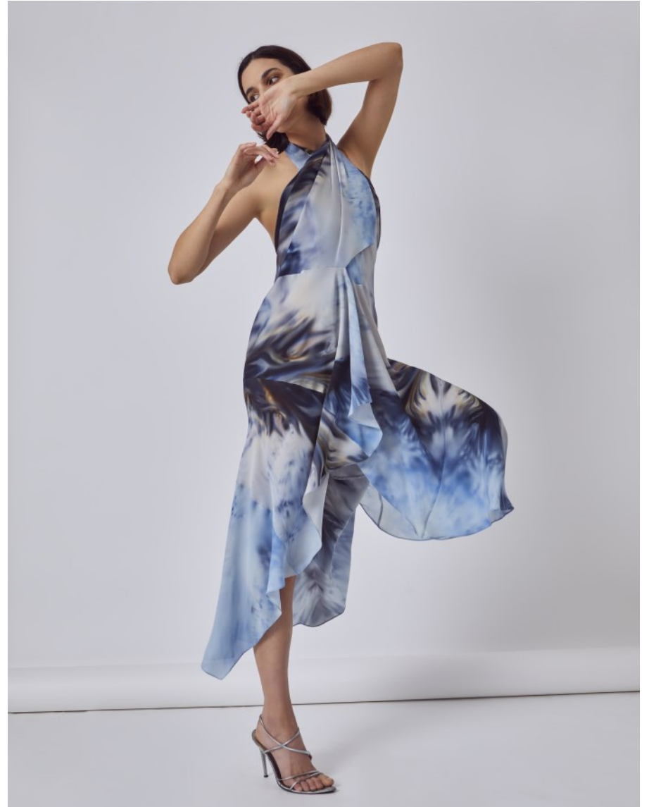
Evaki Artwork print sarong—worn as a dress