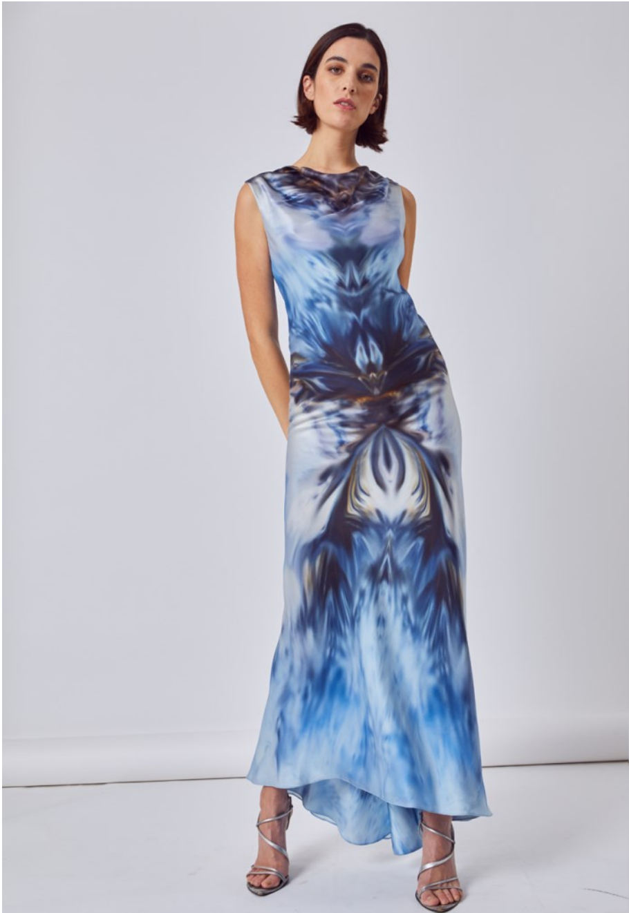
Xanthe Artwork print dress