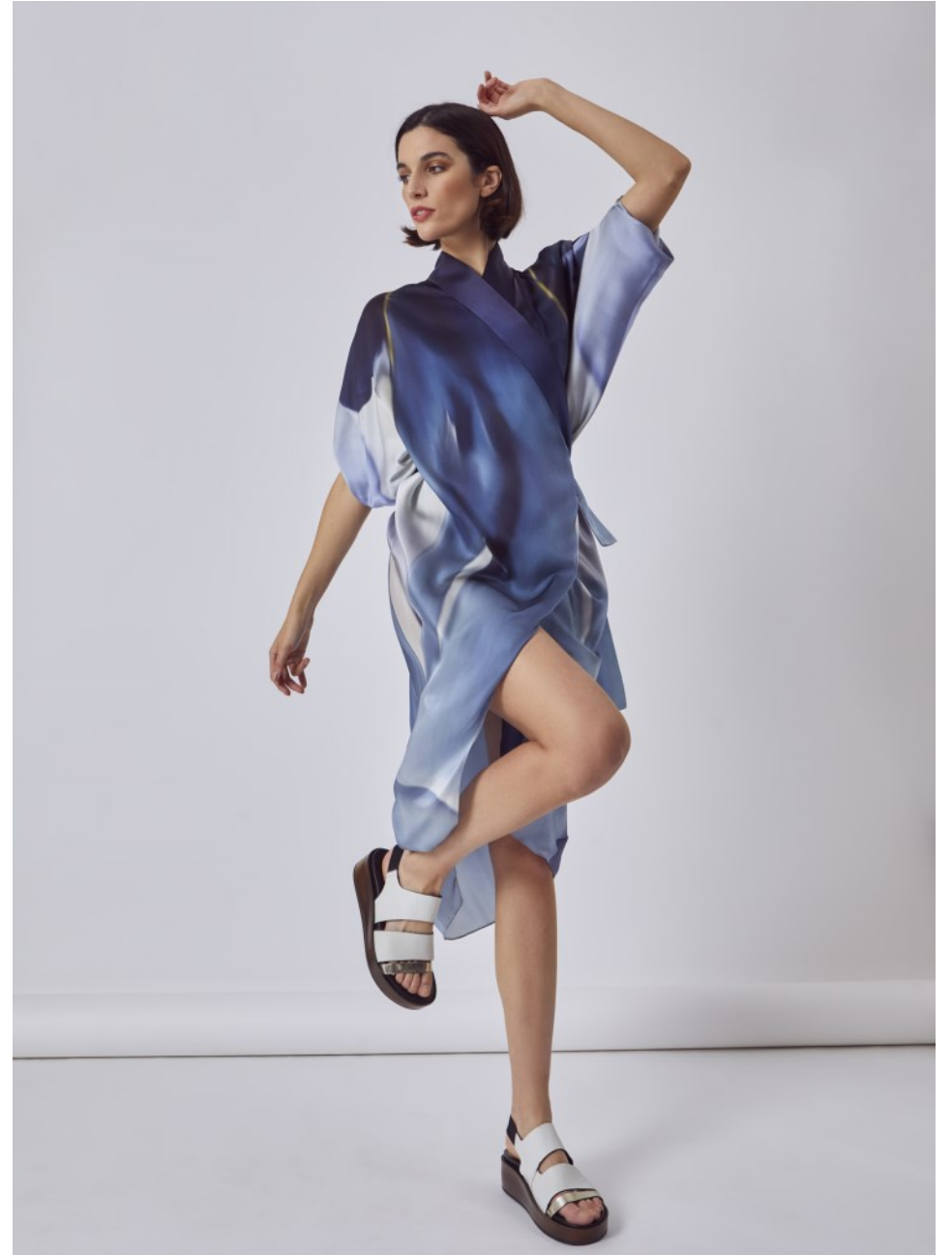
Siya Artwork print wrap—worn as a dress