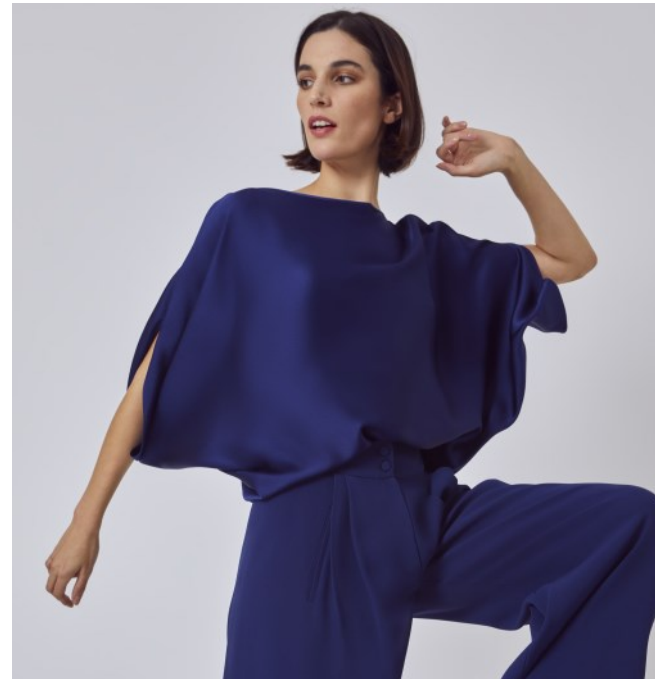
Gaia blouse and Oxford trousers