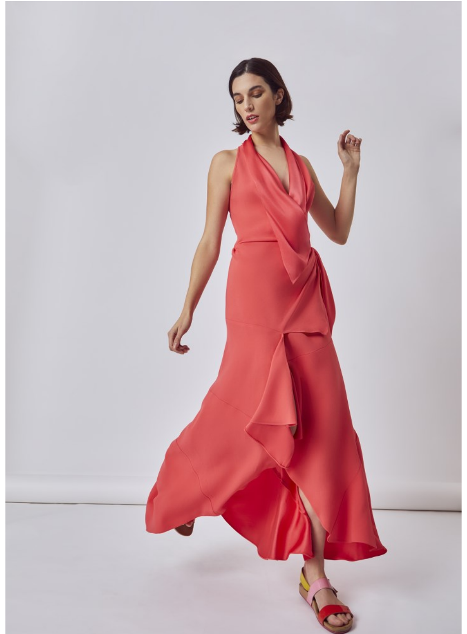
Anukis sleeveless wrap dress