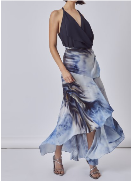
Evaki Artwork print sarong—worn as a skirt