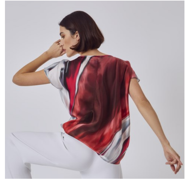
Uzon blouse Arenal Artwork print and Oxford trousers