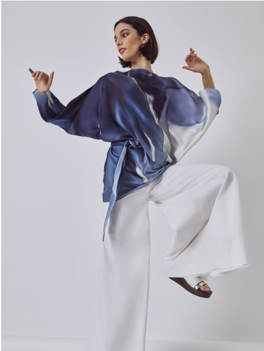
Alruna Artwork print blouse and Katharine trousers