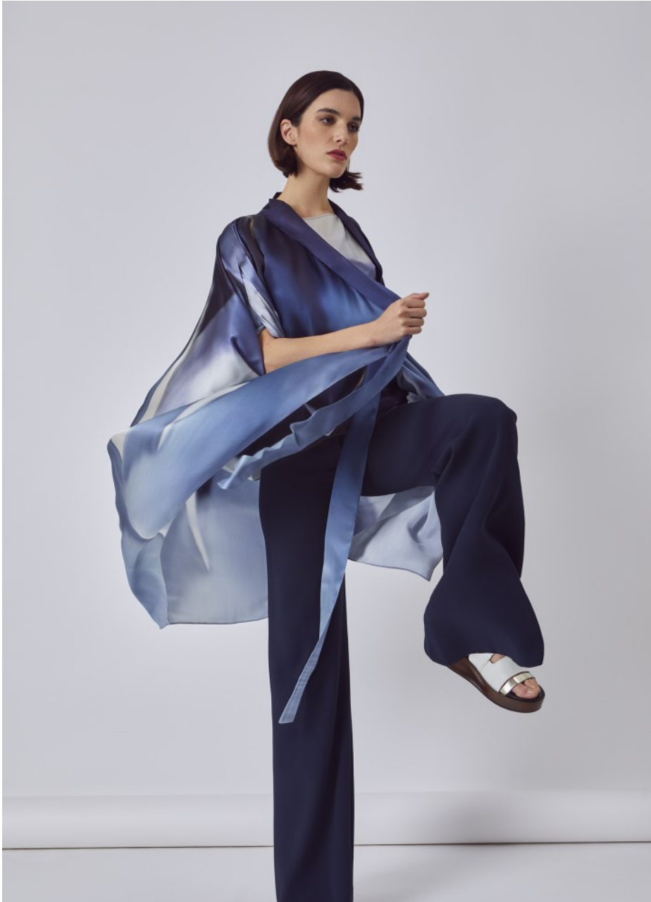
Siya print wrap—worn as a jacket