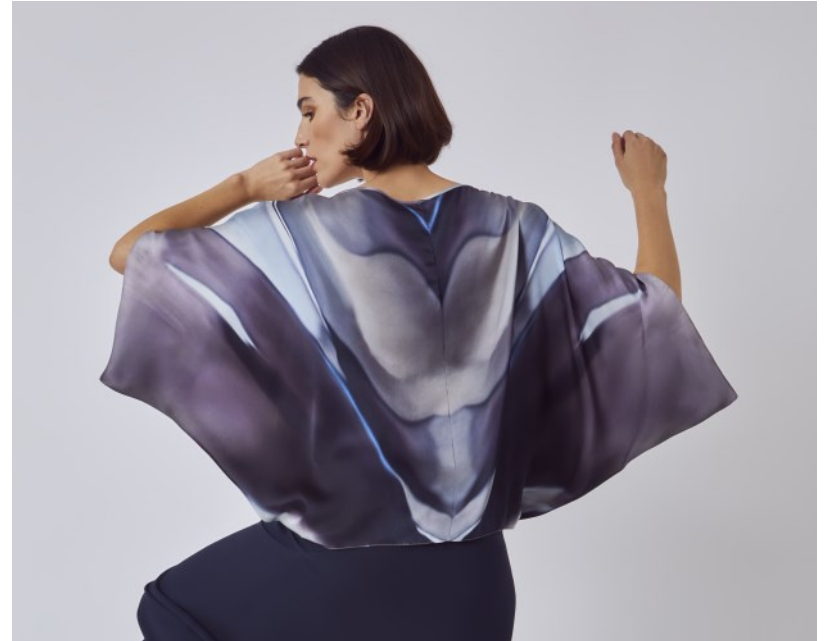
Gaia Artwork print blouse and Xylene skirt