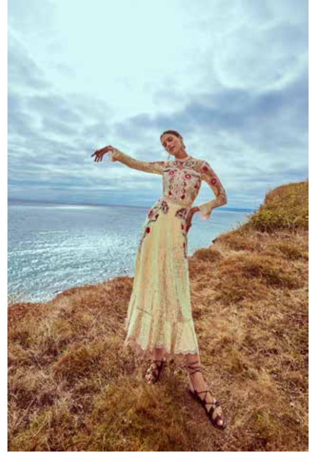
LOOK 68 Remi Midi Show Dress