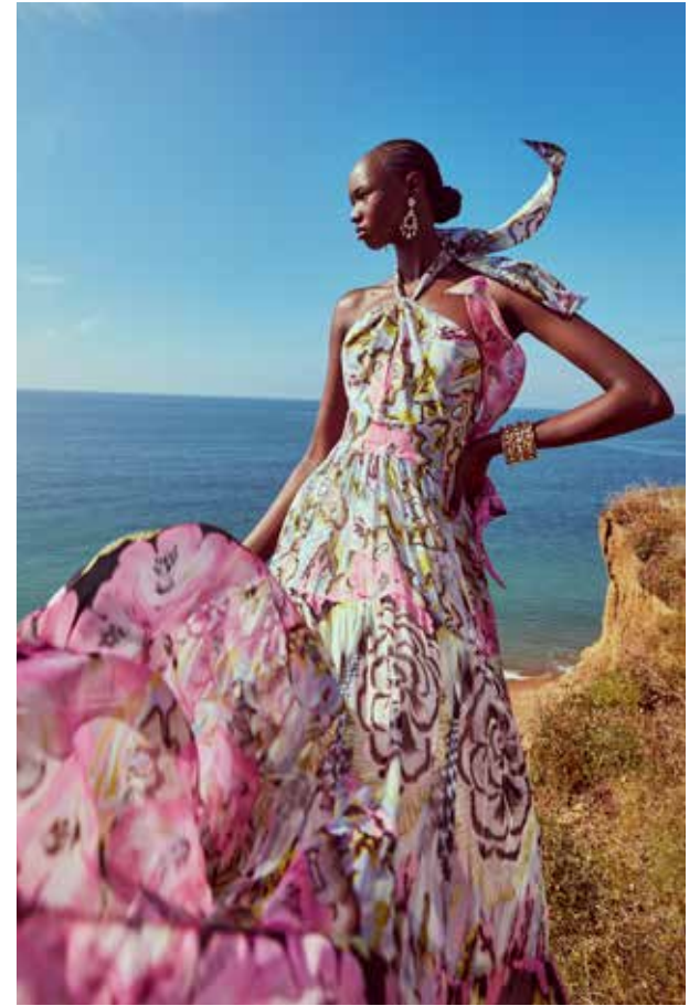
LOOK 60 Rue Halter Dress