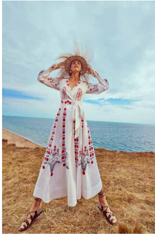
LOOK 56 Langley Wrap Dress