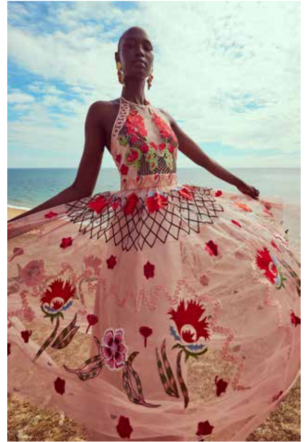
LOOK 35 Remi Halter Dress