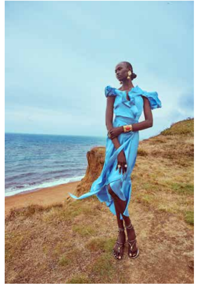
LOOK 63 Lee Strappy Dress