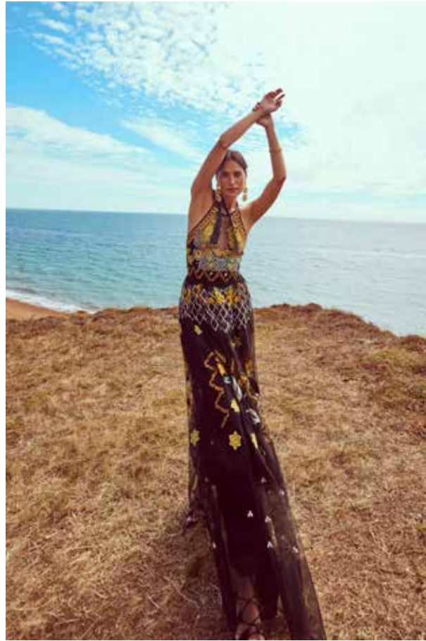
LOOK 40 Remi Halter Dress