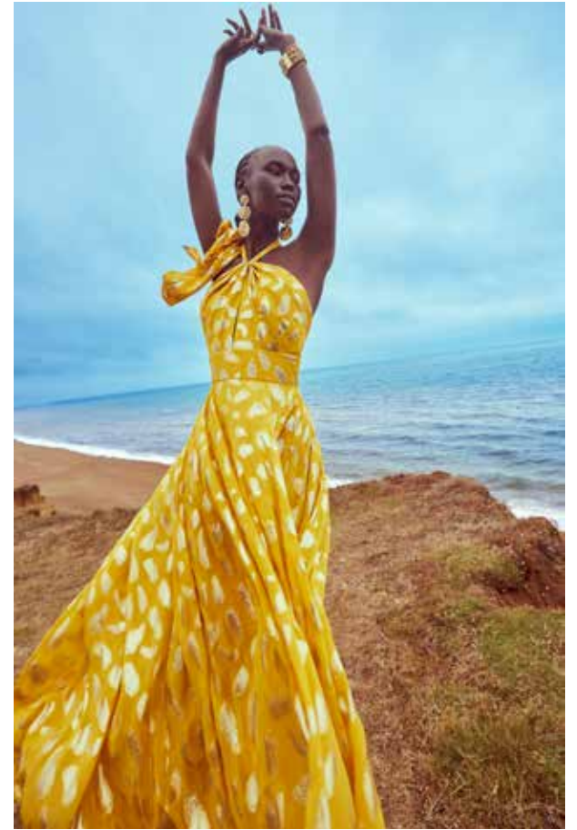
LOOK 33 Lorene Halter Dress