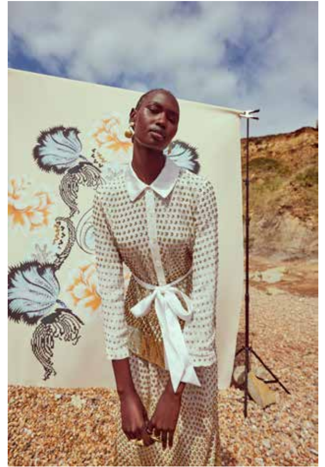
LOOK 44 Brielle Shirt & Brielle Skirt