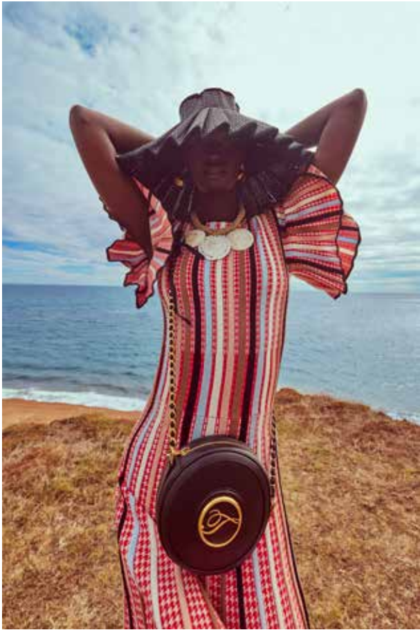
LOOK 55 Vulcan Dress