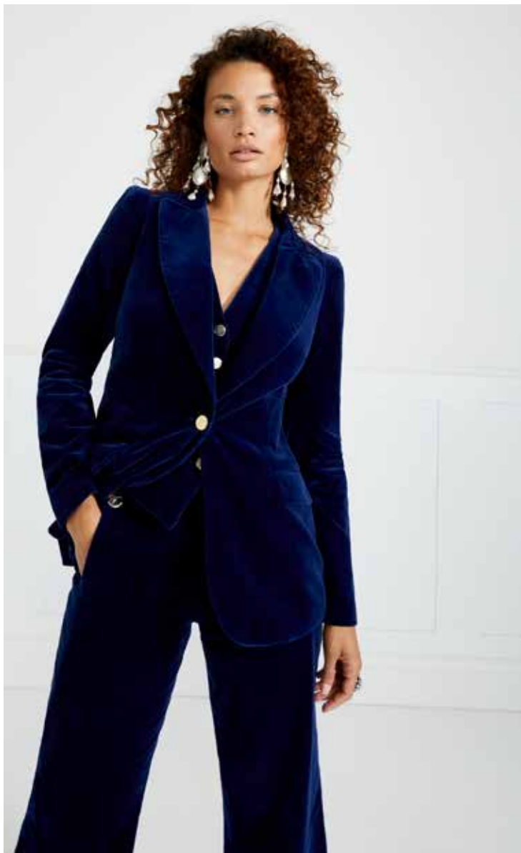
LOOK 6 Clove Suit