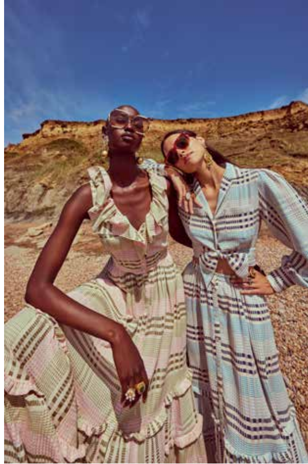
LOOK 46 & 47 Curtis Dress in Indian Pink, Curtis Tie Shirt & Curtis Skirt in Cornflower