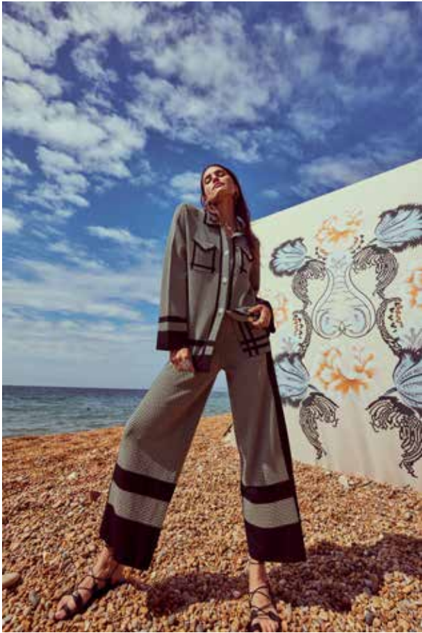
LOOK 42 Orelie Jacket, Orelie Trousers in Black