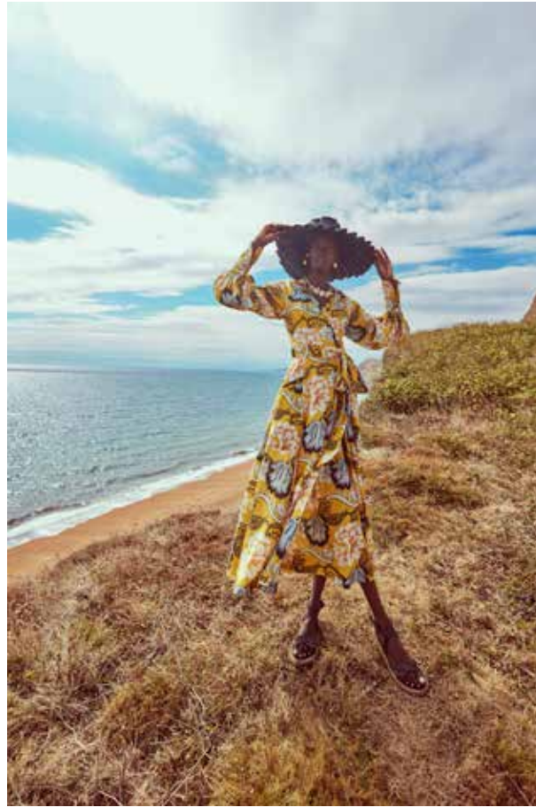
LOOK 43 Olive Wrap Dress