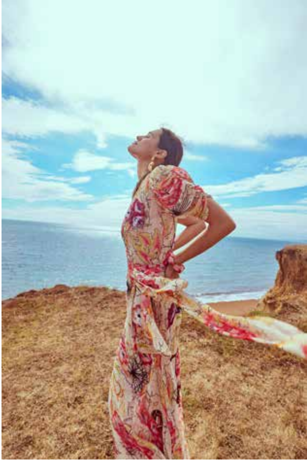
LOOK 66 Chessie Wrap Dress