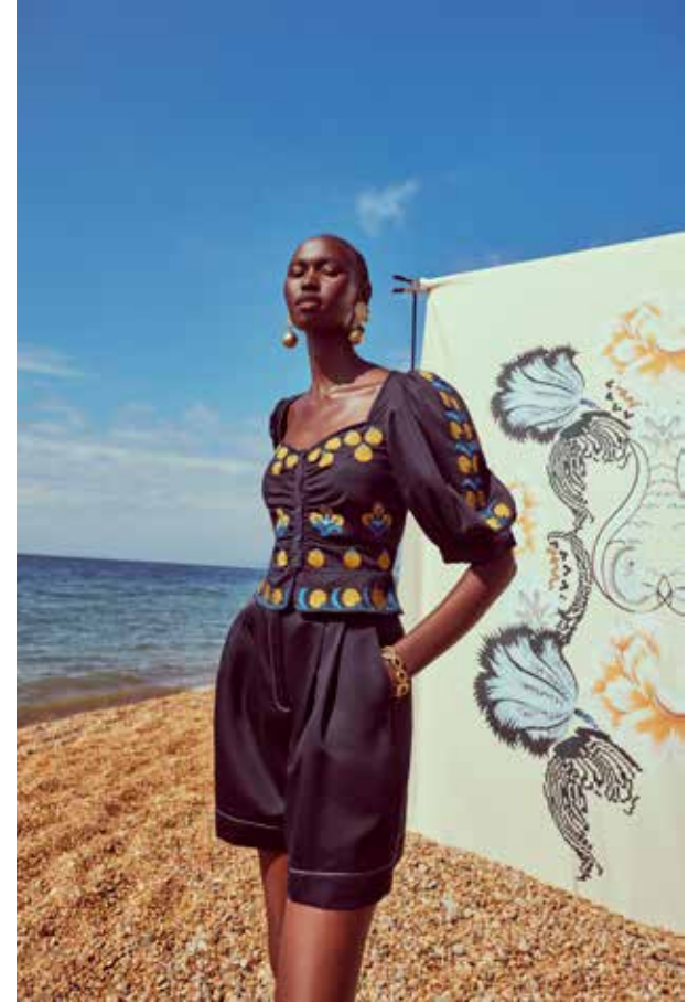
LOOK 48 Langley Top & Orville Shorts