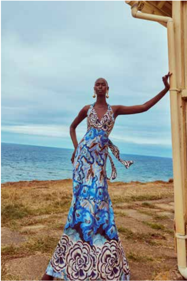
LOOK 61 Rue Strappy Dress