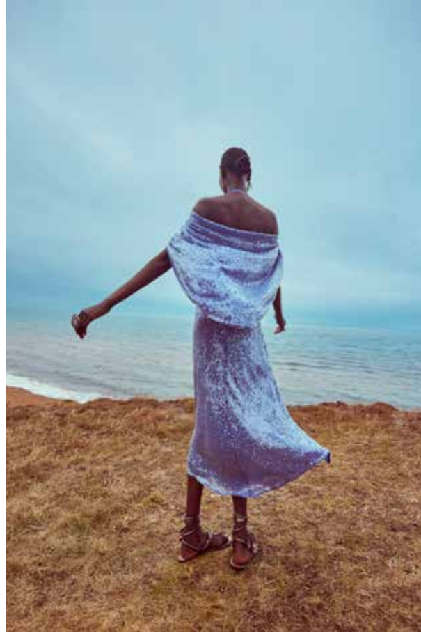
LOOK 67 Odessa Sequin Strappy Dress