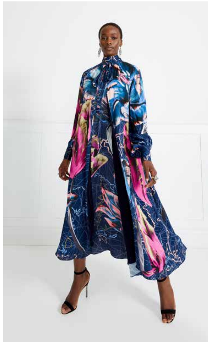
LOOK 7 Dora Print Coat