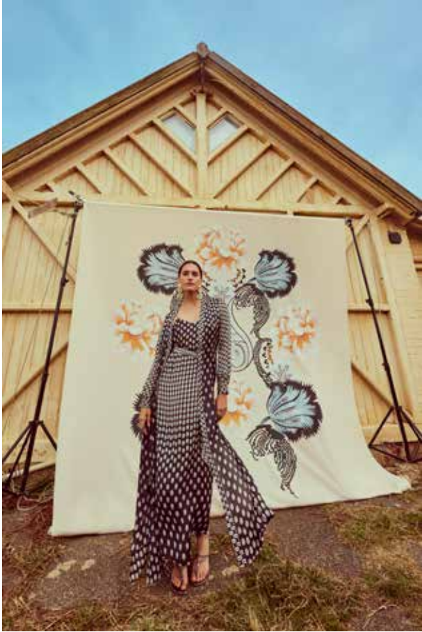
LOOK 45 Cowrie Slip Dress & Cowrie Coat