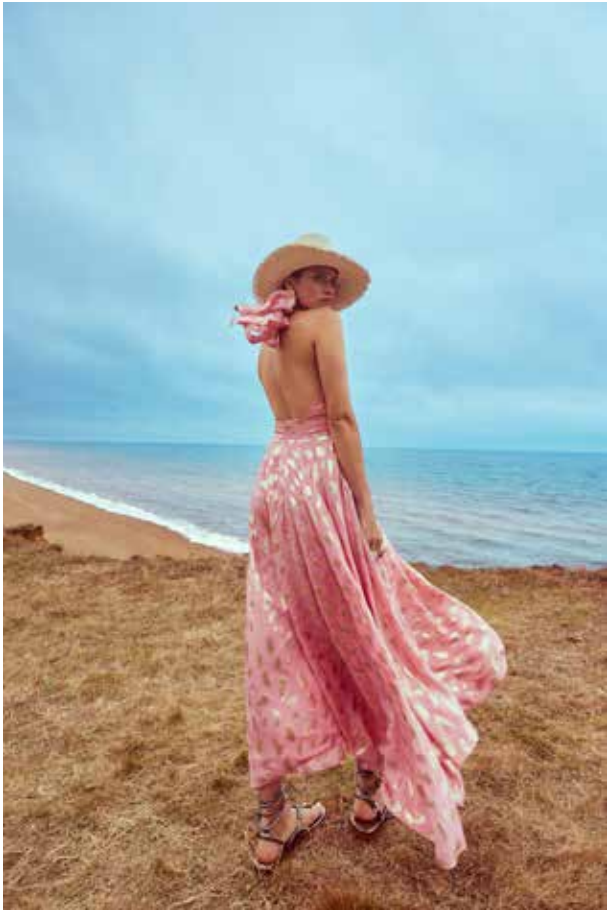
LOOK 58 Lorene Halter Dress