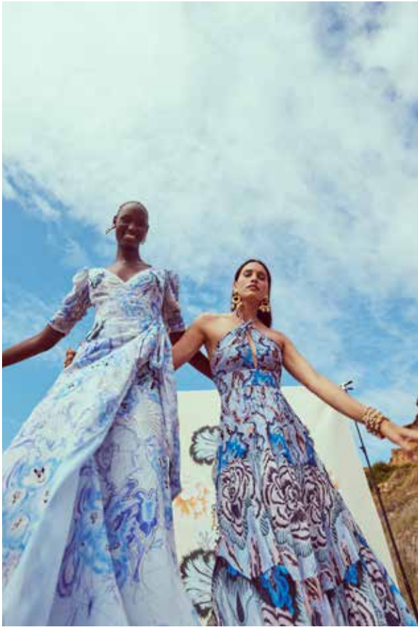
LOOK 64 & 65 Chessie Wrap Dress & Rue Halter Dress