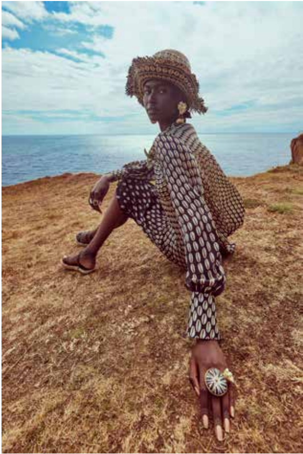
LOOK 31 Cowrie Sleeved Dress