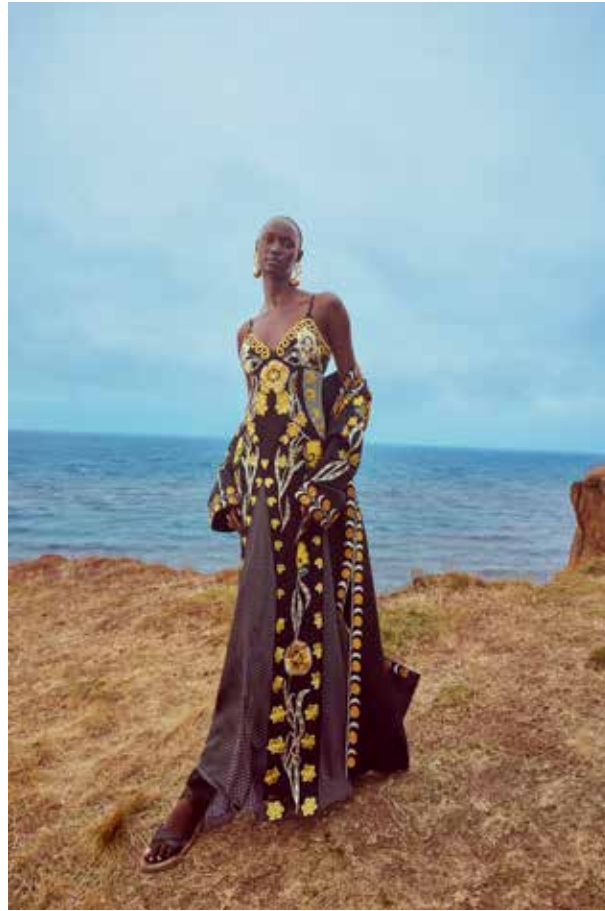
LOOK 32 Remi Strappy Dress & Remi Kimono