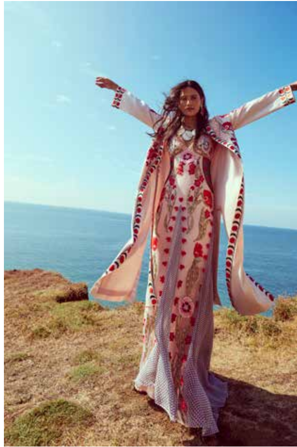
LOOK 34 Remi Strappy Dress & Remi Kimono