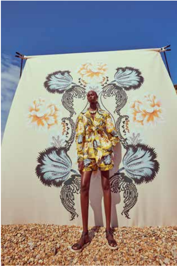
LOOK 39 Olive Shorts & Olive Jacket