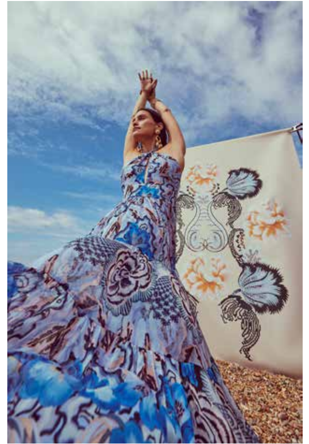
LOOK 65 Rue Halter Dress