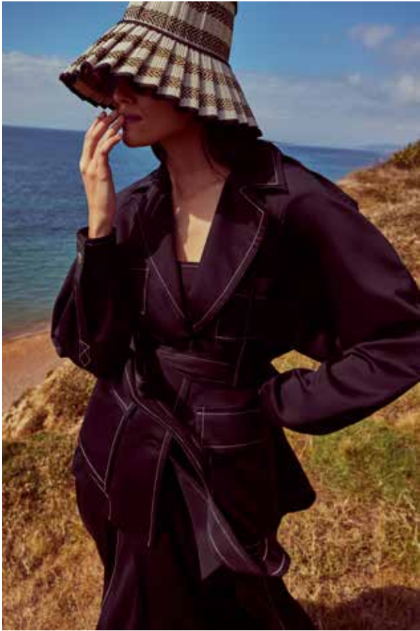
LOOK 49 Orville Jacket & Orville Midi Dress