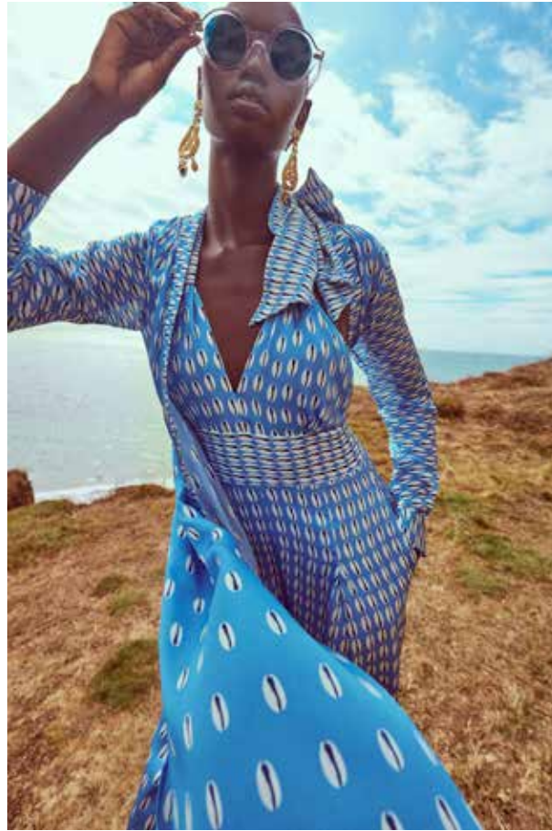
LOOK 62 Cowrie Jumpsuit & Cowrie Coat