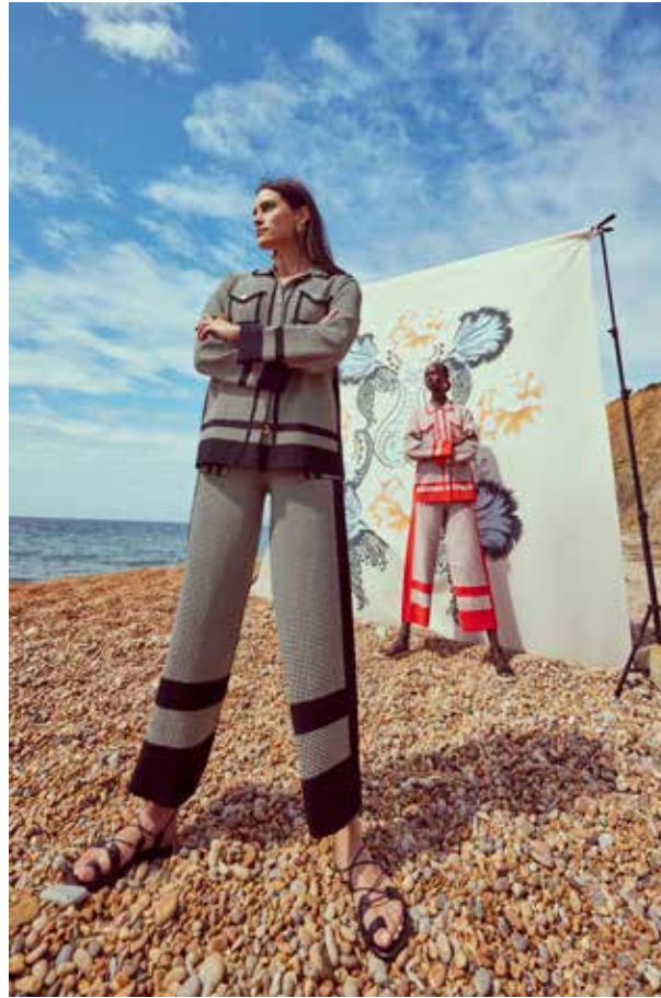
LOOK 42 & 57 Orelie Jacket, Orelie Trouser in Dark Black & Chocolate