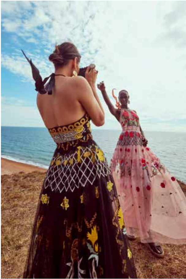
LOOK 40 & 35 Remi Halter Dress in Black & Blush