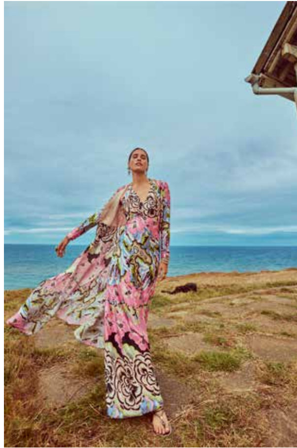
LOOK 59 Rue Strappy Dress & Rue Coat