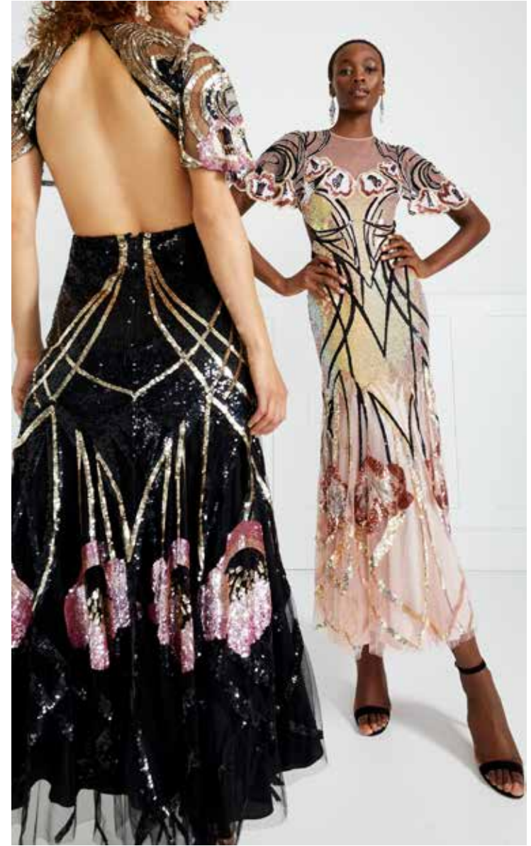
LOOK 23 Natalia Gown in Black & Rosewater