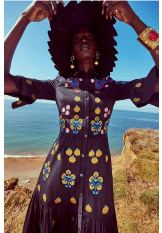
LOOK 50 Langley Shirt Dress