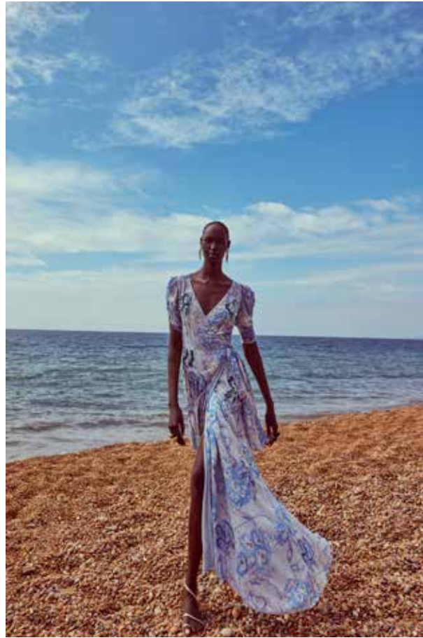
LOOK 64 Chessie Wrap Dress