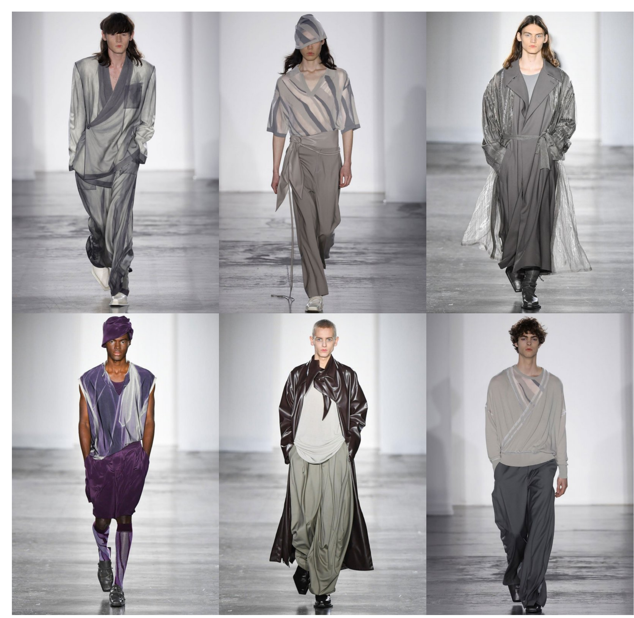
Runway - LONDON FASHION WEEK 2023