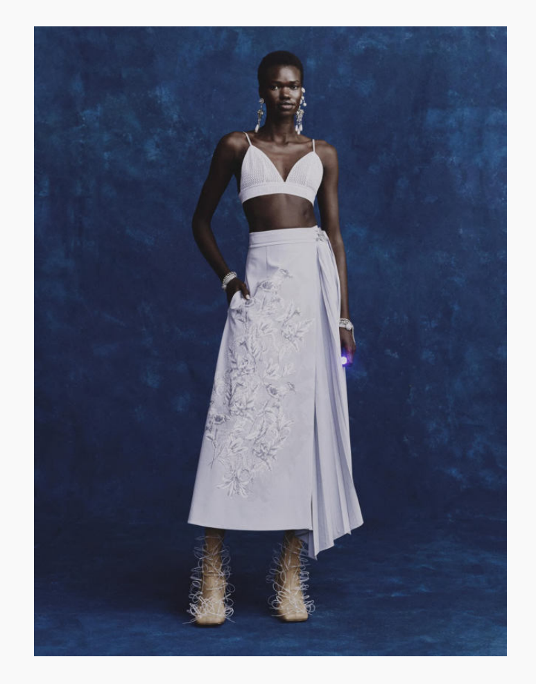
LOOK 47 LOOK 48