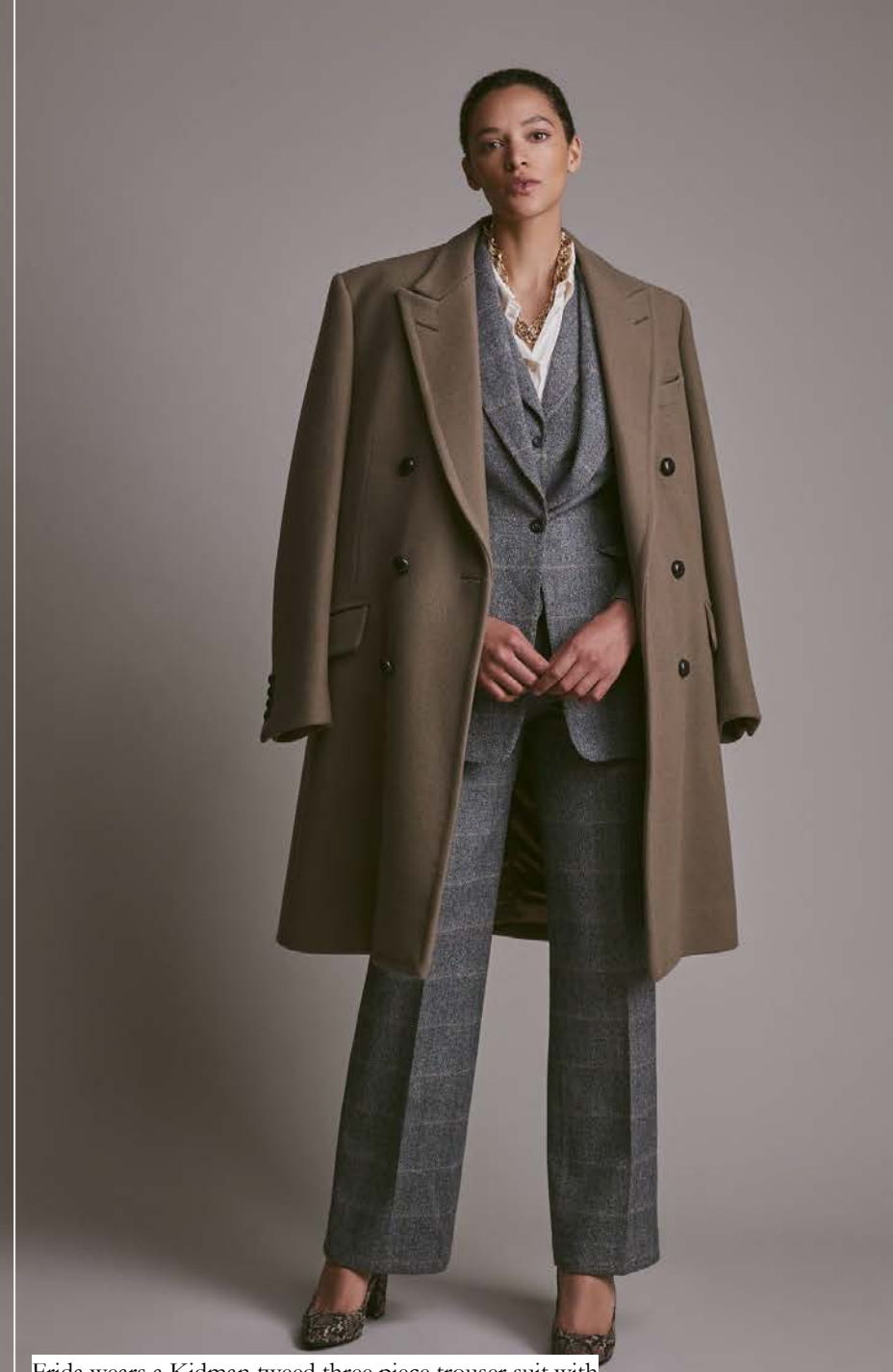
Frida wears a Kidman tweed three piece trouser suit with bespoke silk blouse and mens bespoke overcoat