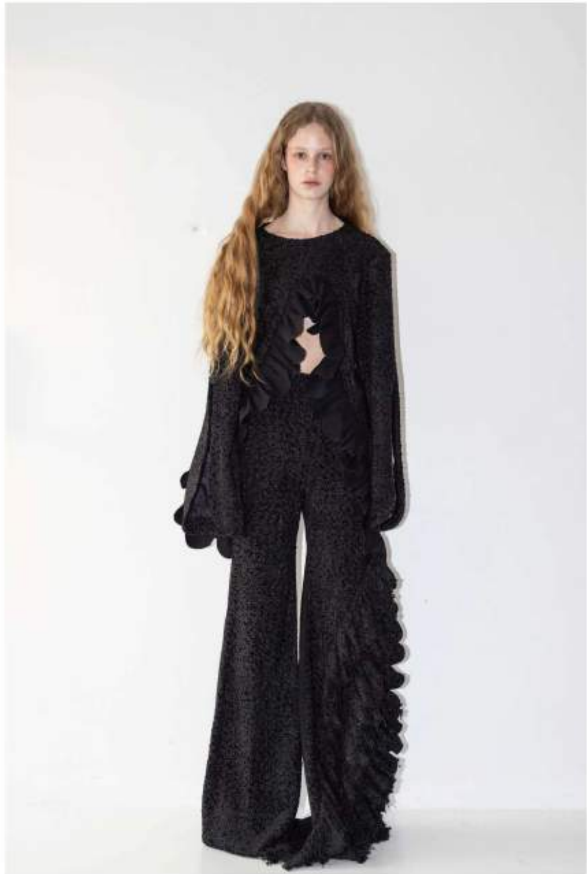
Bloom Jacket / Bloom Trousers