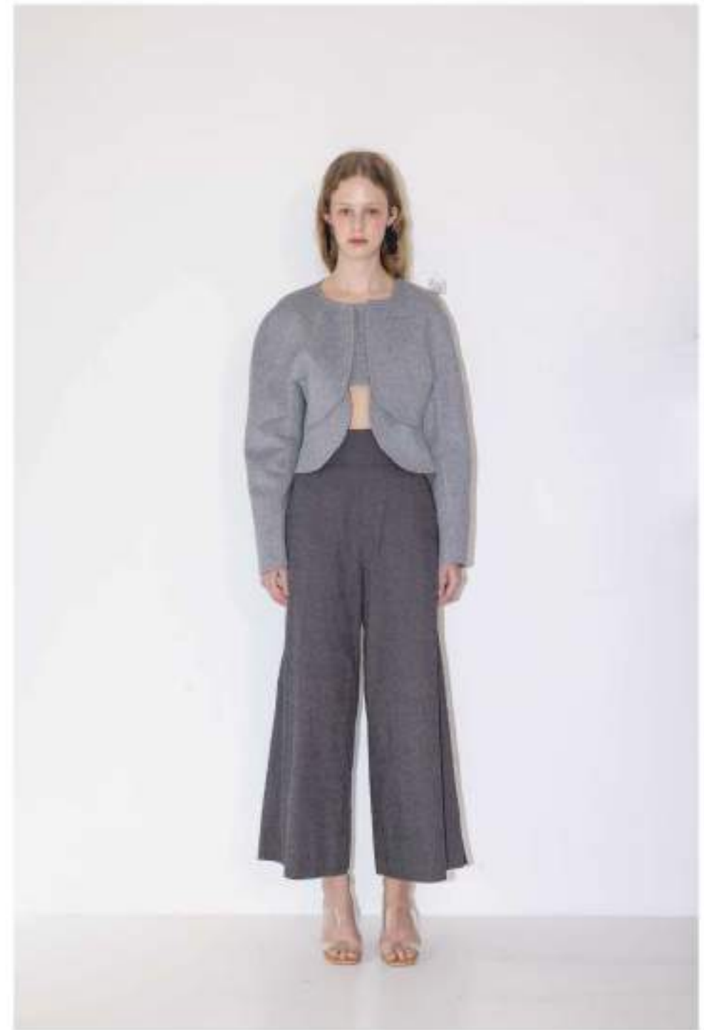
Madame Butterfly Short Jacket Fleur Wide Trouser