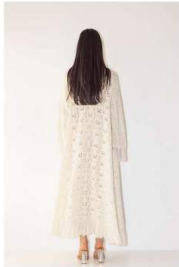
Freya Maxi Dress/ Freyja Dress