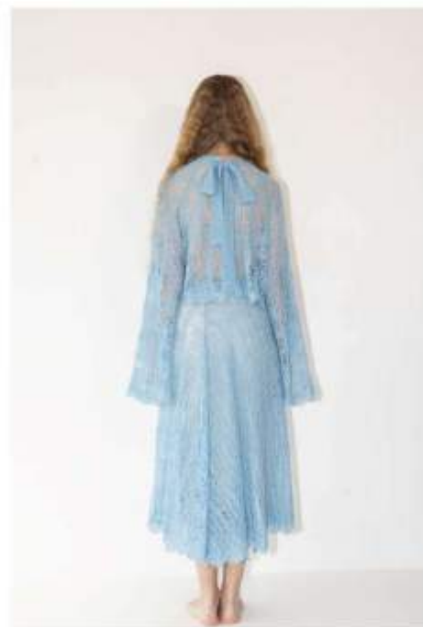
Chou Lace knit Top Chou Lace Knit Skirt