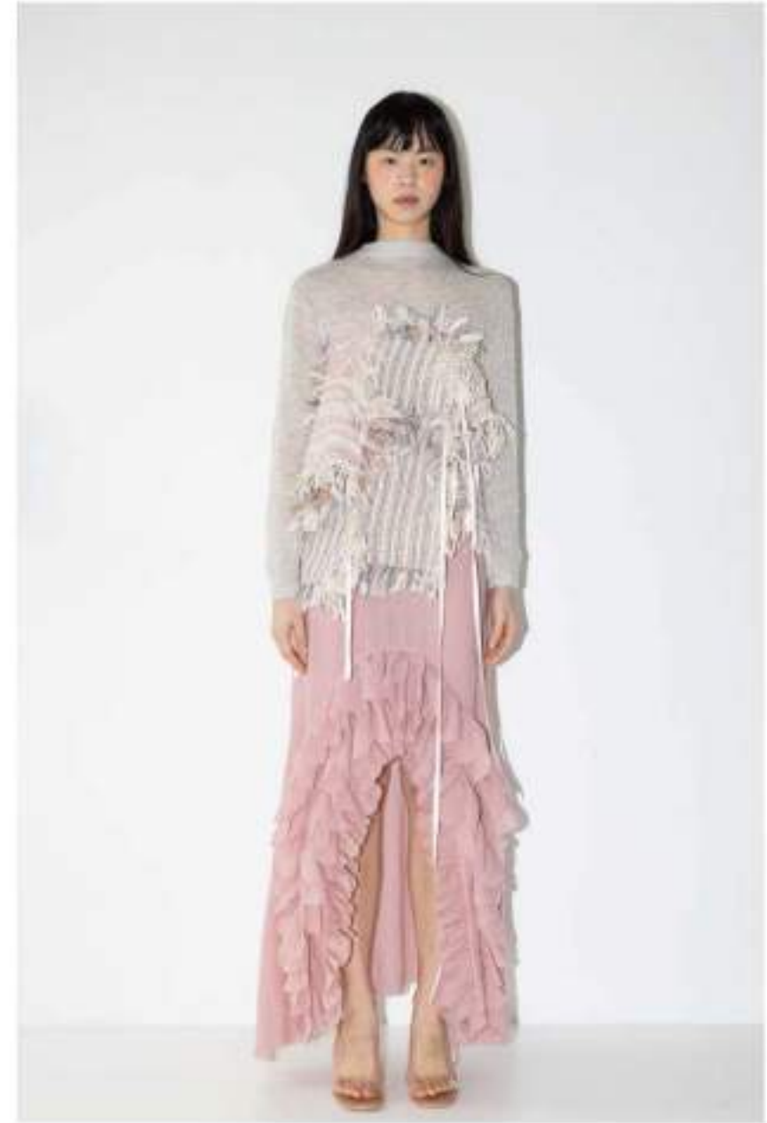
Butterfly Intarsia Top