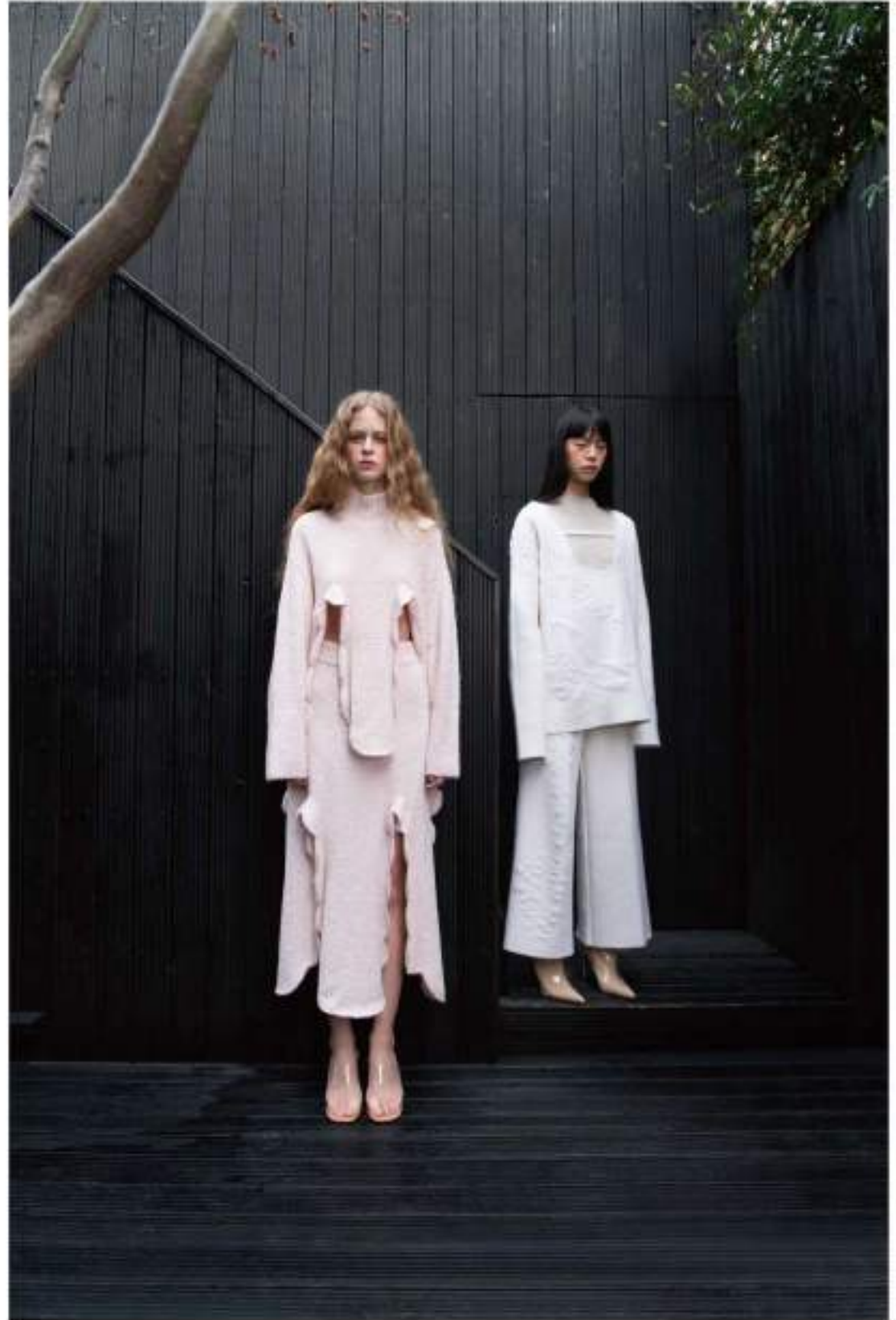
Iris Knit Top / Iris Knit Skirt / Fleur Jacquard Top / Fleur Jacquard Trouser