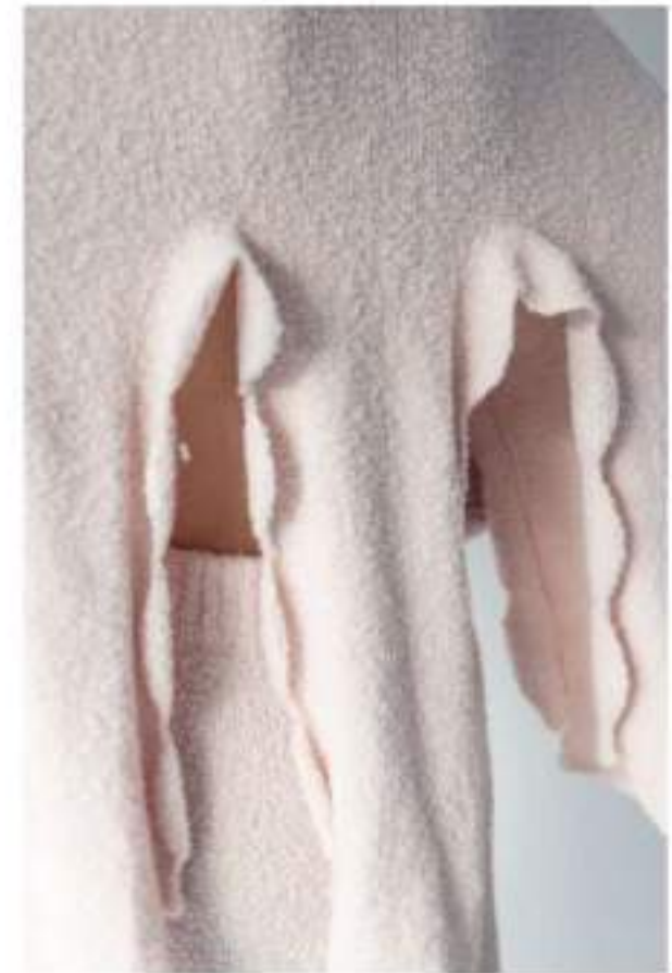
Iris Knit Top / Iris Knit Skirt