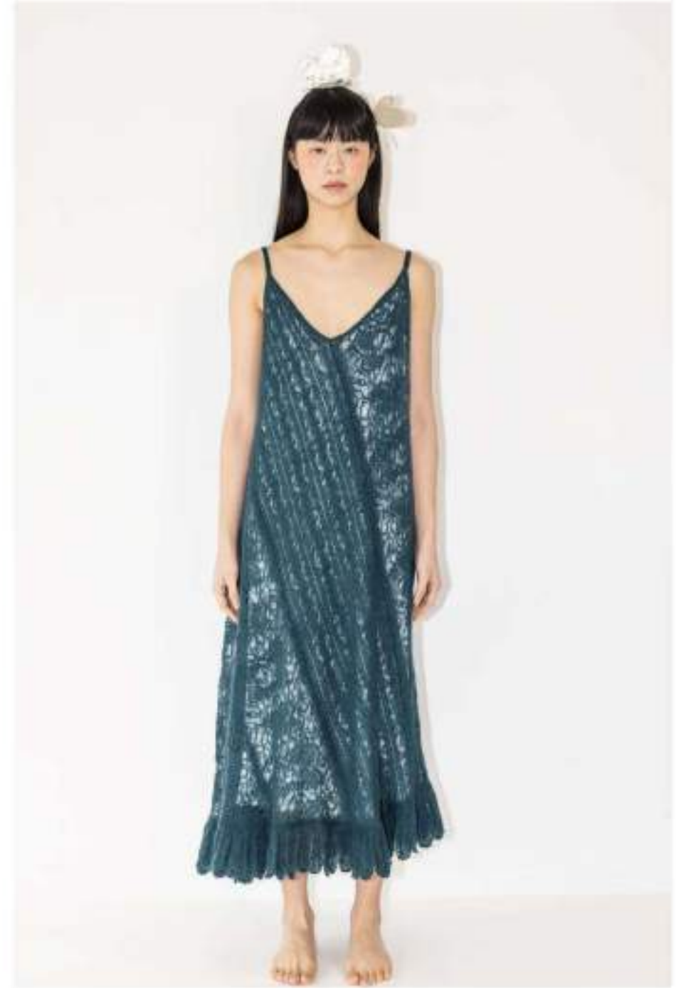
Chou Lace Knit Dress