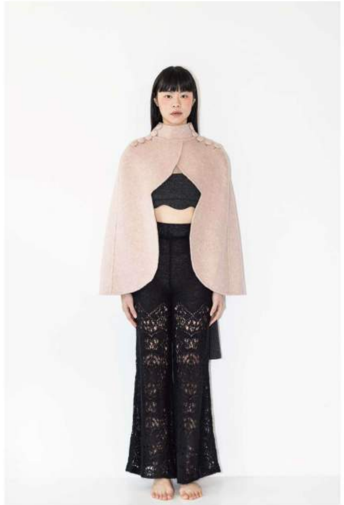
Lily Cape / Chou Lace knit Trousse