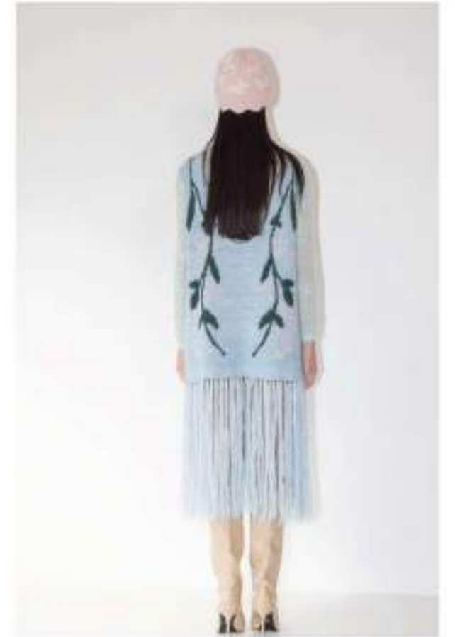
Fleur Jacquard Dress / Butterfly Jacquard Hat