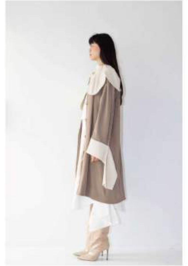
Petal Wool Coat