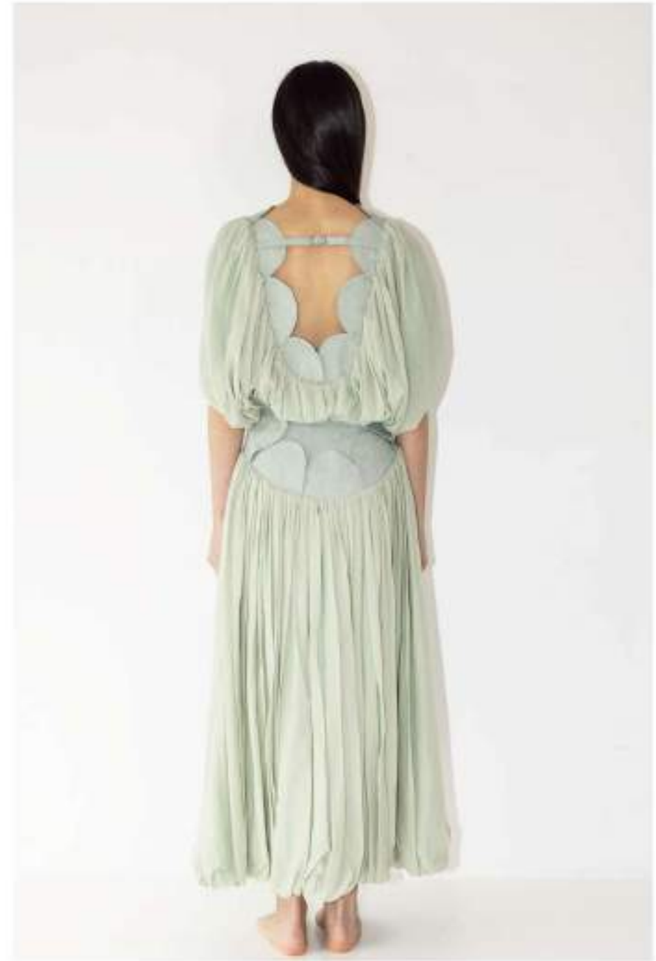
Hug Cape / Hug Skirt