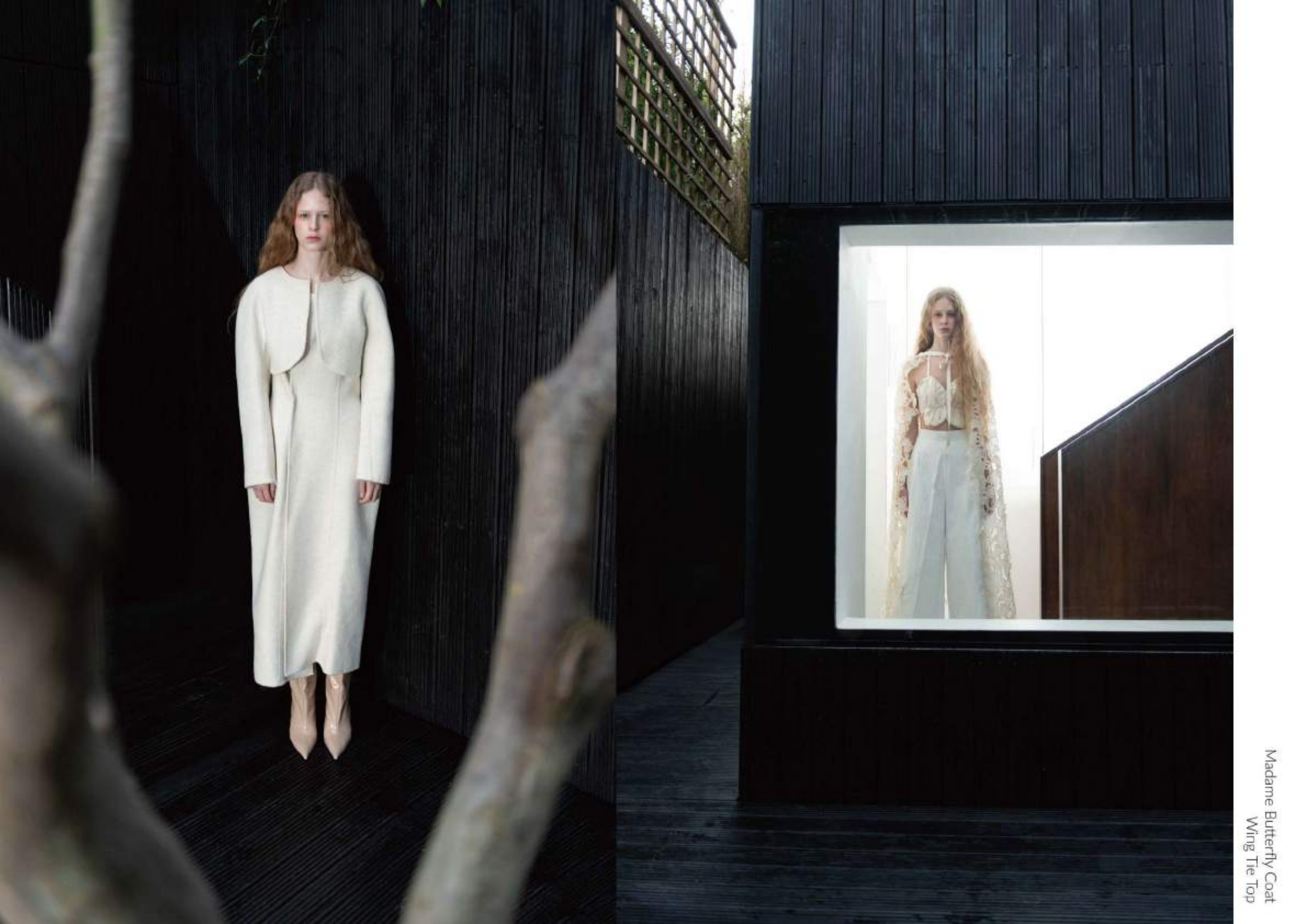
Madame Butterfly Coat Wing Tie Top