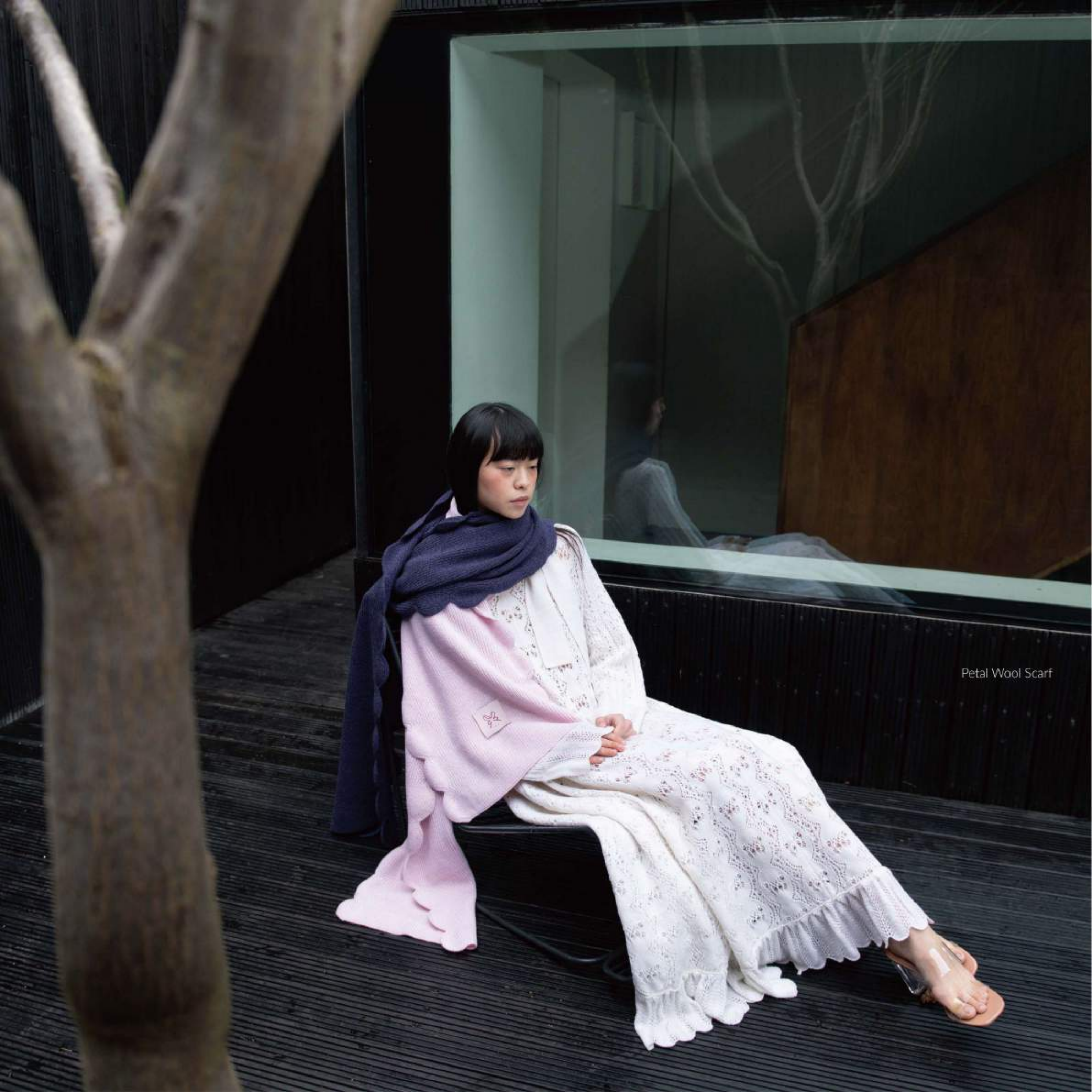
Petal Wool Scarf