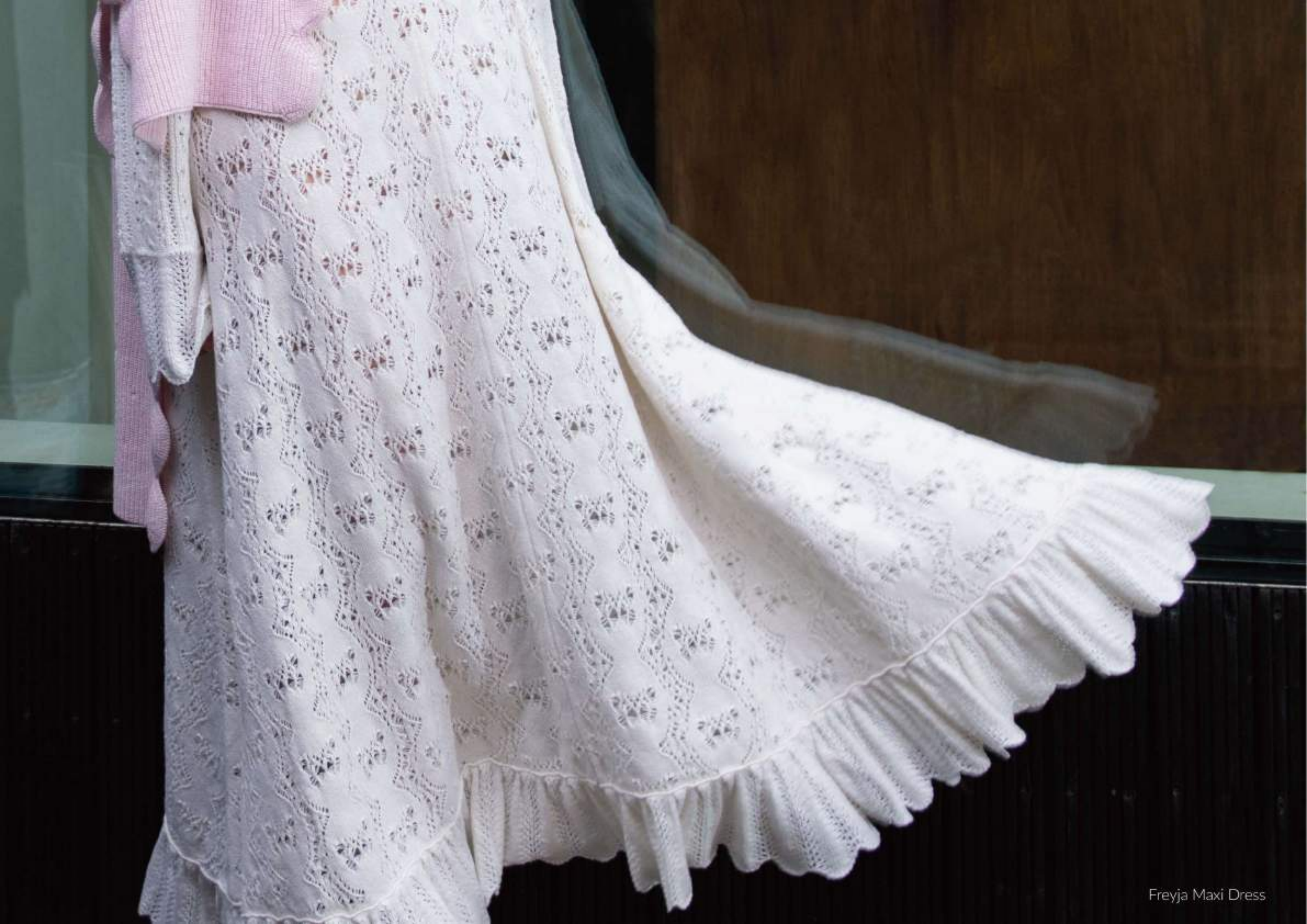
Freyja Maxi Dress