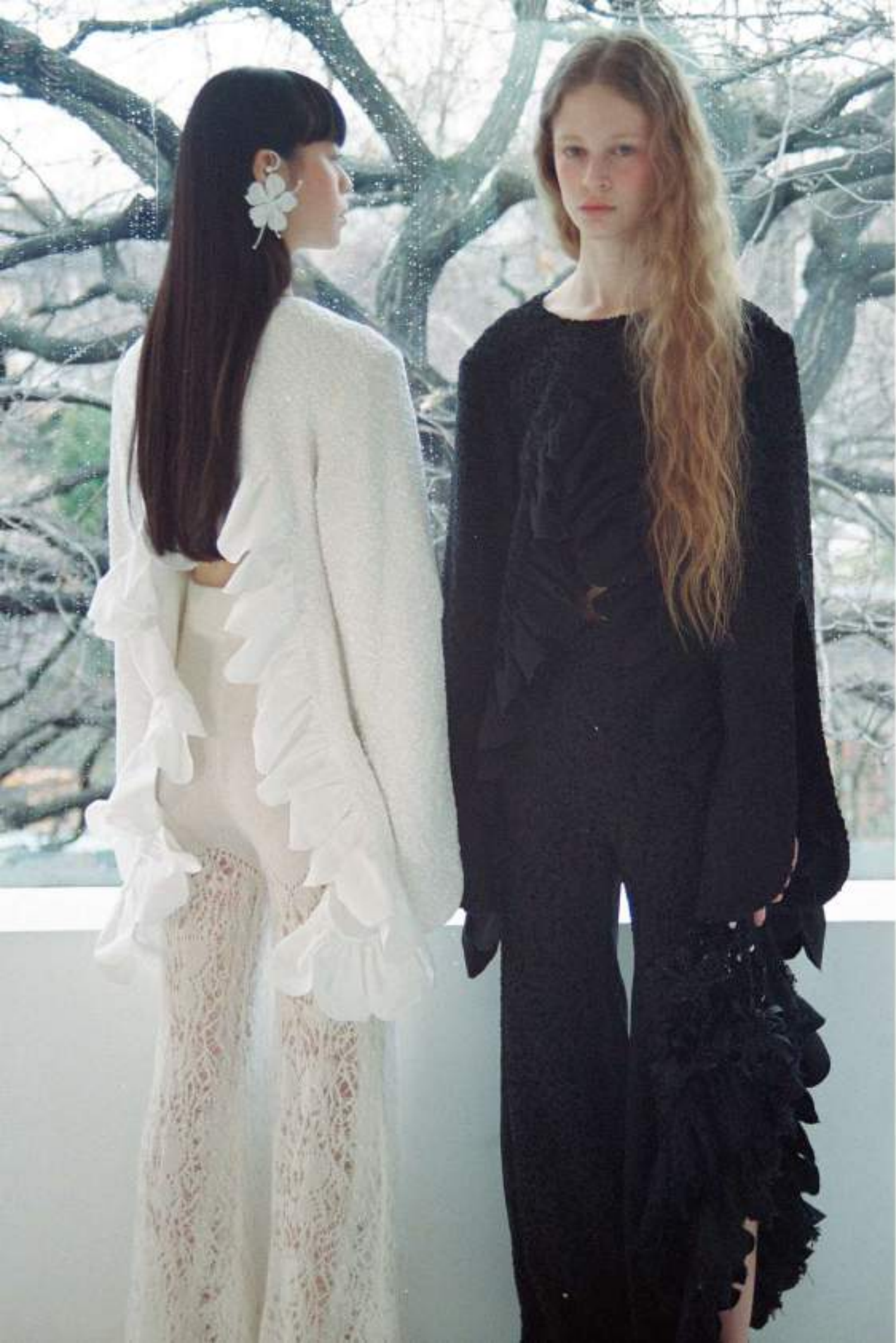
Bloom Jacket / Bloom Trouser