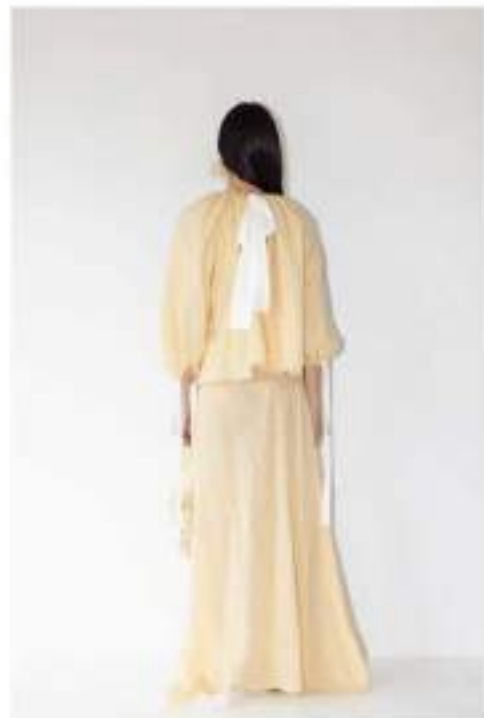
Gardenia Top / Gardenia Skirt