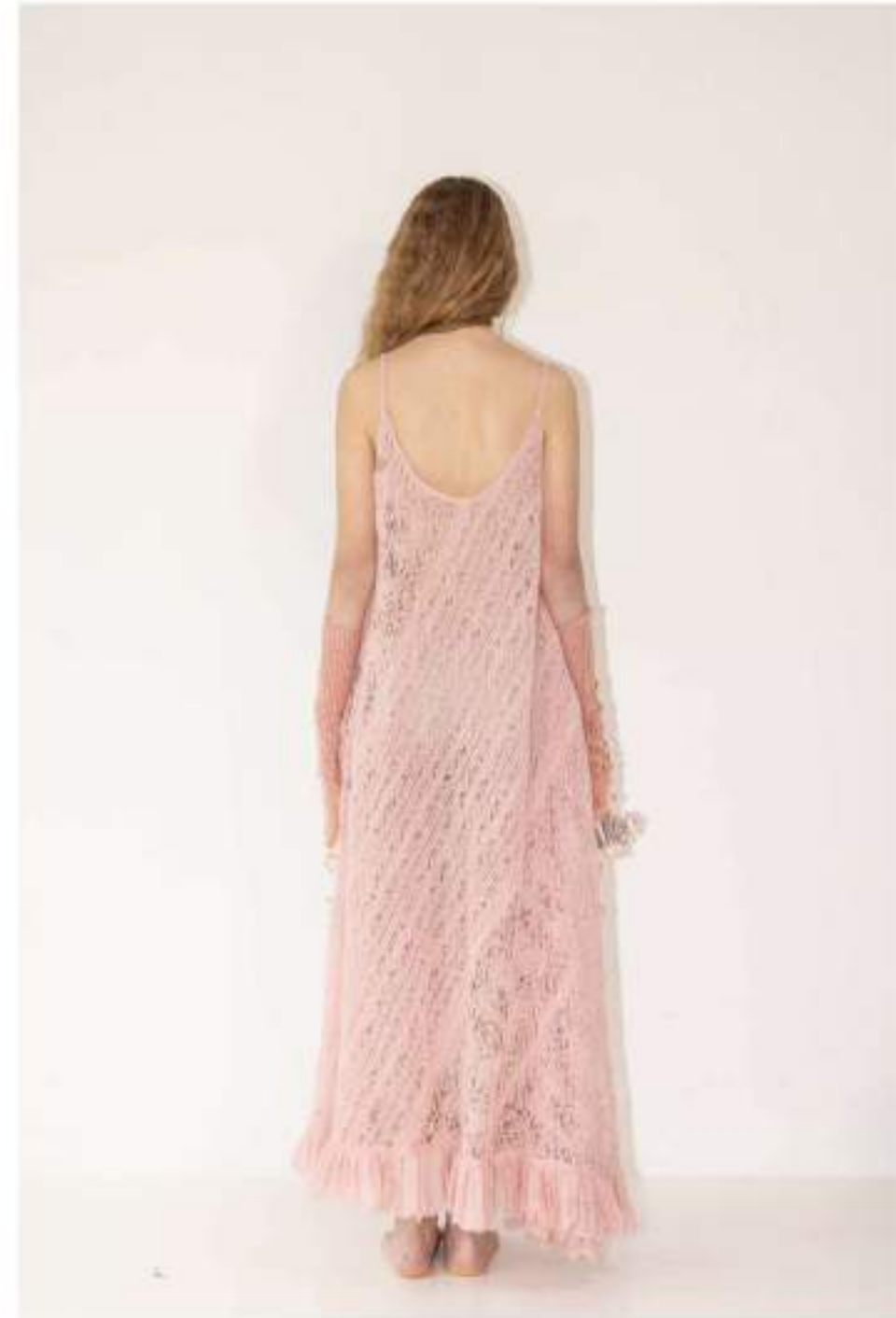
Chou Lace Knit Maxi Dress