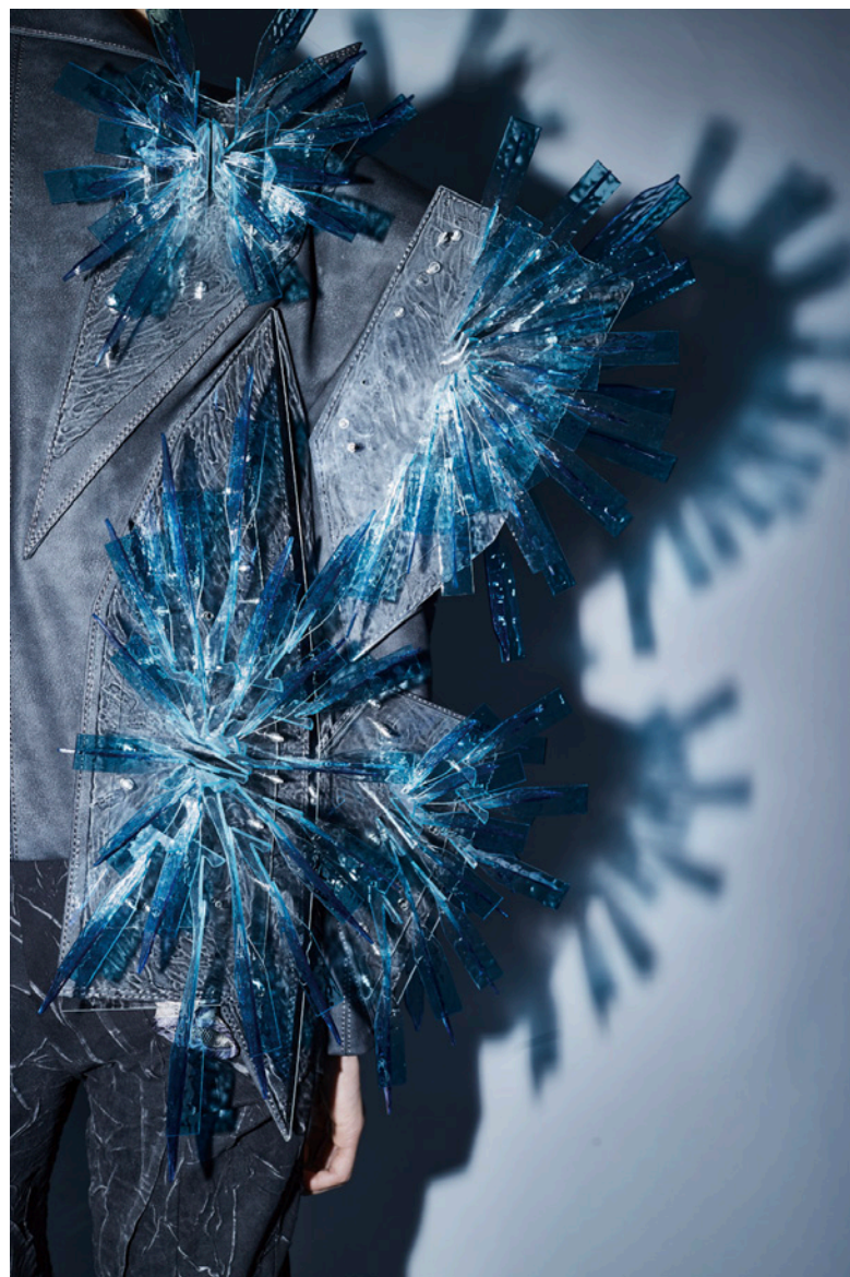
siyun huang © - 2023 Autumn / Winter - Kinetic Ode to Underwater Wonderland -