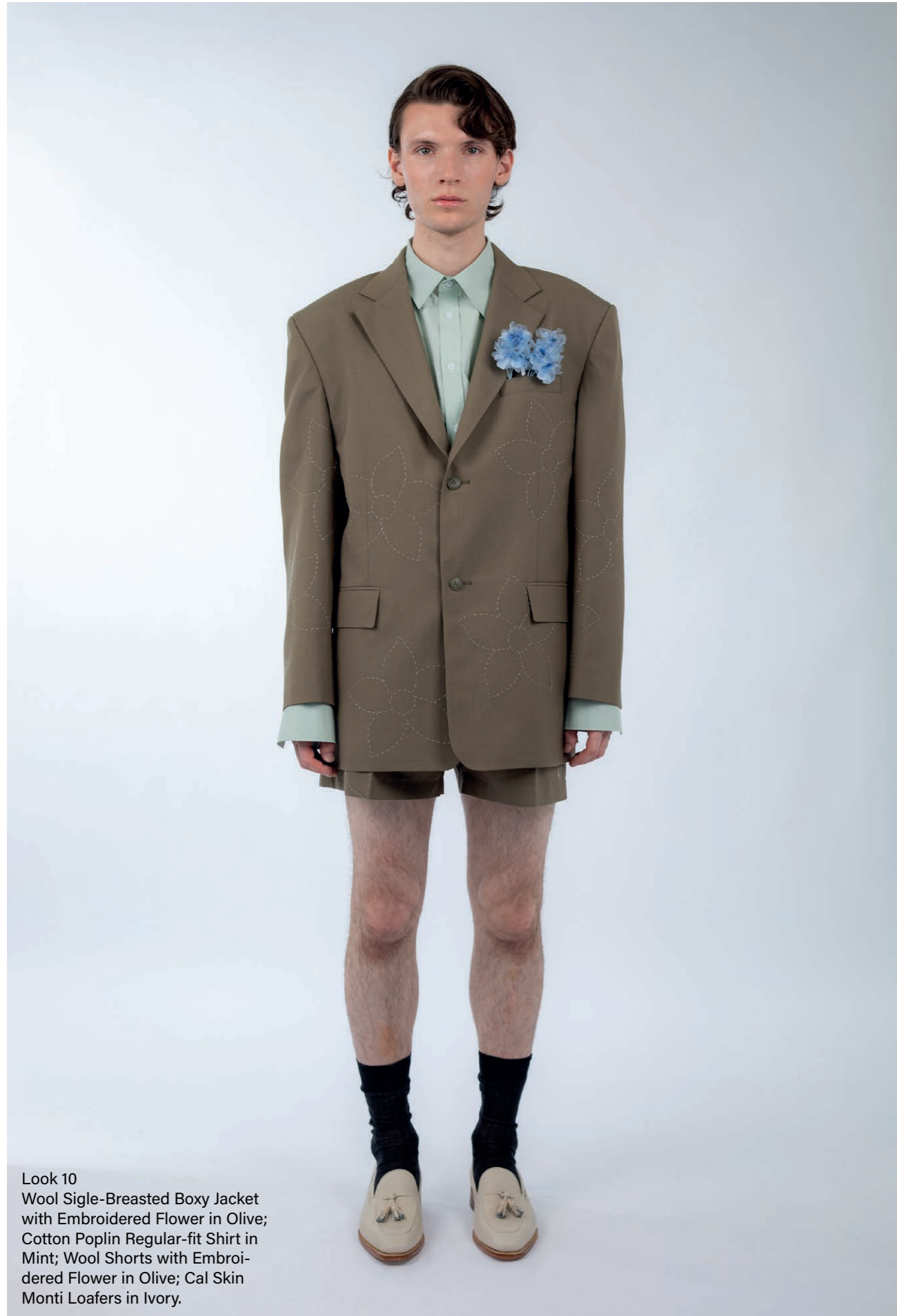
Look 10 Wool Single-Breasted Boxy Jacket with Embroidered Flower in Olive; Cotton Poplin Regular-fit Shirt in Mint; Wool Shorts with Embroi- dered Flower in Olive; Cal Skin Monti Loafers in Ivory.