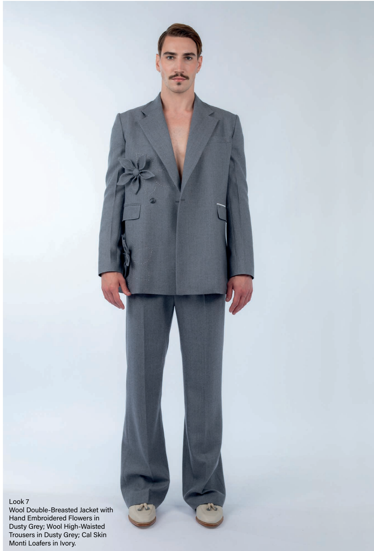
Look 7 Wool Double-Breasted Jacket with Hand Embroidered Flowers in Dusty Grey; Wool High-Waisted Trousers in Dusty Grey; Cal Skin Monti Loafers in Ivory.