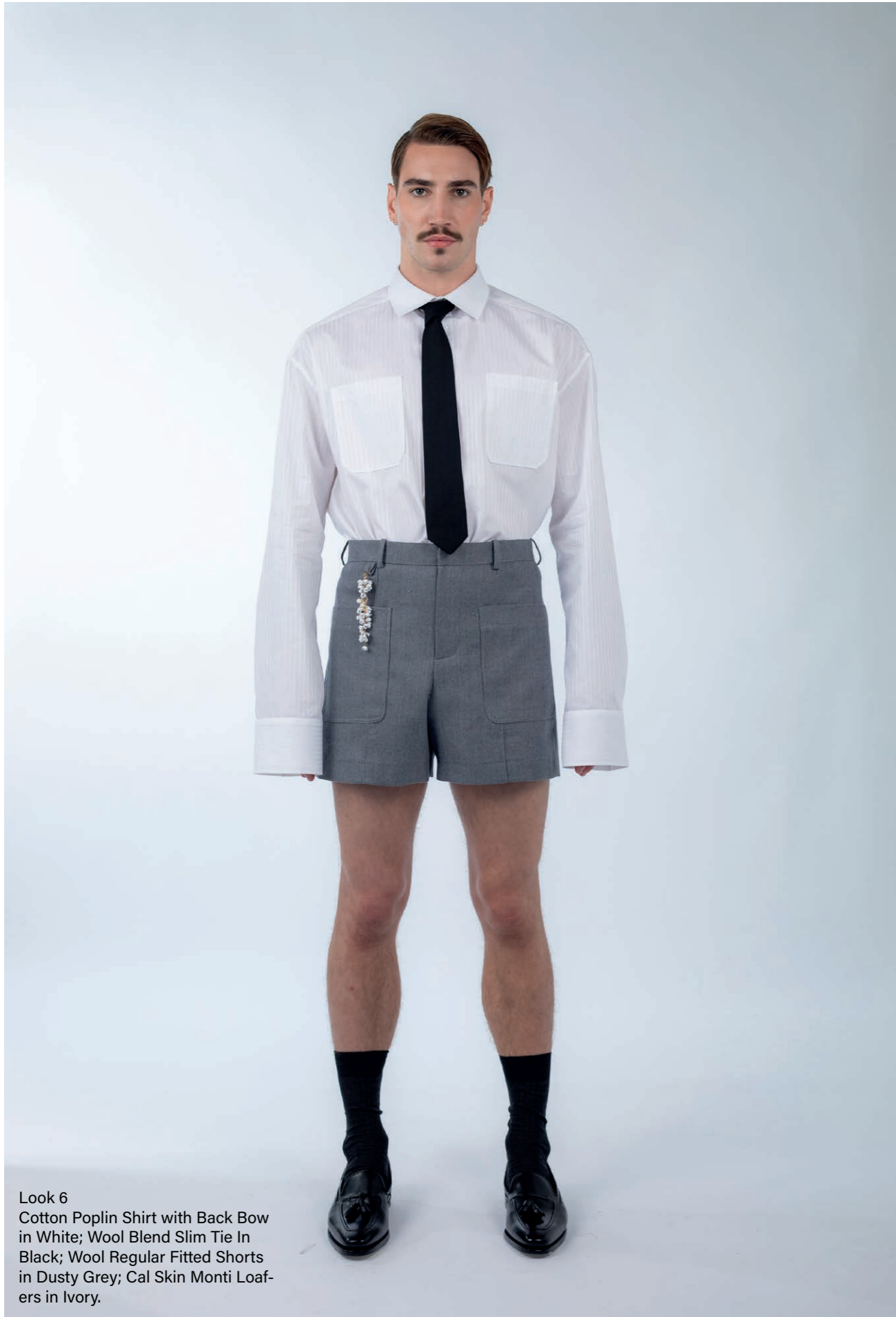
Look 6 Cotton Poplin Shirt with Back Bow in White; Wool Blend Slim Tie In Black; Wool Regular Fitted Shorts in Dusty Grey; Cal Skin Monti Loaf- ers in Ivory.