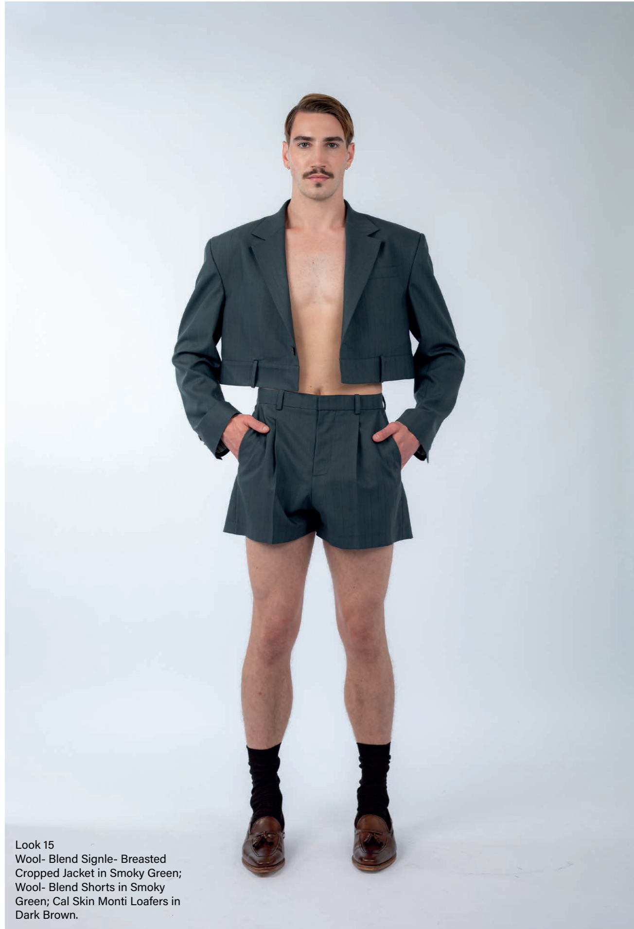
Look 15 Wool- Blend Single- Breasted Cropped Jacket in Smoky Green; Wool- Blend Shorts in Smoky Green; Cal Skin Monti Loafers in Dark Brown.