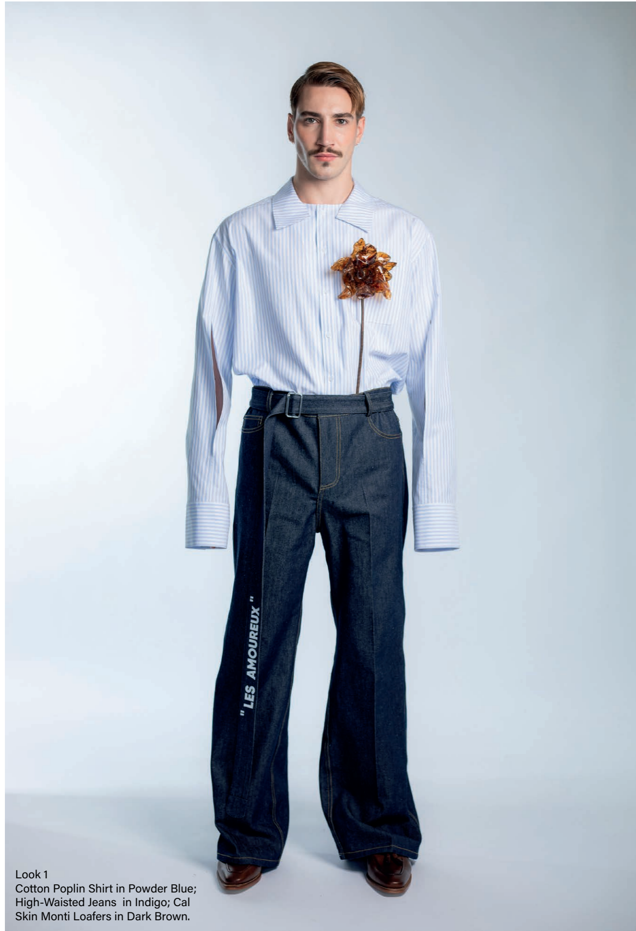
Look 1 Cotton Poplin Shirt in Powder Blue; High-Waisted Jeans in Indigo; Cal Skin Monti Loafers in Dark Brown.