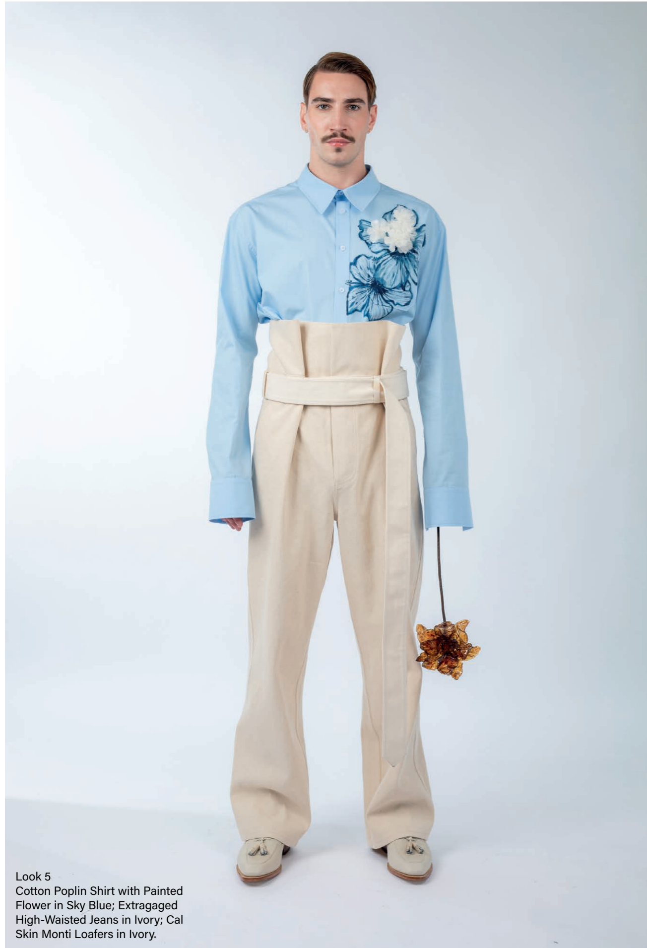
Look 5 Cotton Poplin Shirt with Painted Flower in Sky Blue; Extragaged High-Waisted Jeans in Ivory; Cal Skin Monti Loafers in Ivory.