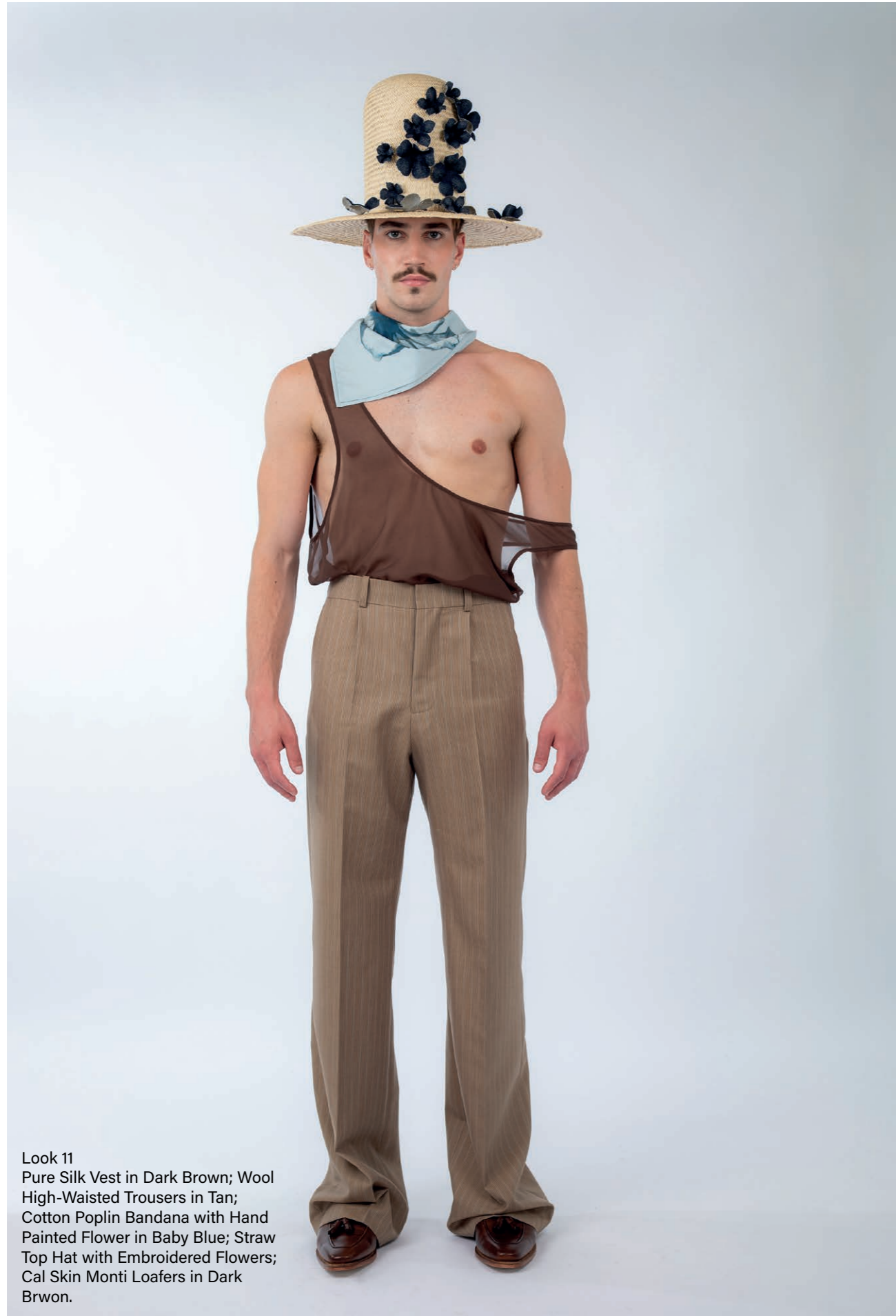
Look 11 Pure Silk Vest in Dark Brown; Wool High-Waisted Trousers in Tan; Cotton Poplin Bandana with Hand Painted Flower in Baby Blue; Straw Top Hat with Embroidered Flowers; Cal Skin Monti Loafers in Dark Brown.