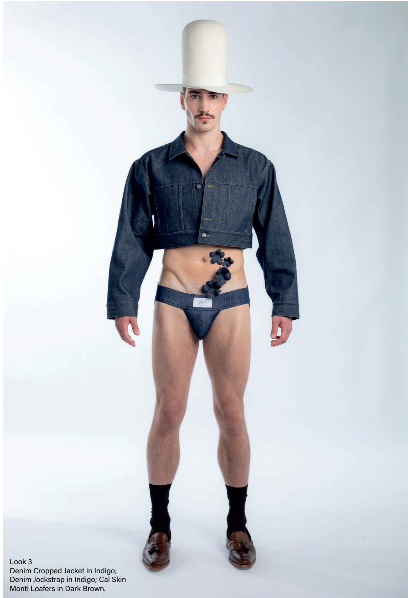
Look 3 Denim Cropped Jacket in Indigo; Denim Jockstrap in Indigo; Cal Skin Monti Loafers in Dark Brown.