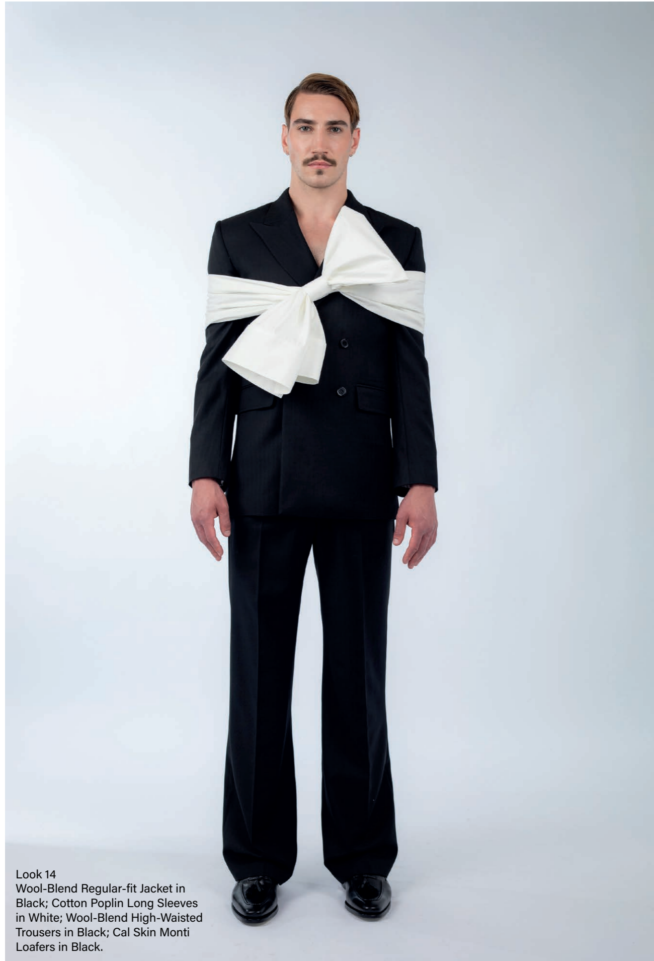
Look 14 Wool-Blend Regular-fit Jacket in Black; Cotton Poplin Long Sleeves in White; Wool-Blend High-Waisted Trousers in Black; Cal Skin Monti Loafers in Black.