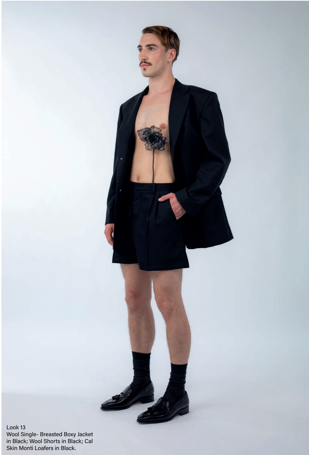
Look 13 Wool Single- Breasted Boxy Jacket in Black; Wool Shorts in Black; Cal Skin Monti Loafers in Black.