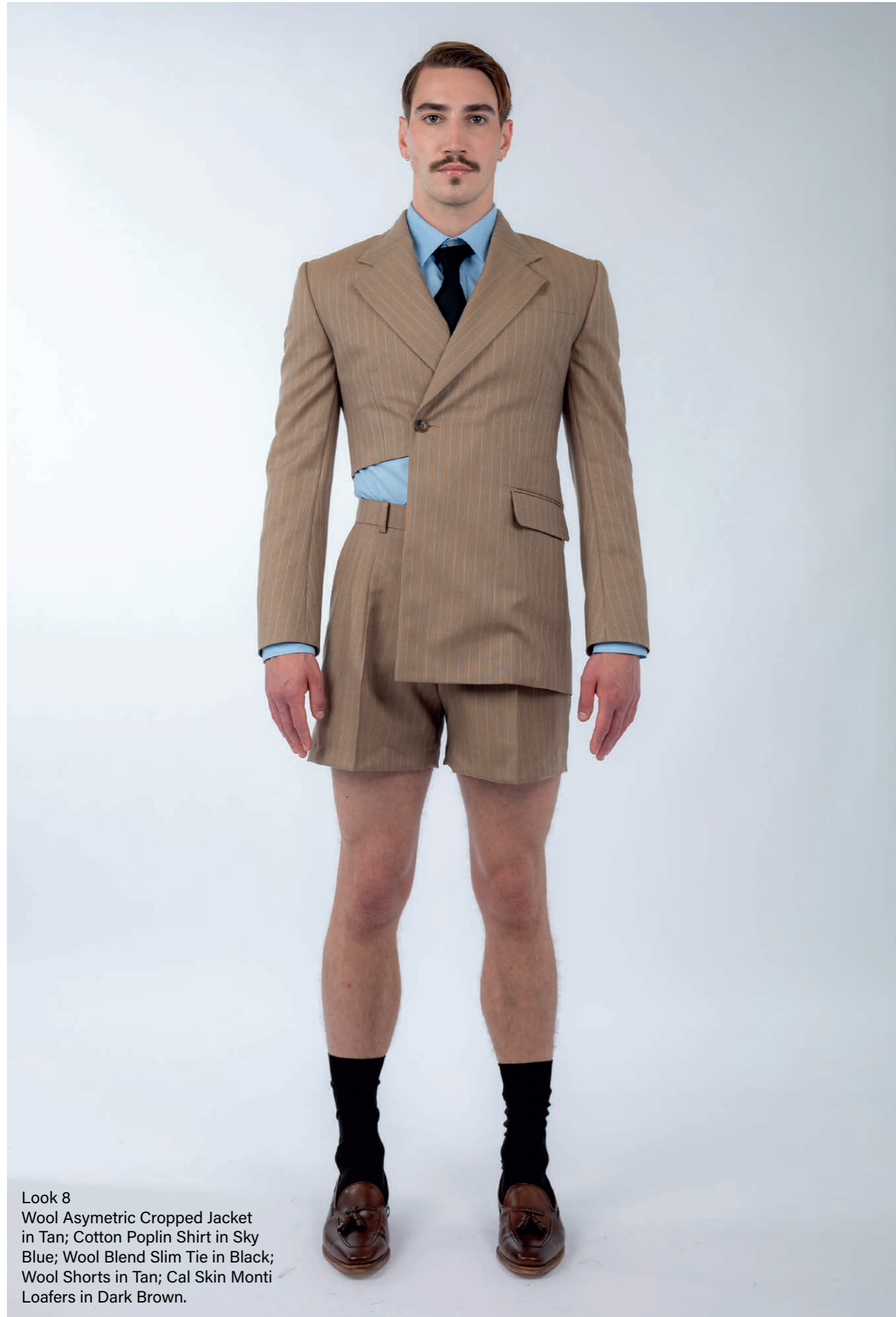
Look 8 Wool Asymetric Cropped Jacket in Tan; Cotton Poplin Shirt in Sky Blue; Wool Blend Slim Tie in Black; Wool Shorts in Tan; Cal Skin Monti Loafers in Dark Brown.