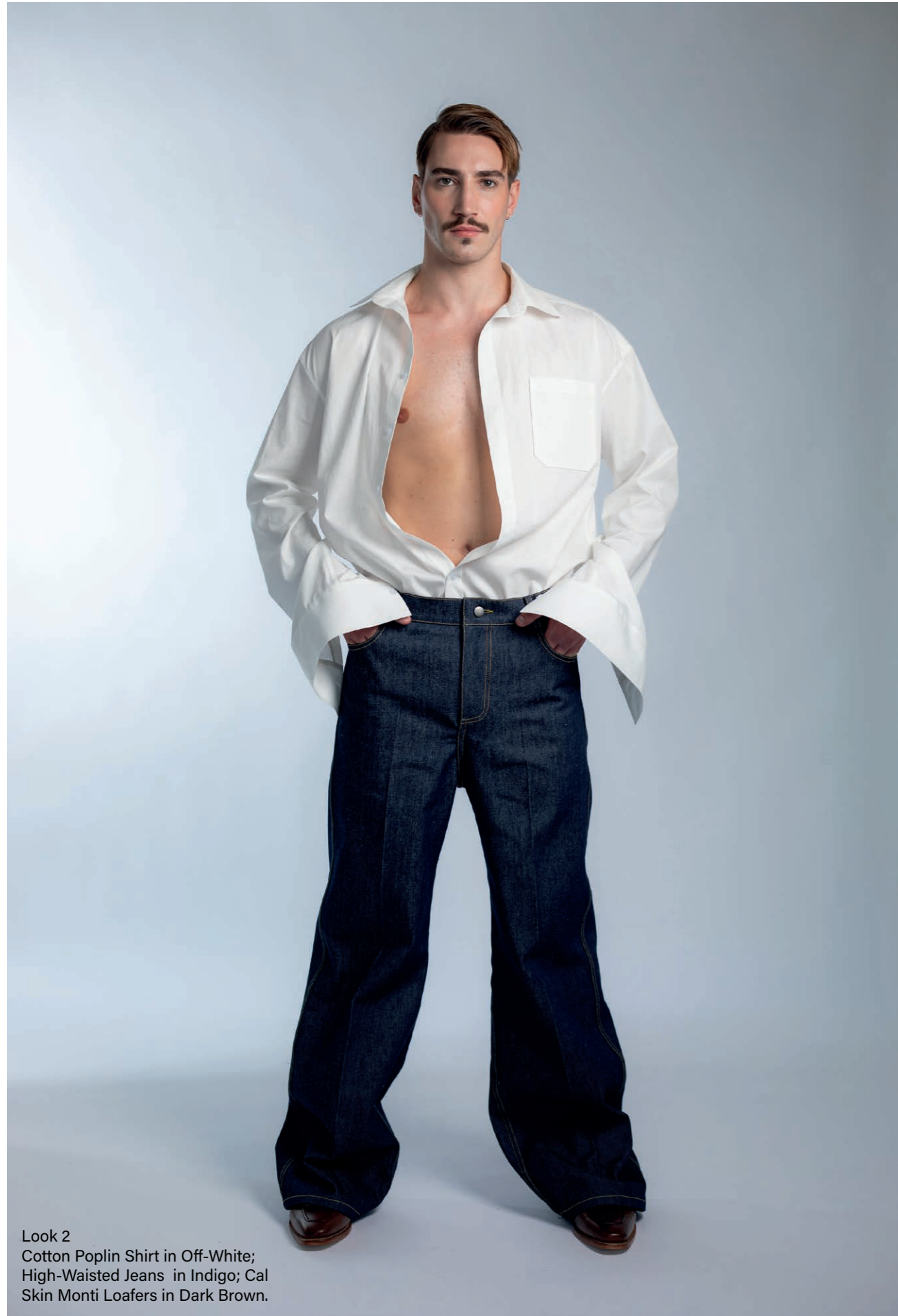
Look 2 Cotton Poplin Shirt in Off-White; High-Waisted Jeans in Indigo; Cal Skin Monti Loafers in Dark Brown.