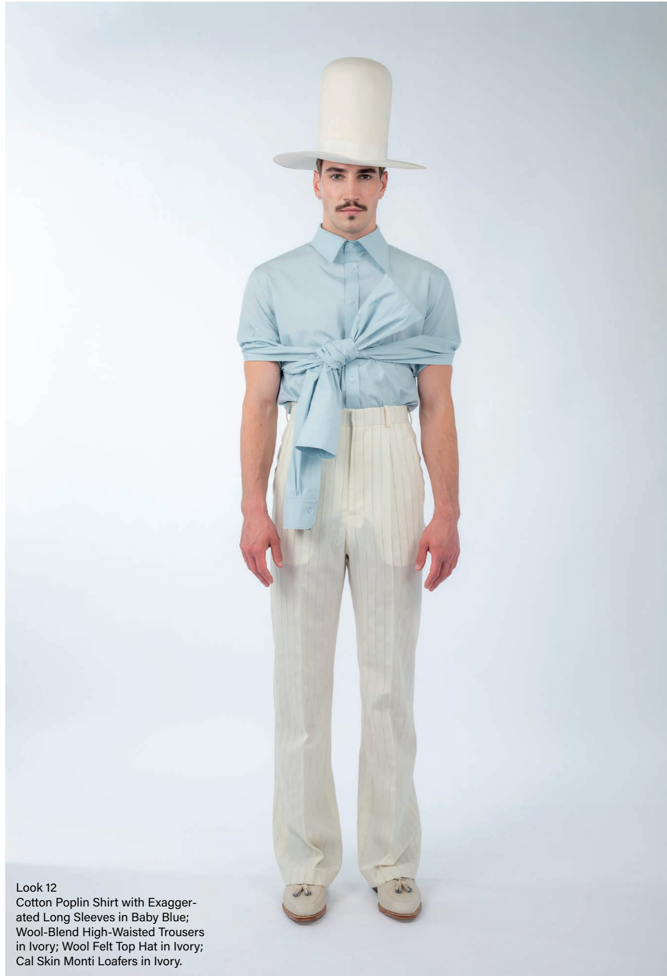
Look 12 Cotton Poplin Shirt with Exaggerated Long Sleeves in Baby Blue; Wool-Blend High-Waisted Trousers in Ivory; Wool Felt Top Hat in Ivory; Cal Skin Monti Loafers in Ivory.