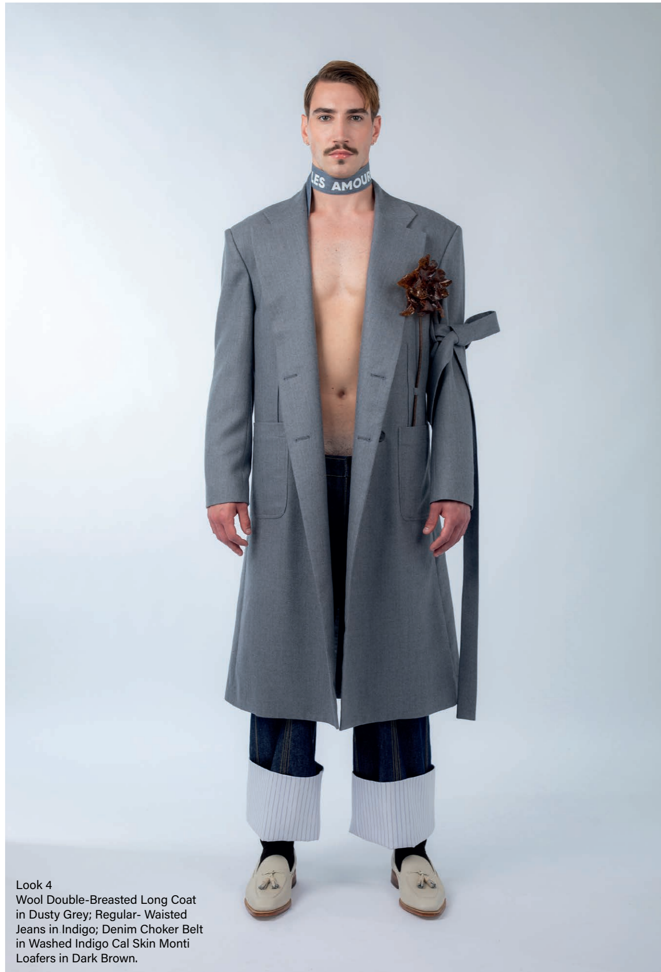
Look 4 Wool Double-Breasted Long Coat in Dusty Grey; Regular- Waisted Jeans in Indigo; Denim Choker Belt in Washed Indigo Cal Skin Monti Loafers in Dark Brown.