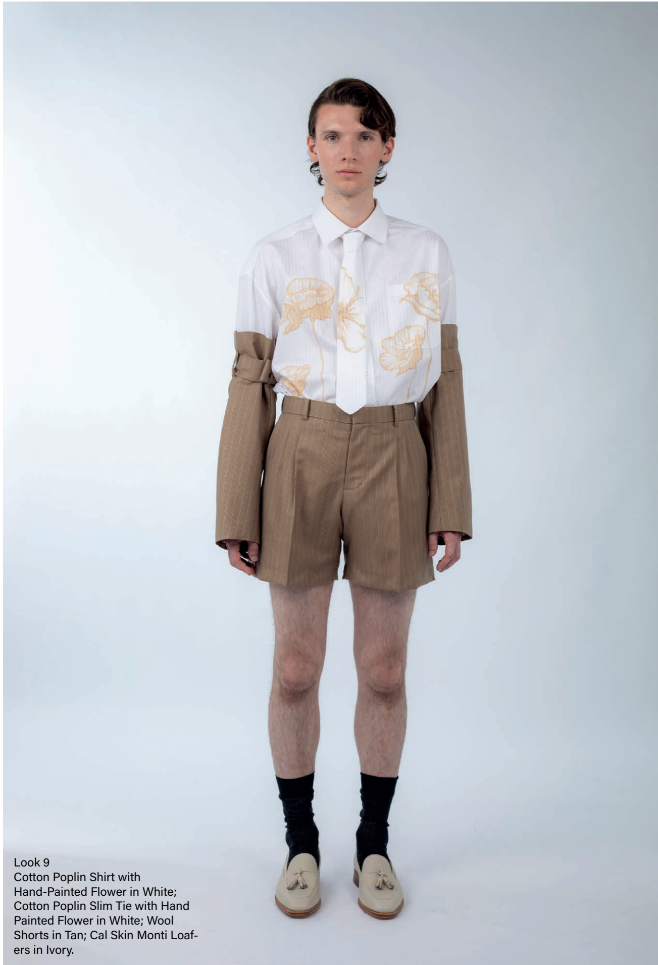
Look 9 Cotton Poplin Shirt with Hand-Painted Flower in White; Cotton Poplin Slim Tie with Hand Painted Flower in White; Wool Shorts in Tan; Cal Skin Monti Loaf- ers in Ivory.