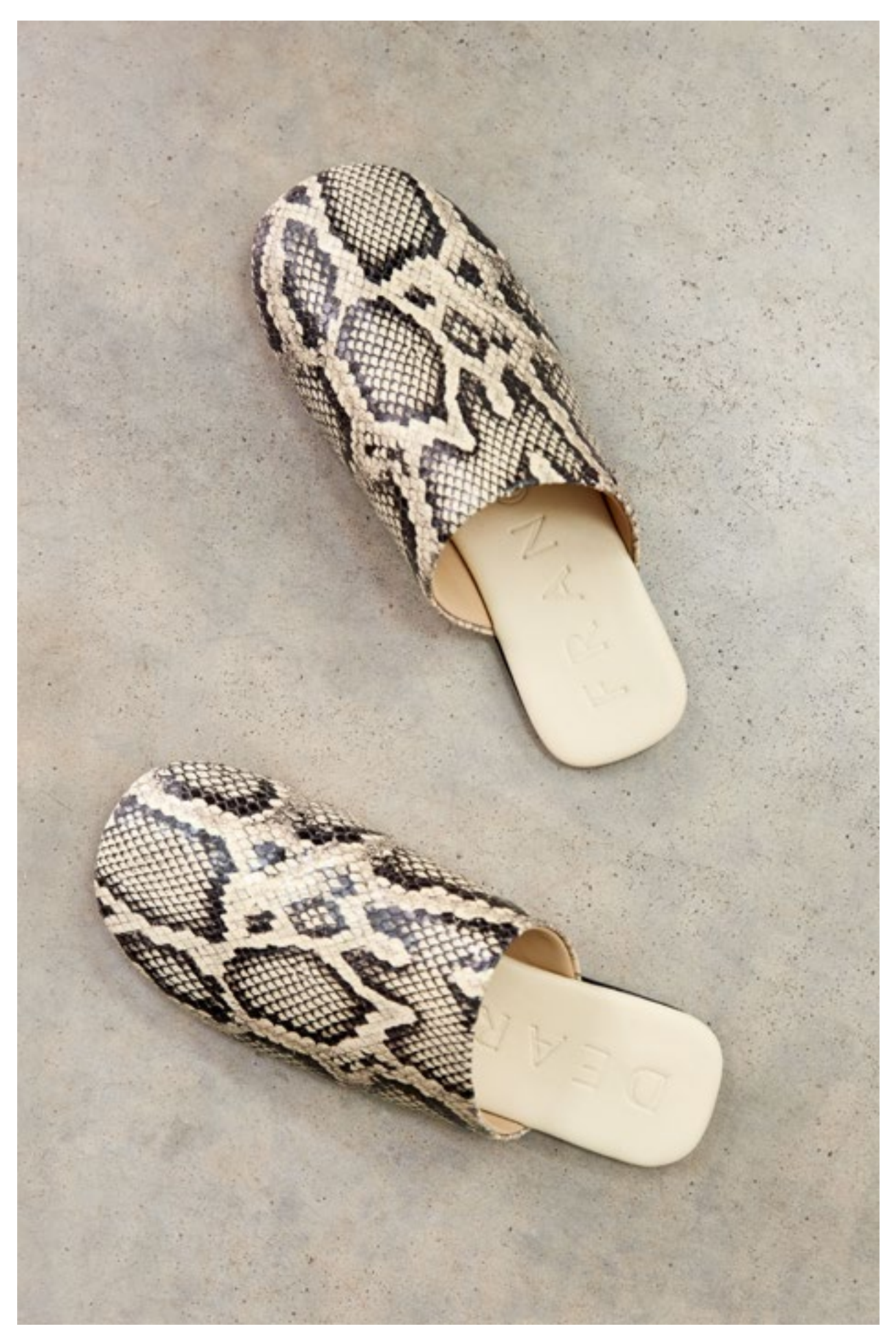
PALETTE — WOOL ESPRESSO, WOOL TAN, WOOL GREEN, SNAKE NUDE, BLACK