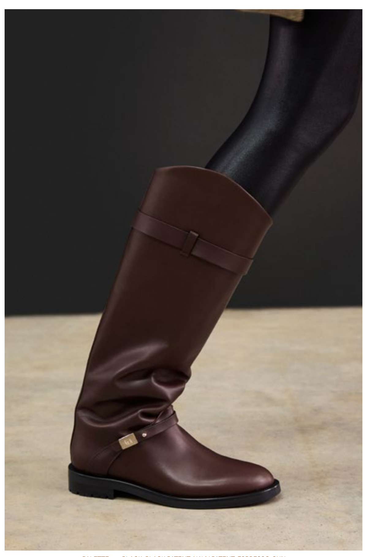
PALETTE — BLACK, BLACK PATENT, NAVY PATENT, ESPRESSO, SUN