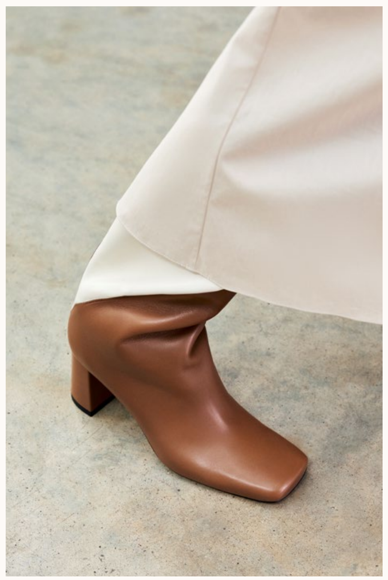
PALETTE — BLACK/GREEN, TAN/CREAM, SNAKE BROWN, SNAKE BLACK, SNAKE NUDE