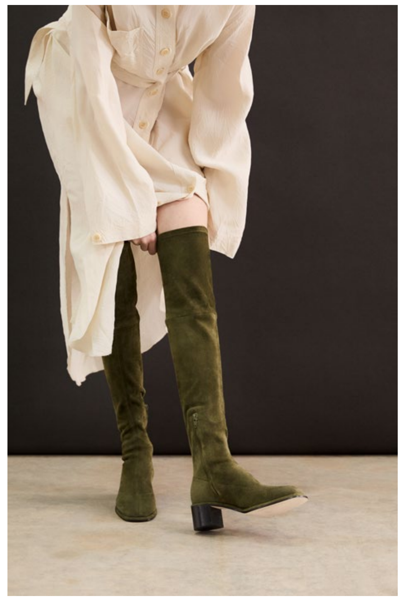
PALETTE — BLACK, MOSS GREEN, ESPRESSO