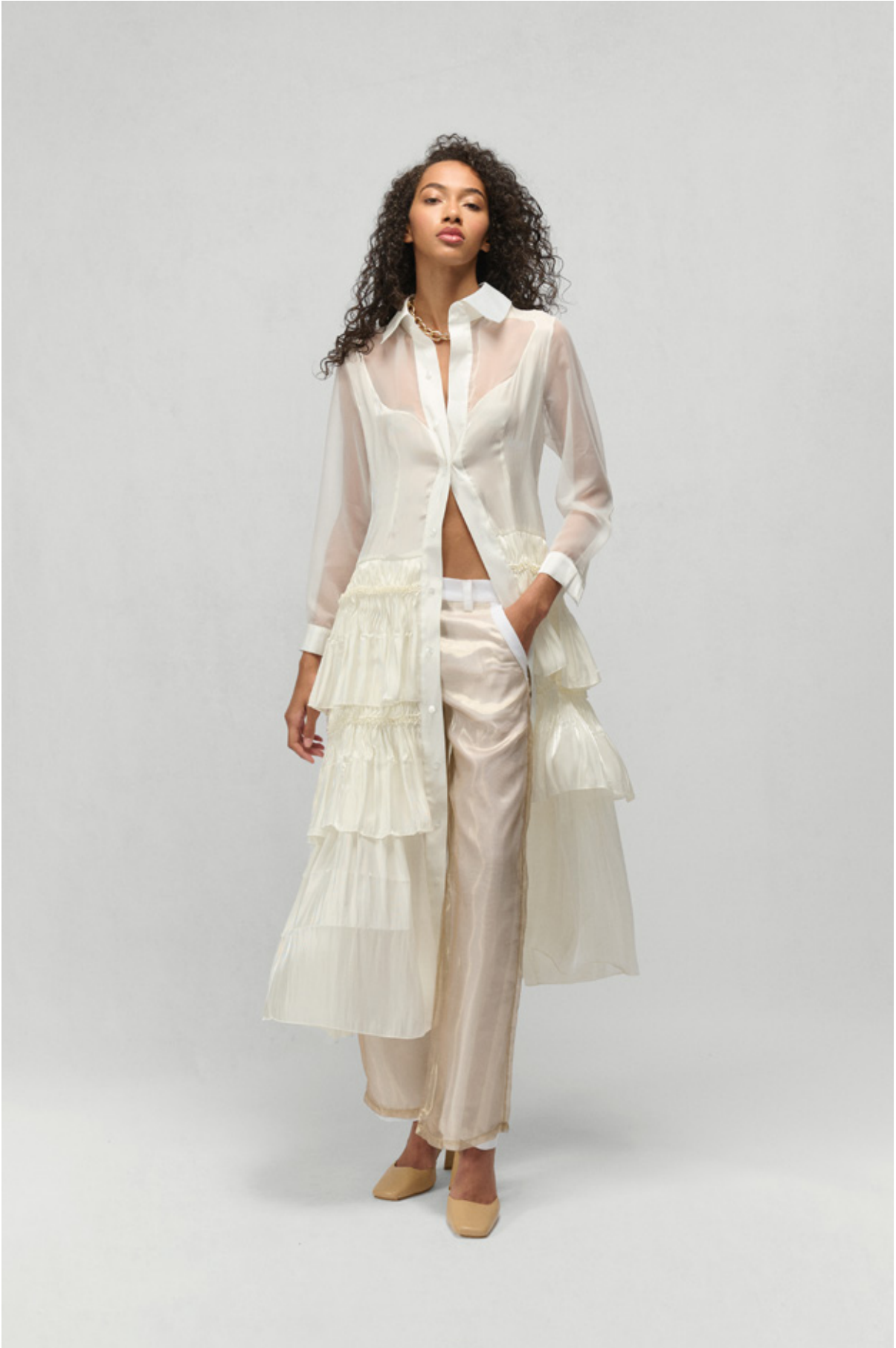
MELISSA- ASYMMETRICAL TOP WITH THREE TIER SHIBORI SKIRT SHIRT DRESS