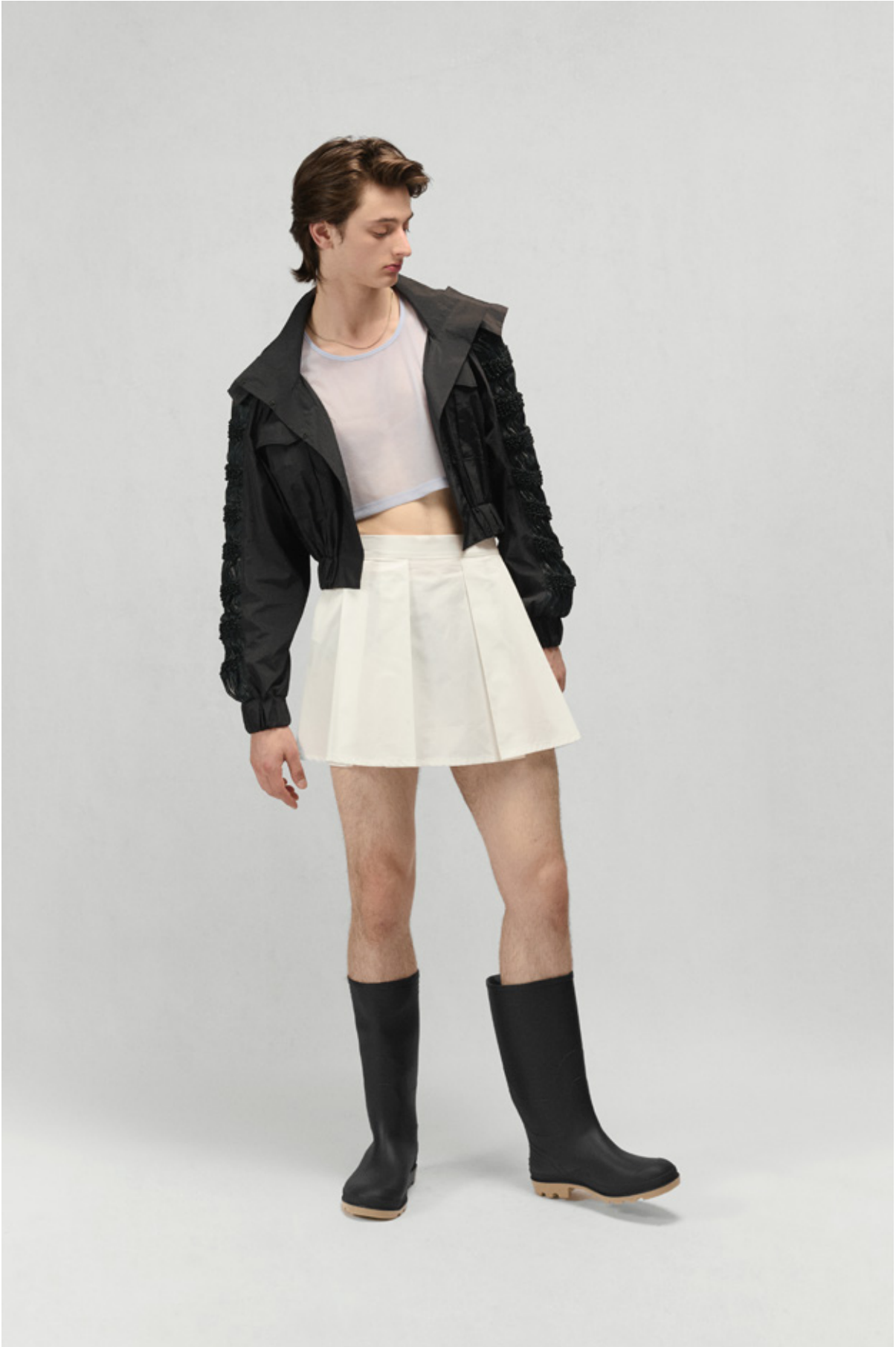
ANGELINA- SHIBORI PANEL SLEEVE HOODED JACKET