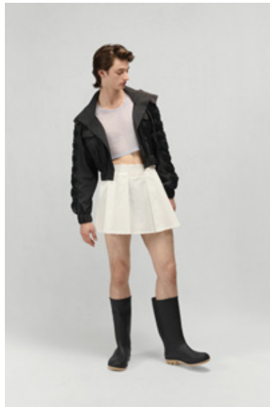
ANGELINA SHIBORI JACKET ALANA T-SHIRT ROSA PLEAT SKIRT