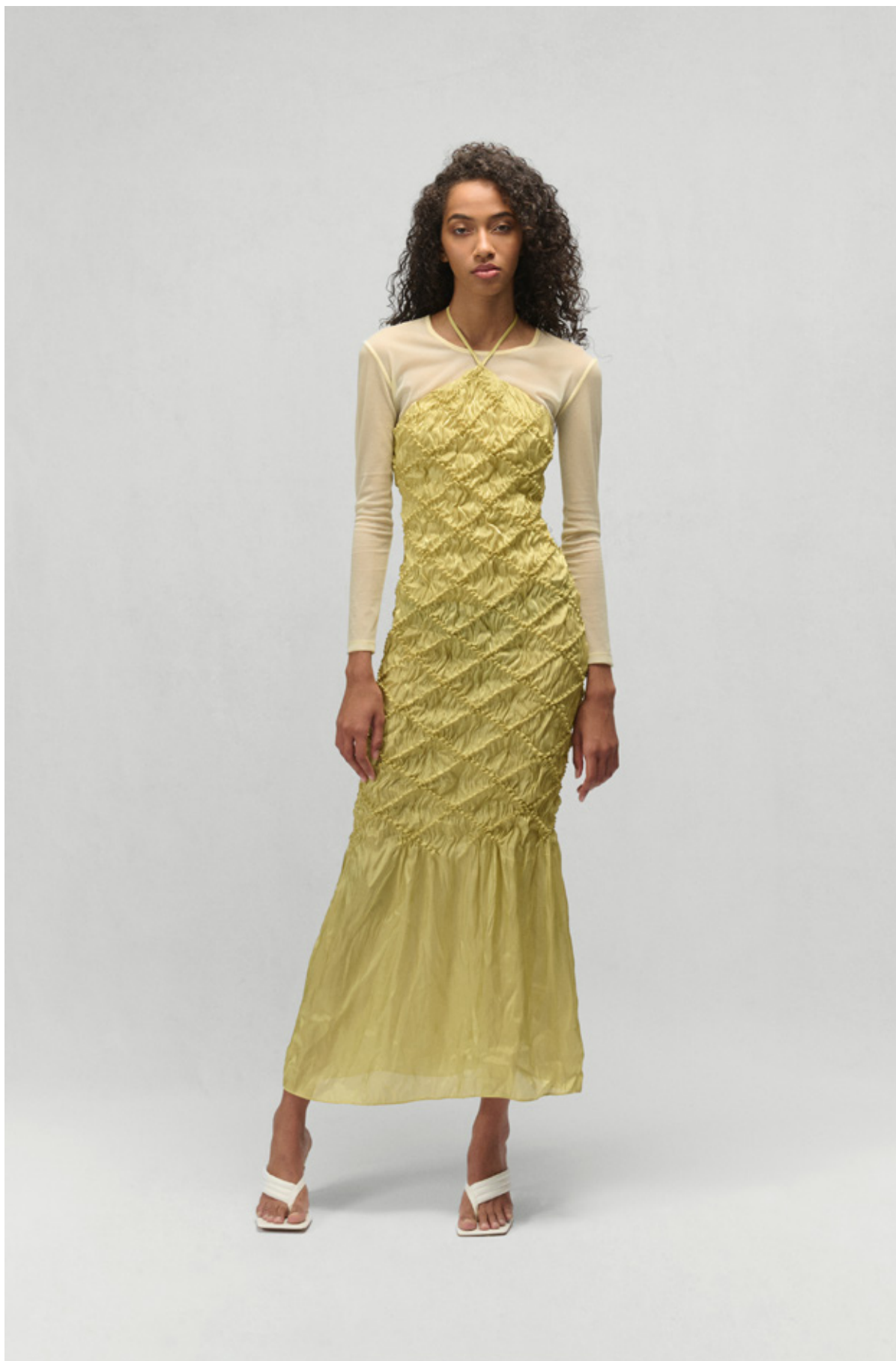
SOFIA- HALTER NECK DIAMOND PATTERN SHIBORI FITTED DRESS