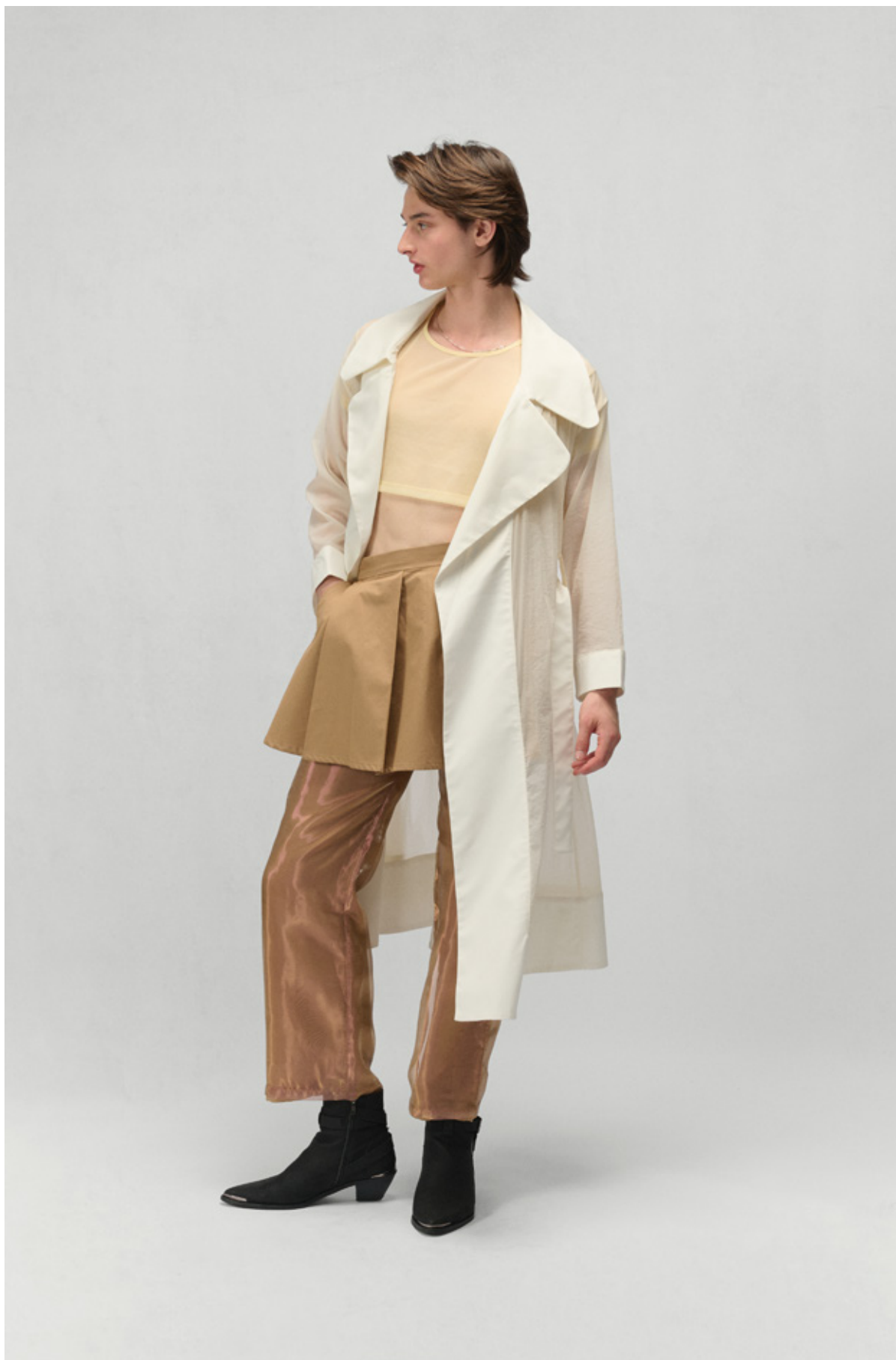
JACQUILINE- SEE THROUGH TRENCH COAT SS24