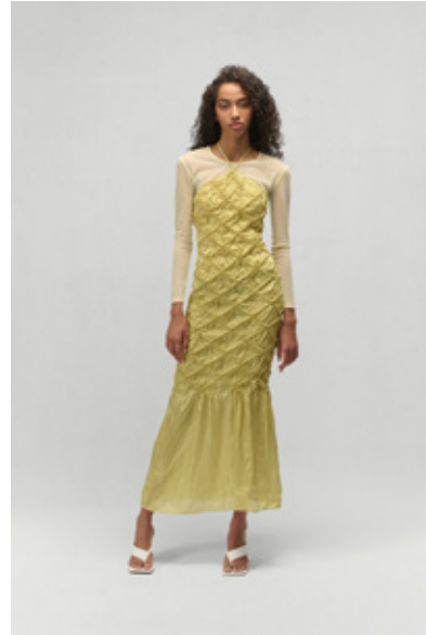
SOFIA SHIBORI DRESS VERONICA T-SHIRT