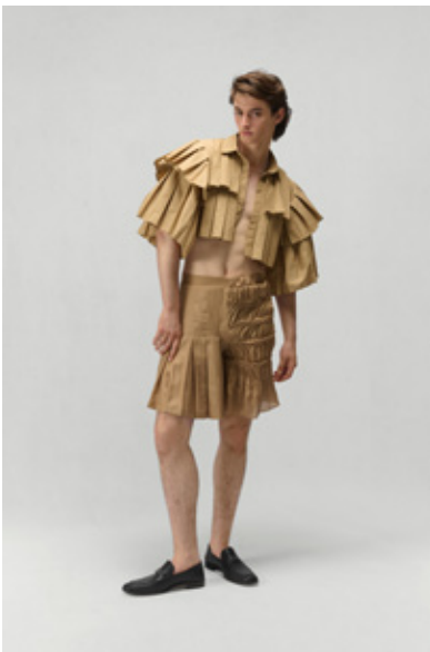
EVA PLEAT SHIRT ABRIL SHIBORI SHORTS