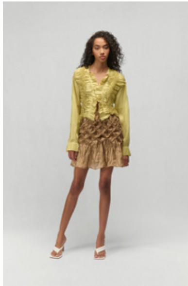
GABRIELA SHIBORI BLOUSE VICTORIA SHIBORI SKIRT