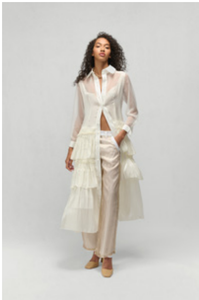
MELISSA SHIBORI DRESS