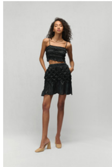
AMALIA SHIBORI TOP VICTORIA SHIBORI SKIRT