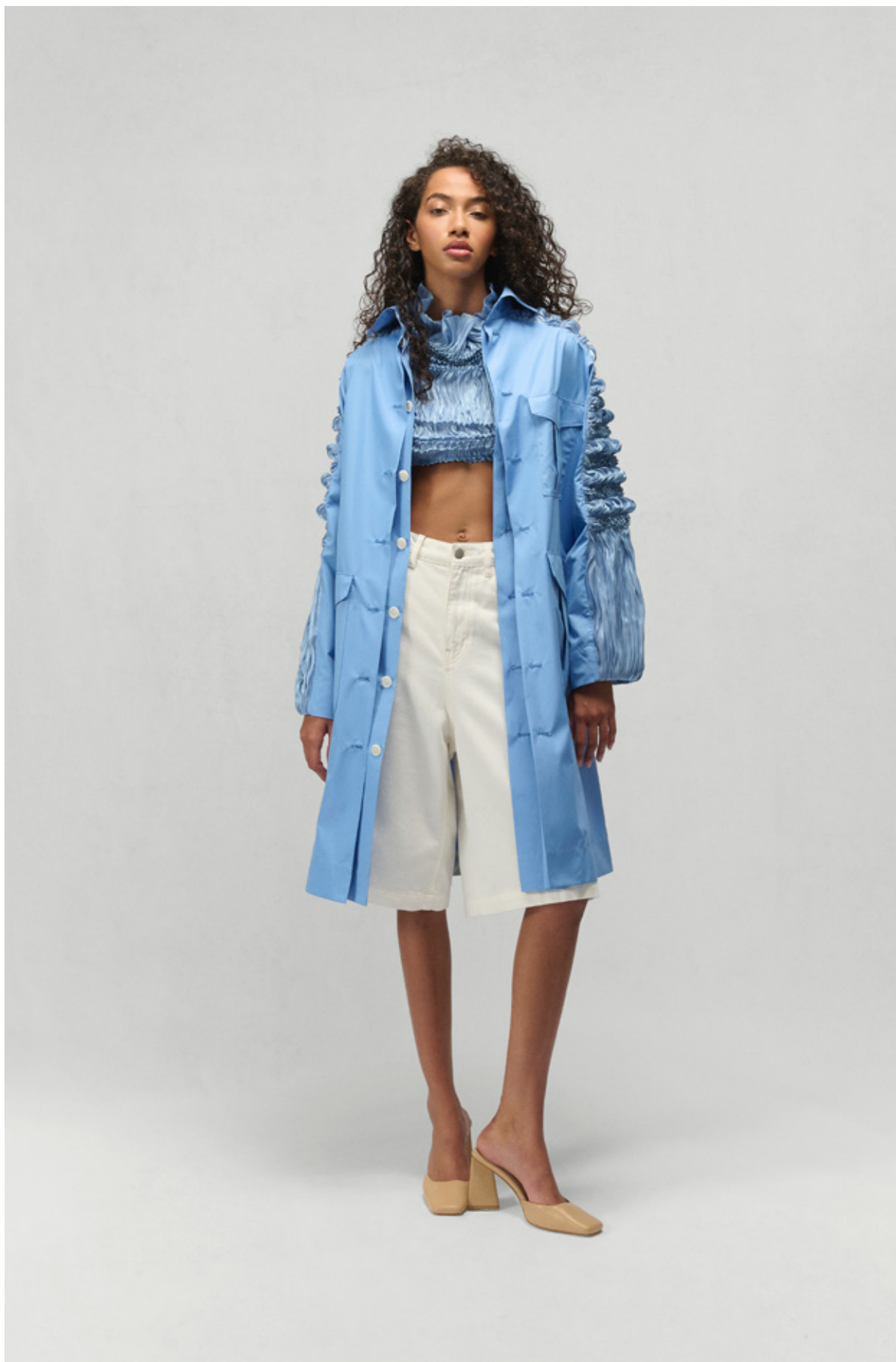
ADRIANA- DRAPY SQUARE SHIBORI TOP