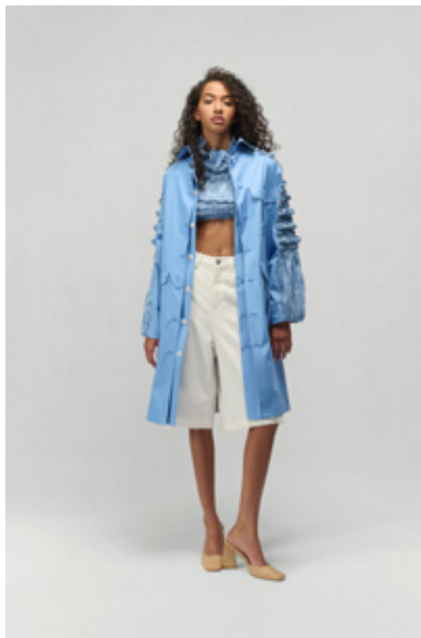
ADRIANA SHIBORI TOP ANA SHIBORI COAT