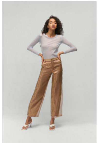
VERONICA T-SHIRT JADA TROUSERS