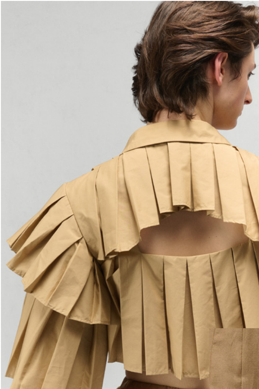
EVA- TIERED PLEAT OPEN BACK SHIRT Fully pleated shirt. Two tiered. Open back. Organic cotton.