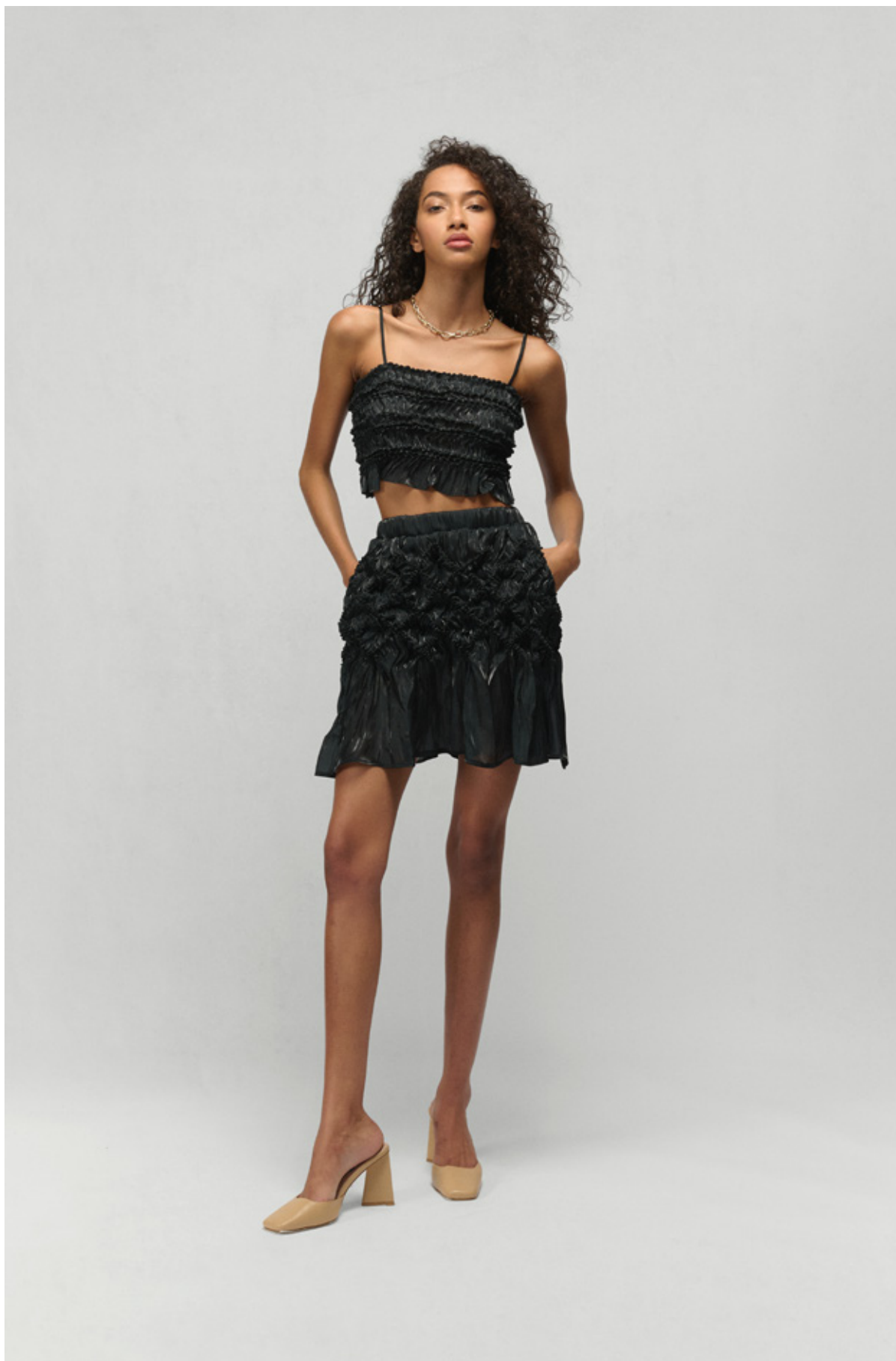
AMALIA- FITTED SHIBORI TOP WITH SHOULDER STRAP