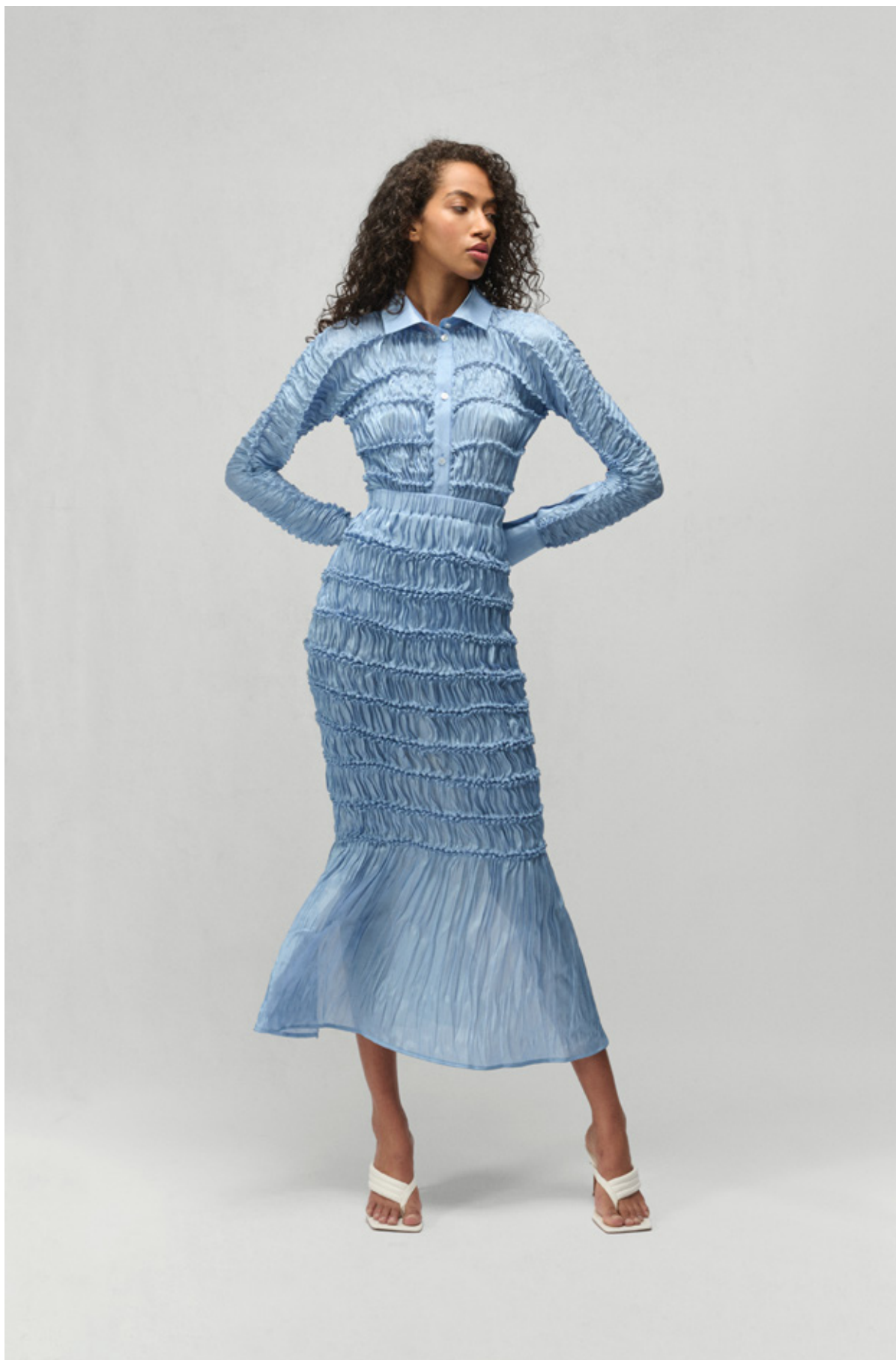
GLORIA- KIMONO SLEEVE SHIBORI BLOUSE