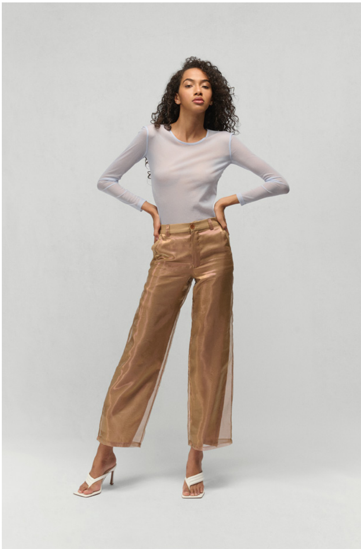
VERONICA- SEE THROUGH LONG SLEEVE FITTED T-SHIRT