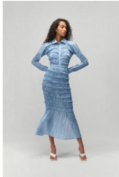
GLORIA SHIBORI BLOUSE JULIA SHIBORI SKIRT SS24