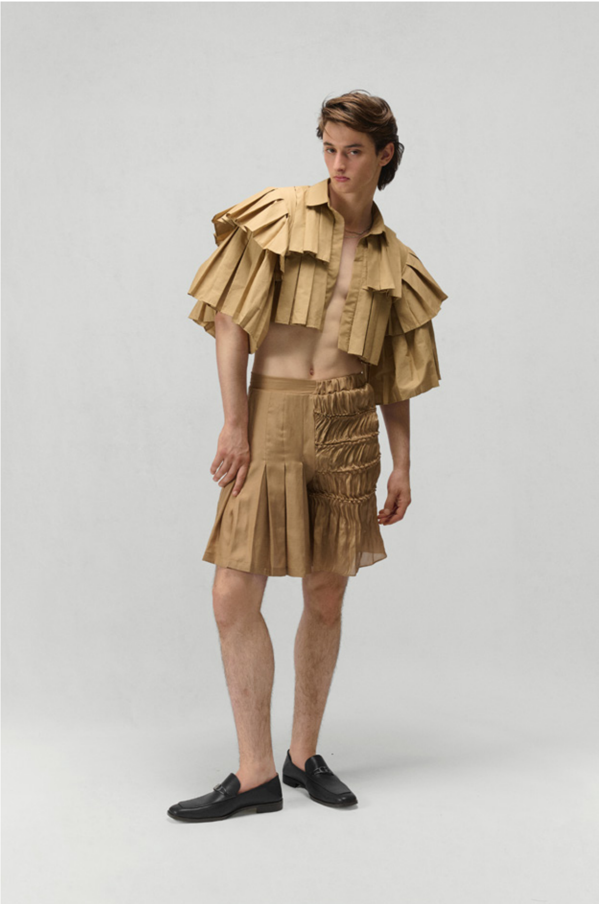
EVA- TIERED PLEAT OPEN BACK SHIRT