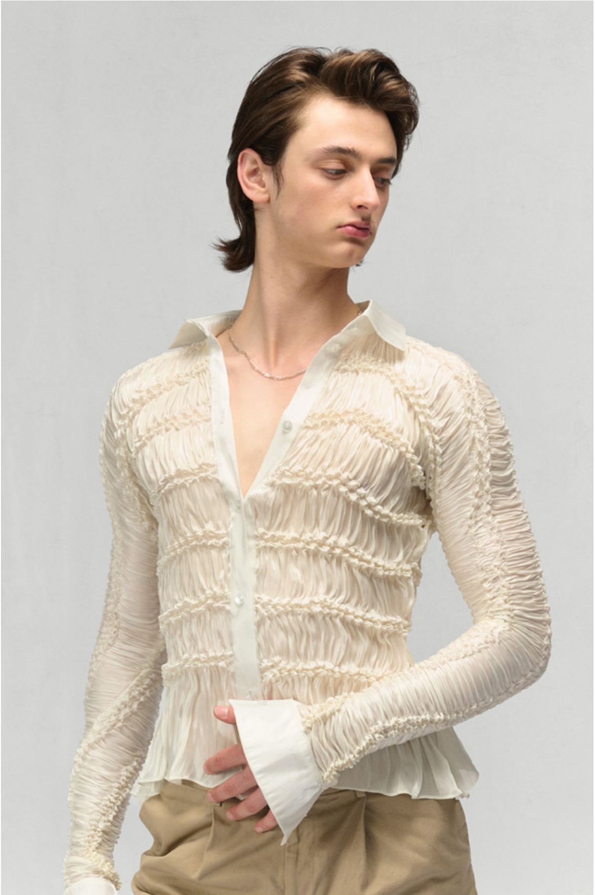
GLORIA- KIMONO SLEEVE SHIBORI BLOUSE