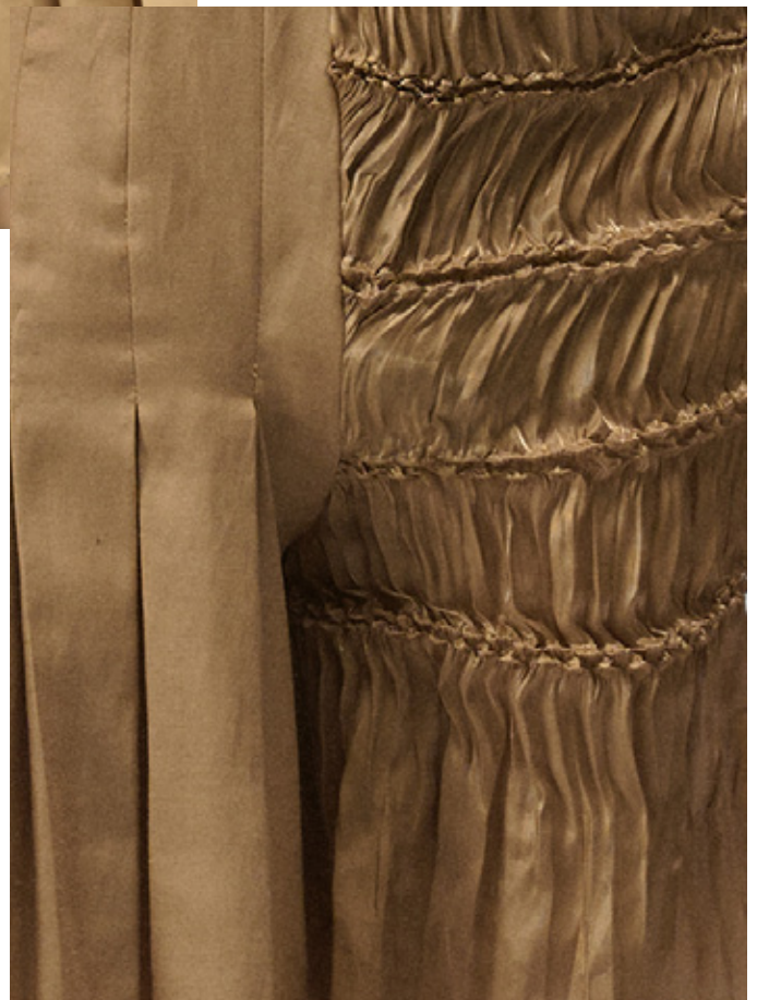
ABRIL- PLEATS AND SHIBORI SHORTS Half pleat half Shibori trousers. Shibori side ruching throughout and stretchy with the elasticated waist. Recycled material on the pleat side. Handcrafted Shibori by artisans.