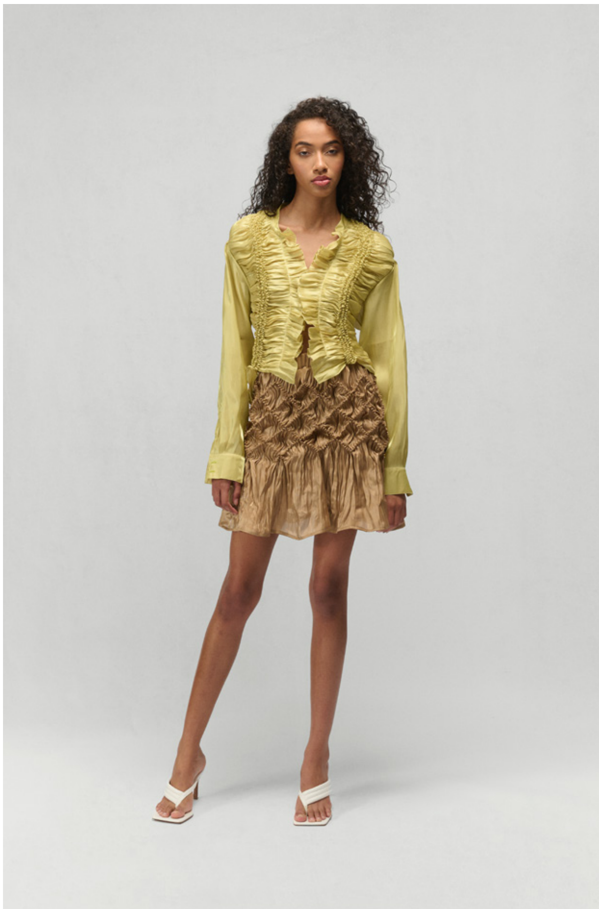
GABRIELA- VERTICAL SHIBORI LINE RUFFLE FRONT BLOUSE