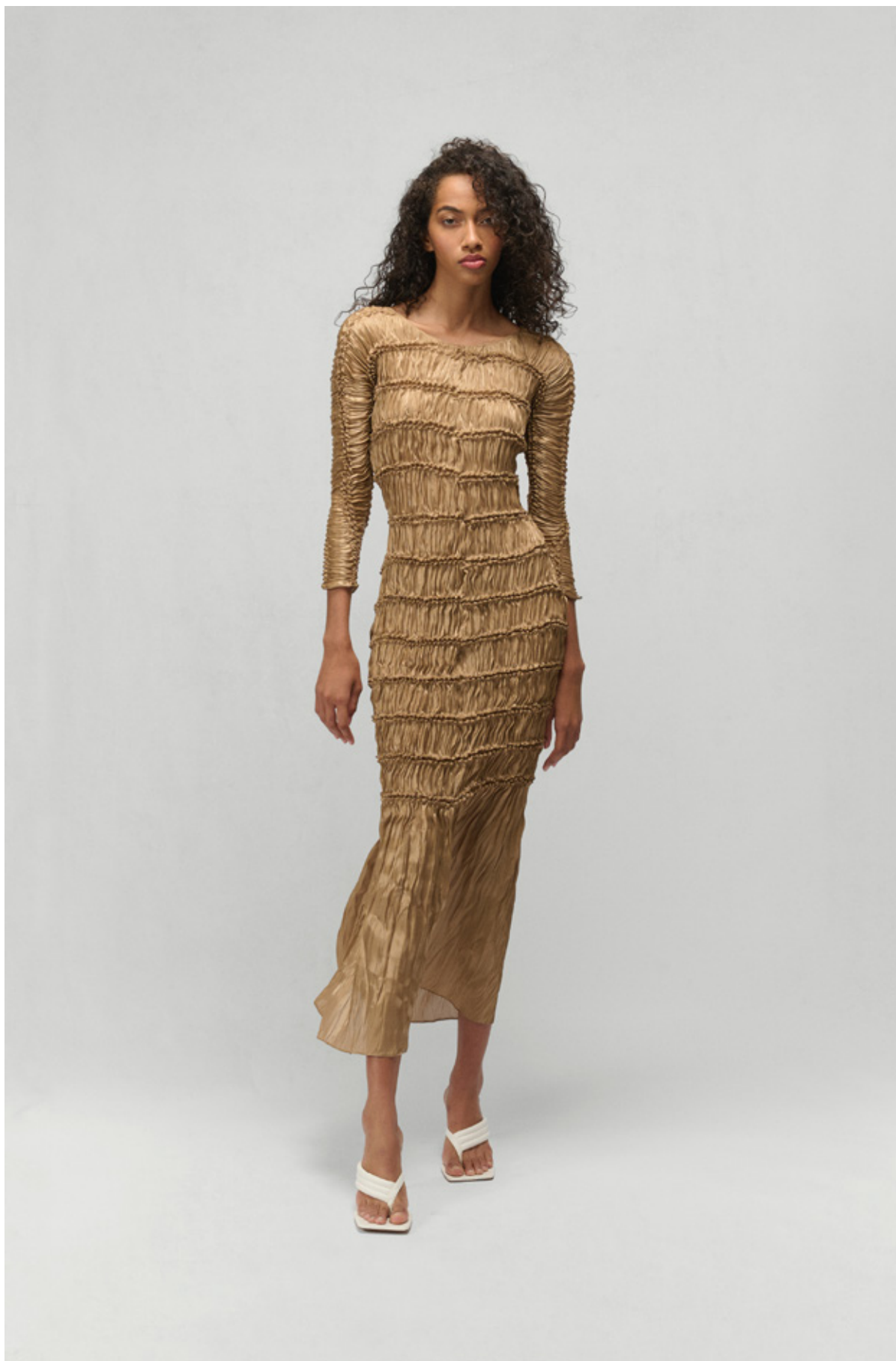
VALENTINA- KIMONO SLEEVE SHIBORI DRESS