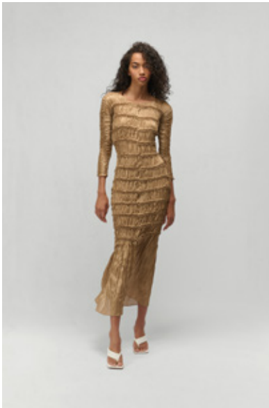
VALENTINA SHIBORI DRESS