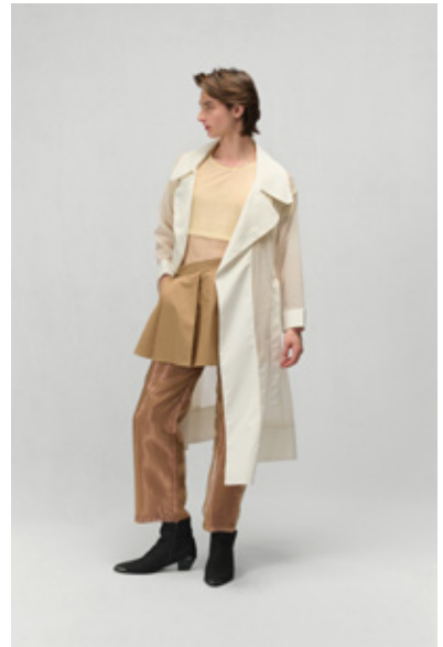
JACQUILINE COAT SS24 ALANA T-SHIRT ROSA SKIRT JADA TROUSERS