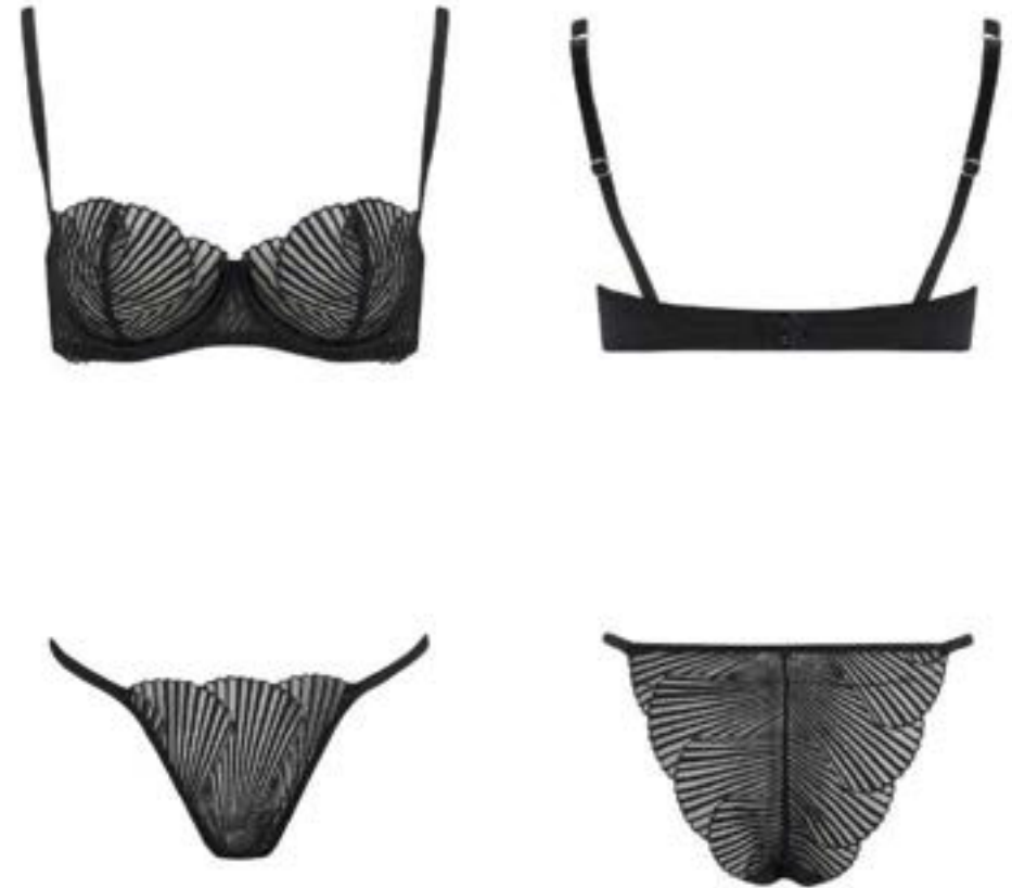
BRAZILIAN KNICKER ATA-013-01