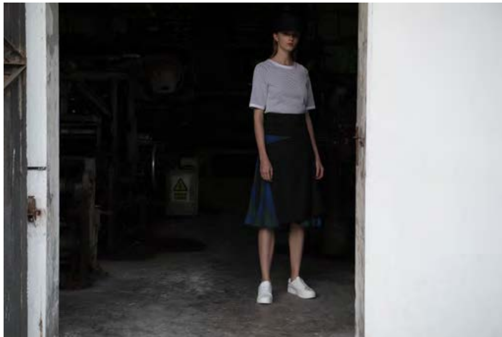
ABPE-C2C01-05WT07S ABPE-B4B01-05GN00S ACCESSORIES ABHC-K1K03-02BK00