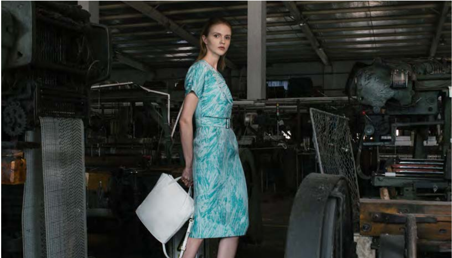
ABPE-B1B02-01BL14M ACCESSORIES ABHC-13106-12WT00