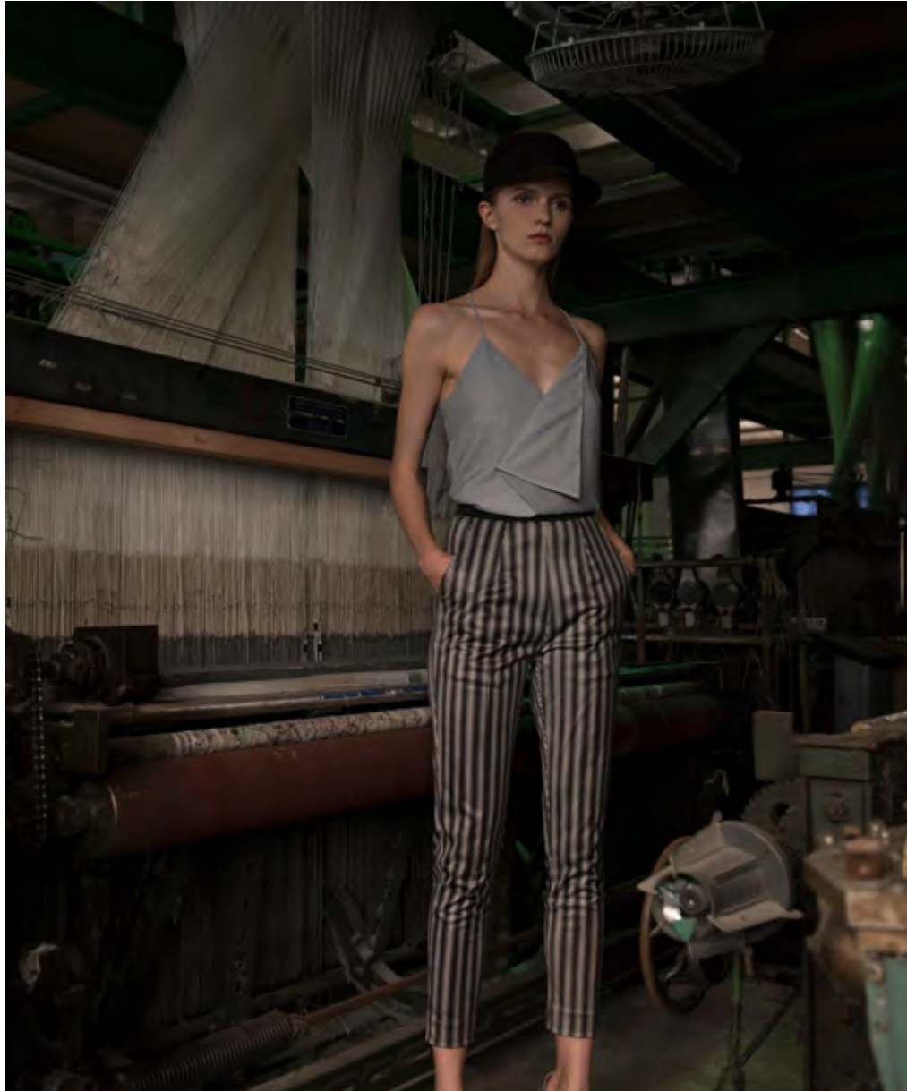
ABPE-C2C01-05GY095 ABPE-A2A01-05BK00S ACCESSORIES ABHC-K1K03-02BK00