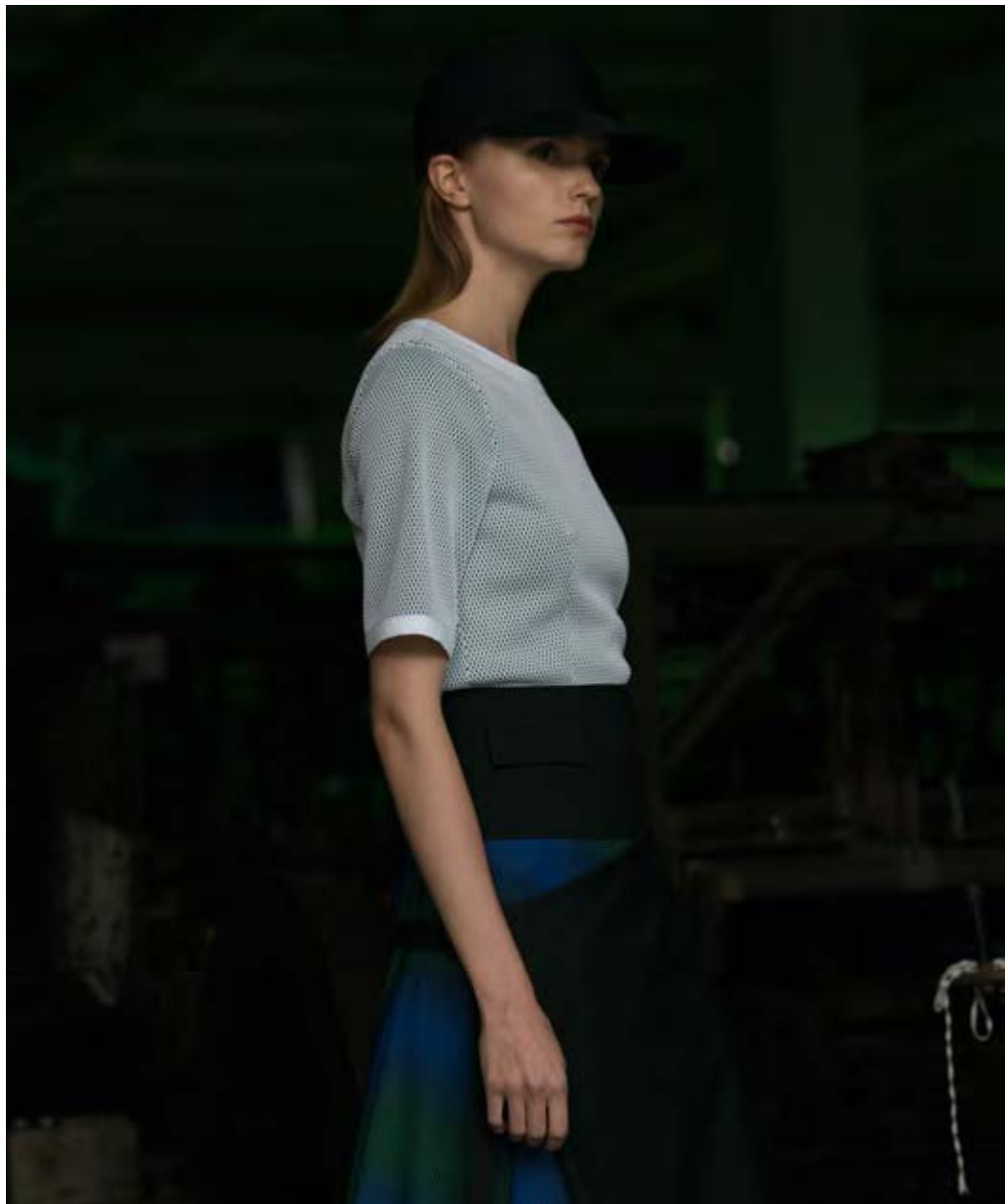
ABPE-C2C01-05WT07S ABPE-B4B01-05GN00S ACCESSORIES ABHC-K1K03-02BK00