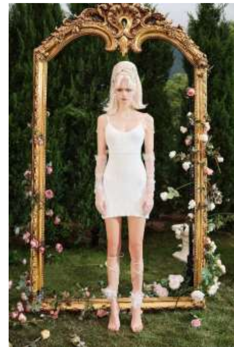
White mohair logo dress