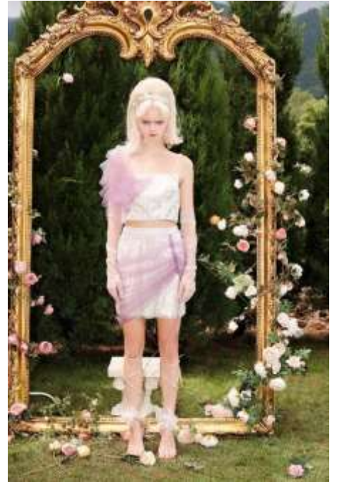
White sequin tank top White sequin skirt