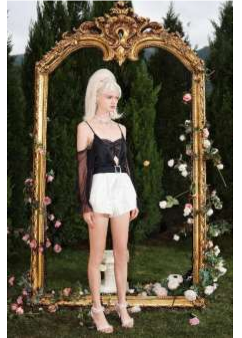
Black & white jumpsuit