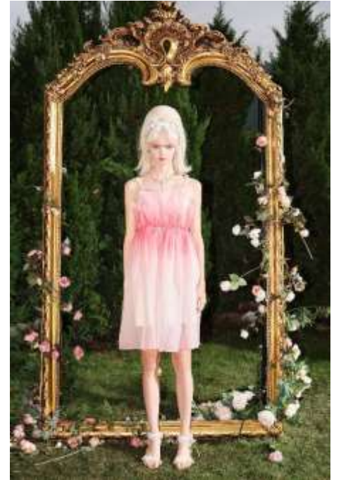
Gradient pink organza dress