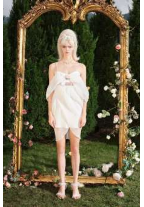
White off shoulder bubble gauze dress