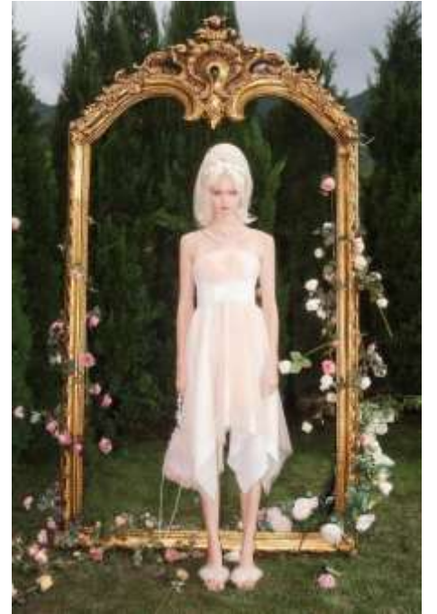
Nude pink jacquard off shoulder multilayered dress