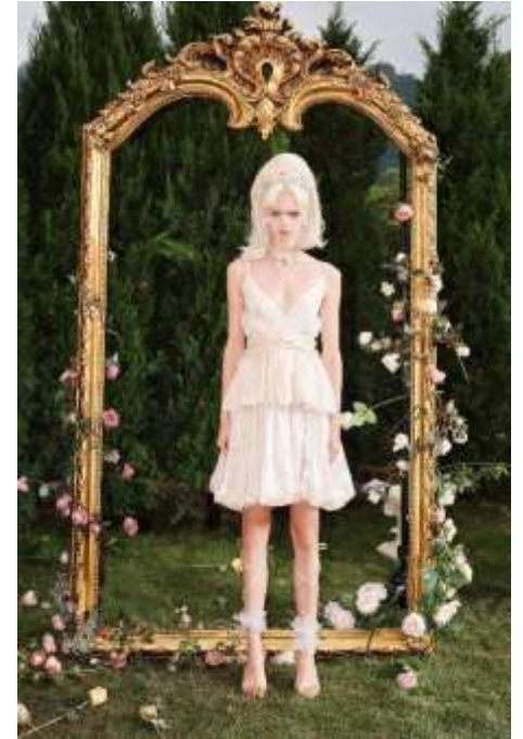
Light champagne aqua satin cake dress