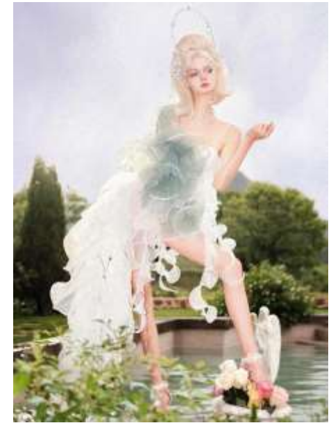
Inpiration collection-The Godess of Luo