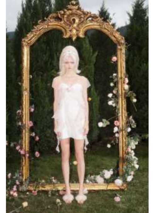
Nude pink jacquard floral dress