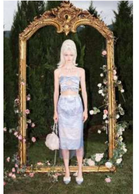
Purple printed bow tank top Purple printed skirt