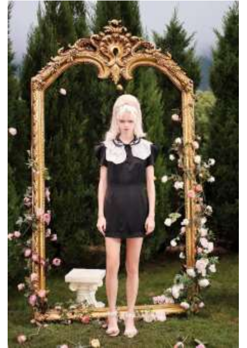
Black doll neck dress