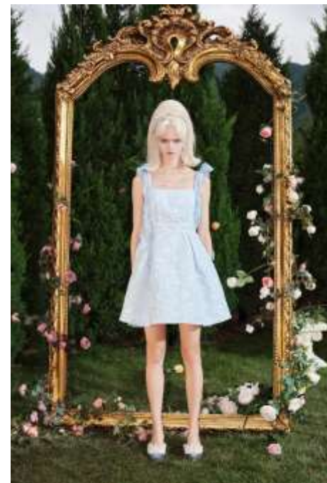
Blue jacquard dress