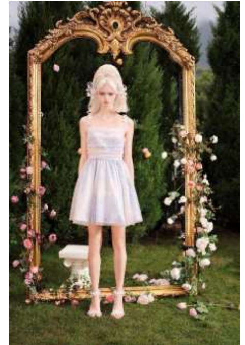
Pink mesh purple printed dress