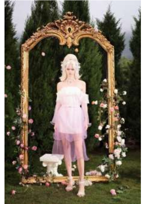
Purple organza off-the-shoulder dress