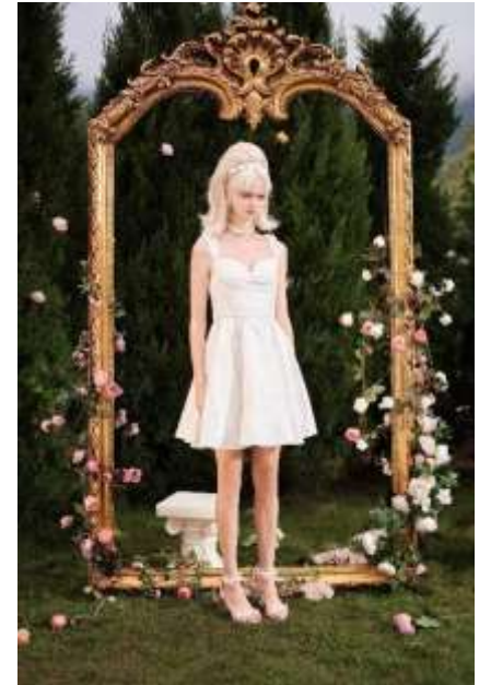
White jacquard dress