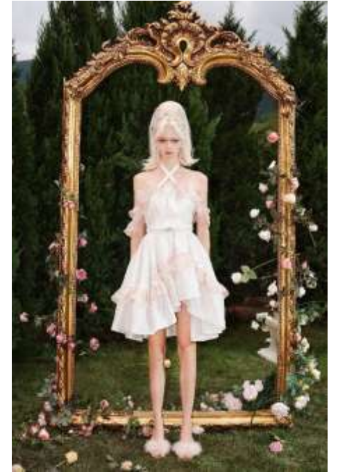
White jacquard off shoulder puff dress