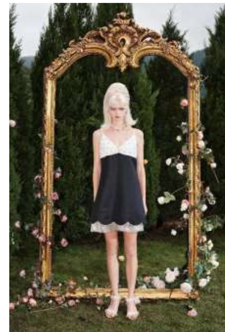
Black acetate with white sequin dress