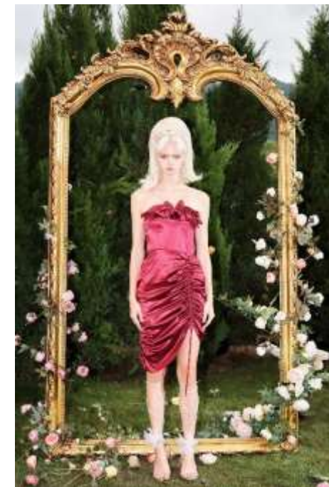
Dark red acetate halter dress