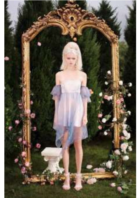
Purple printed puff sleeve dress