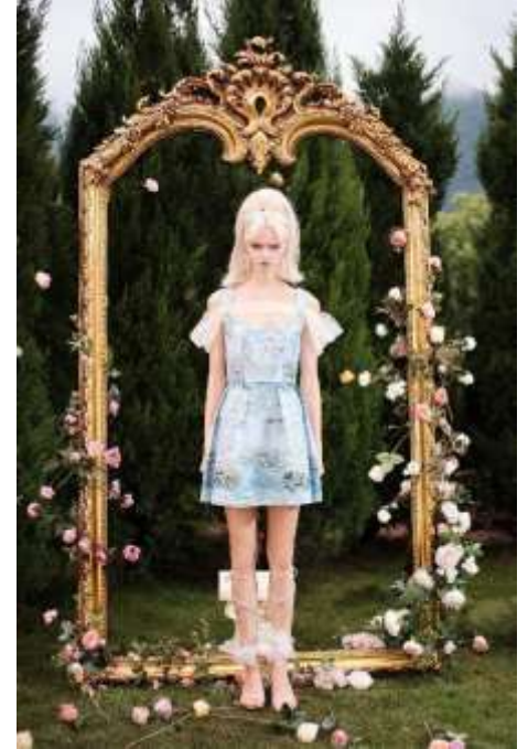
Green printed dress