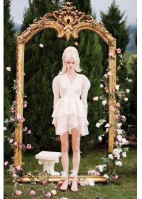
Light champagne v-neck puff sleeve organza dress