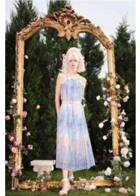
Purple printed maxi dress Pearl belt