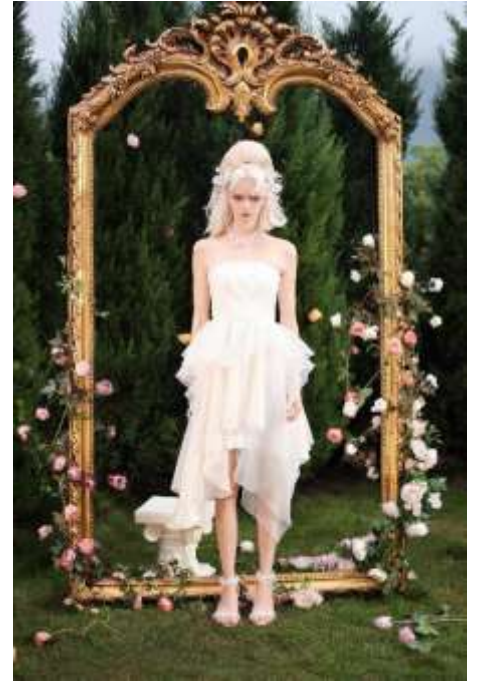
White lace tank top Nude multilayered tulle skirt