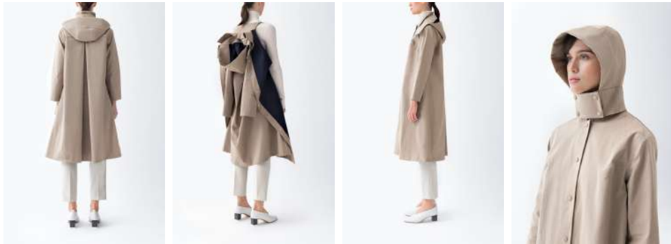
ANNA COAT in beige