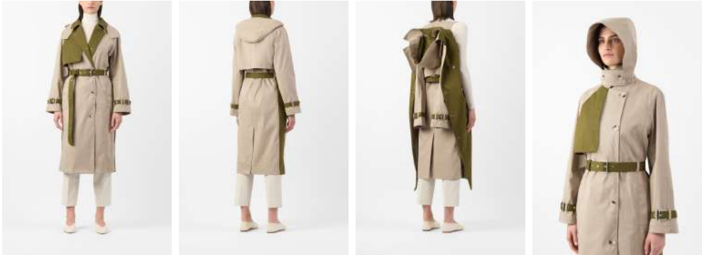
AGNES COAT in beige and olive