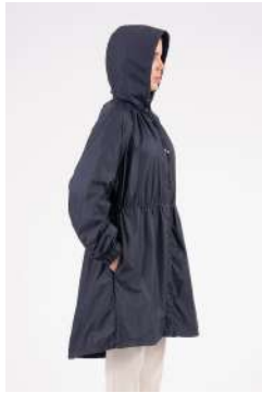
ZADIE COAT in dark navy