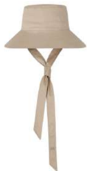
ARINA HAT reversible