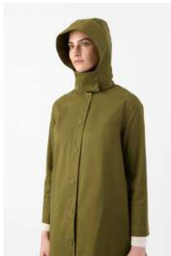
ANNA COAT in olive