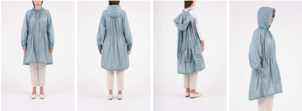
ZADIE COAT in morning blue