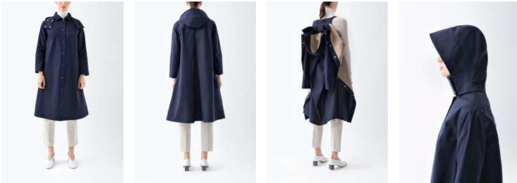
ANNA COAT in navy