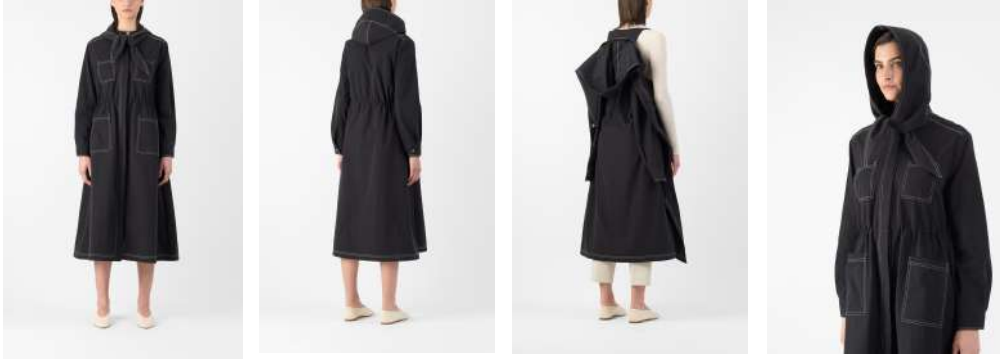
LUCIE COAT in black