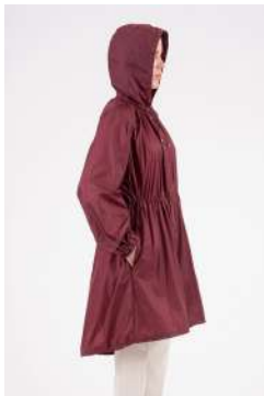
ZADIE COAT in burgundy