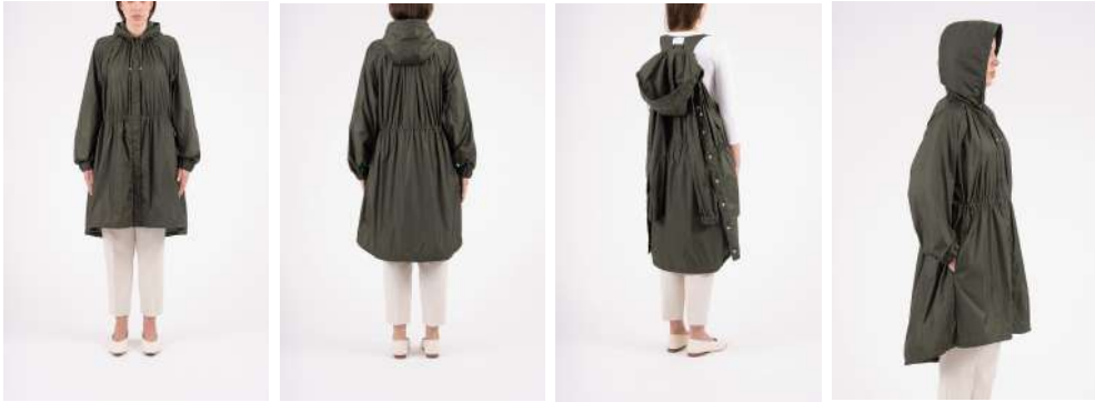
ZADIE COAT in olive green