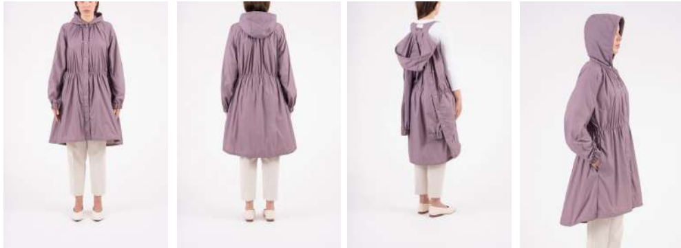
ZADIE COAT in dusty lilac