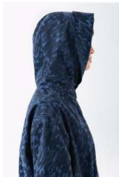
MIRA COAT in shades of blue