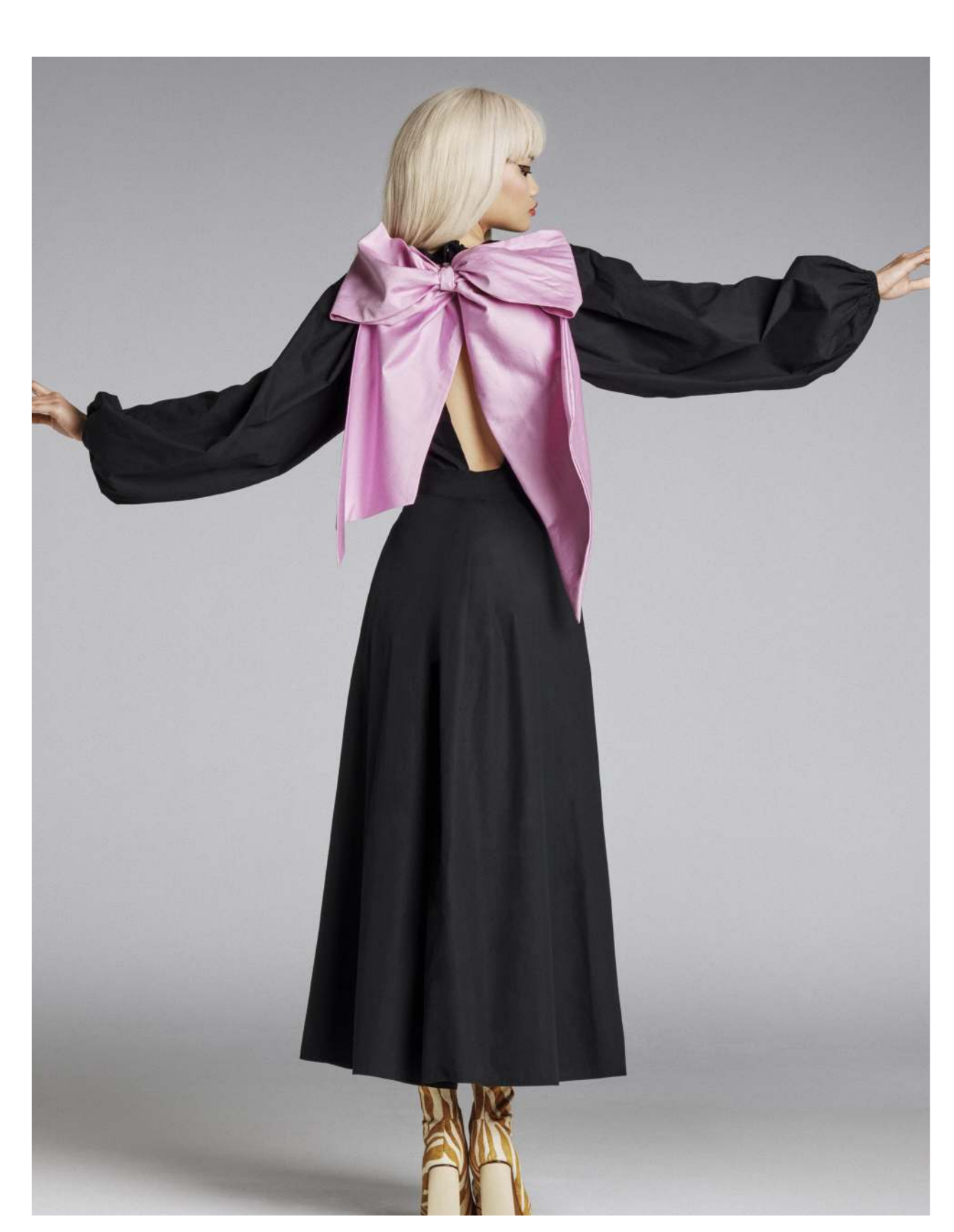
Look\ 3 - Black Cotton Poplin Dress with a Detachable Back Bow AW22