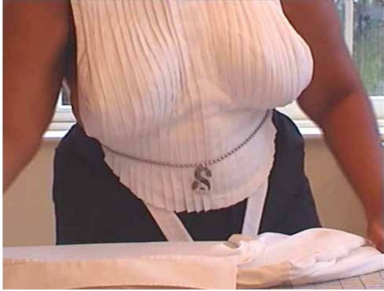
Watch film here