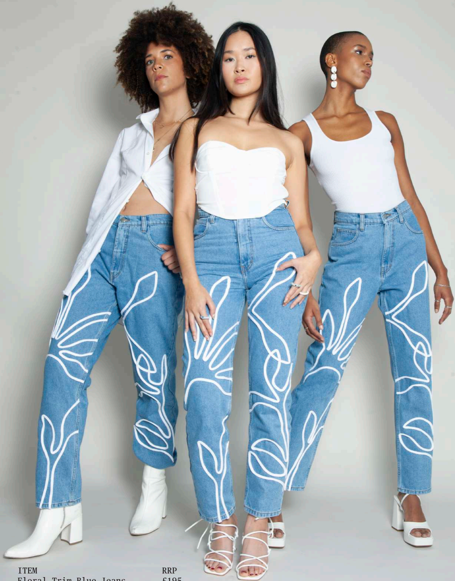
ITEM Floral Trim Blue Jeans