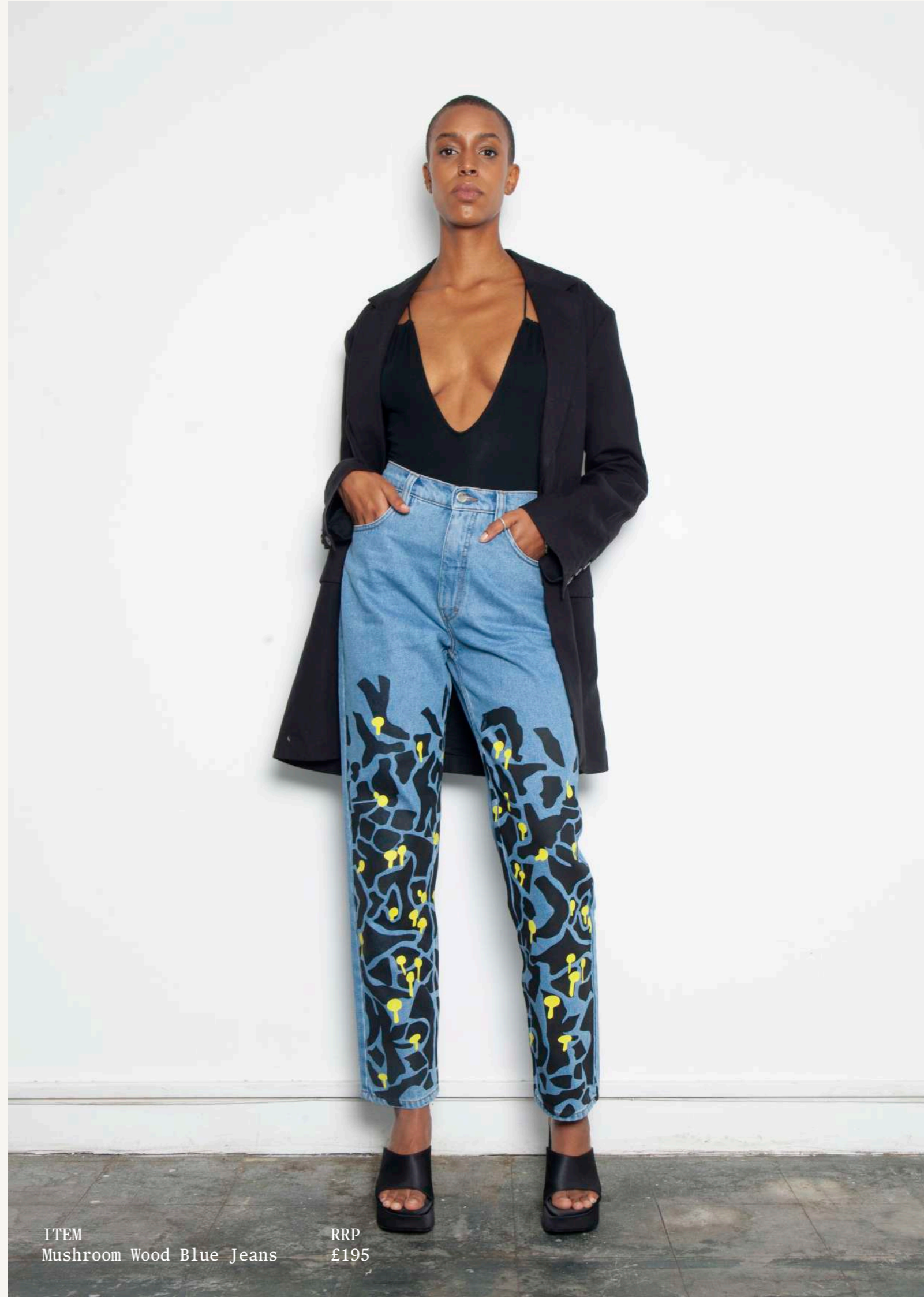
ITEM Mushroom Wood Blue Jeans