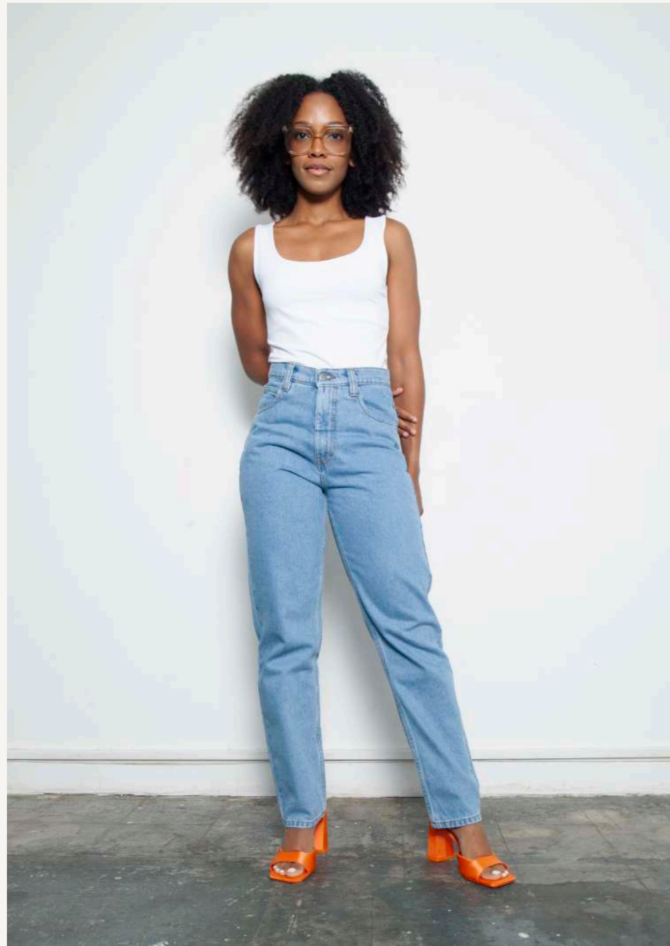
ITEM Plain Blue Jeans