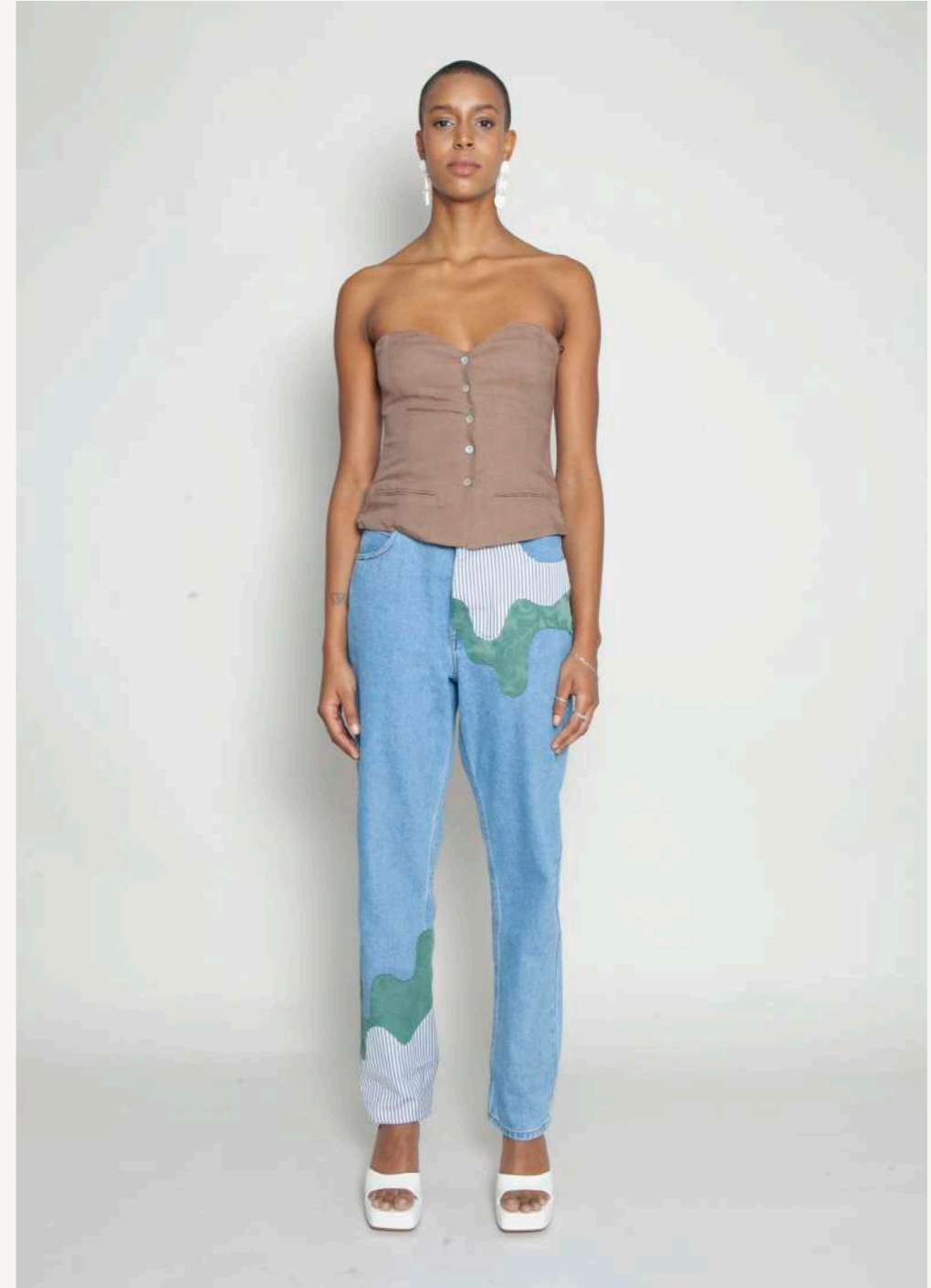
ITEM Melt Patch Blue Jeans