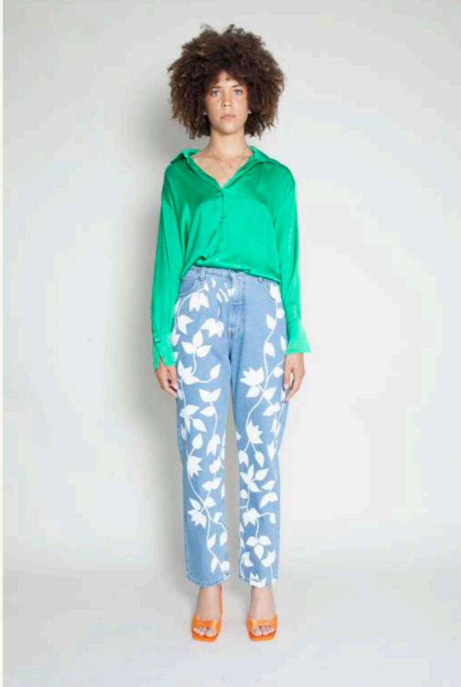
ITEM White Petal Blue Jeans