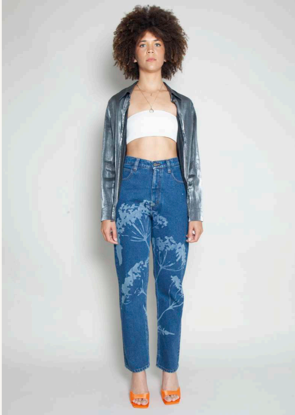
ITEM Laser Dandelion Jeans