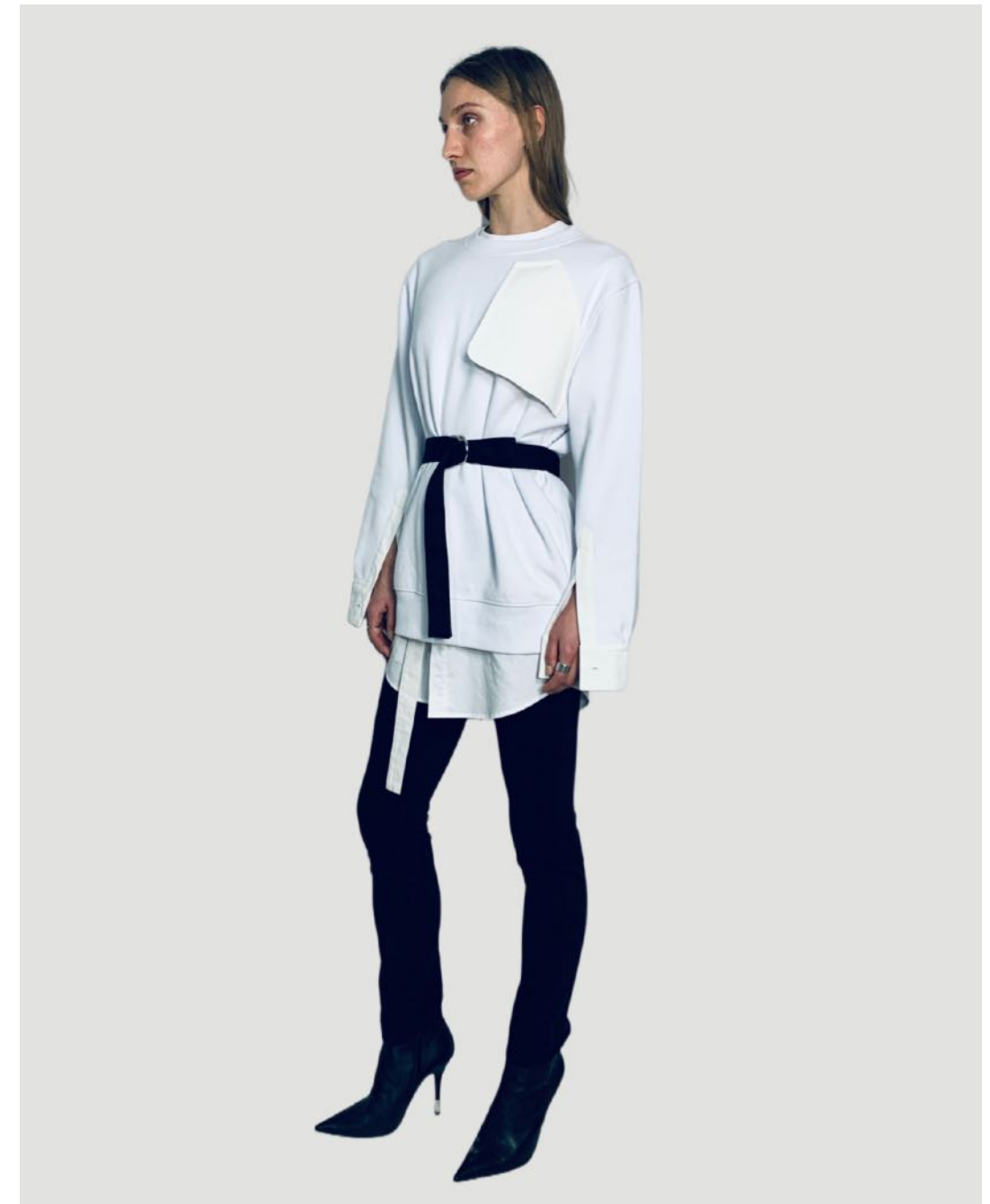
HYBRID TRENCH SWEAT