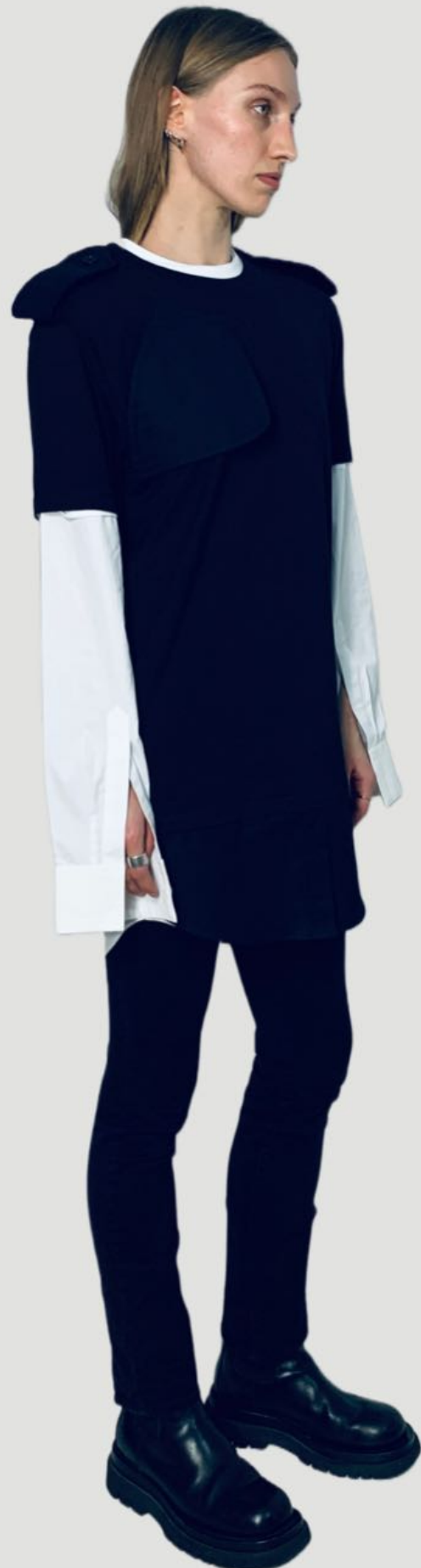
23W-501 TRENCH EPAULET TSHIRT BLACK - WHITE