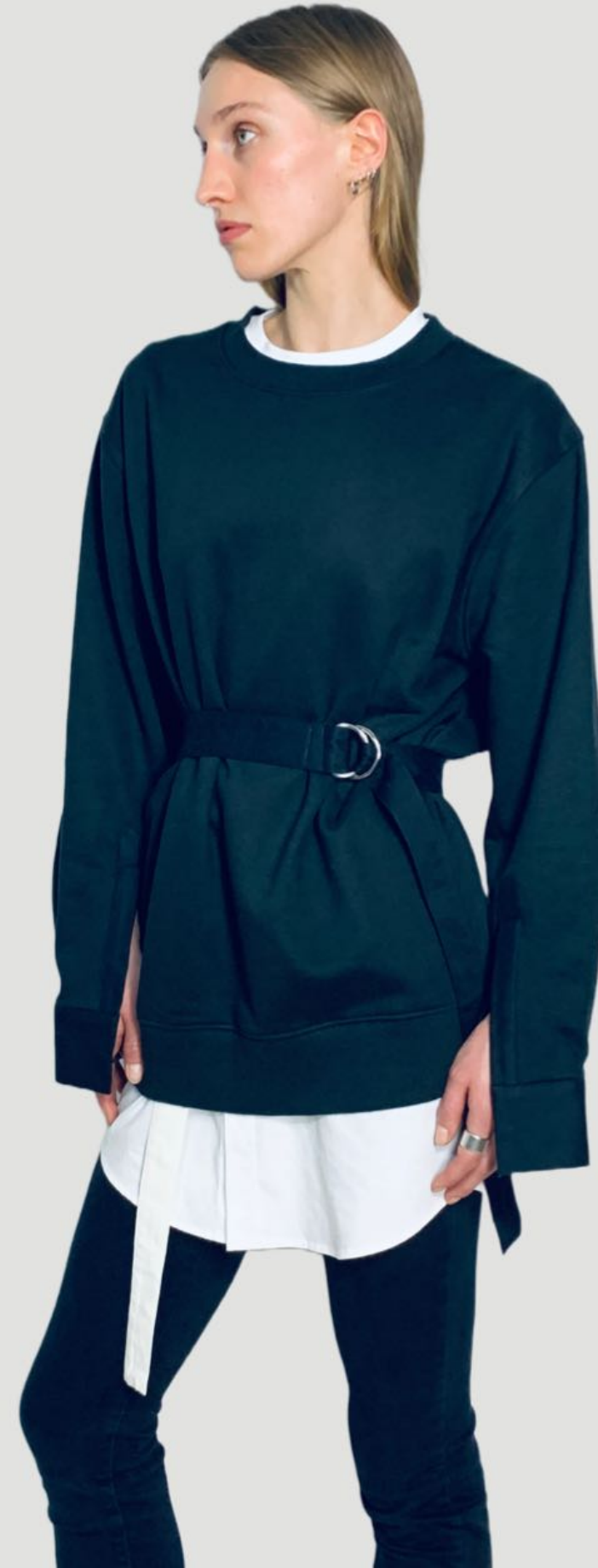
510 TRENCH BELT -X 2 BLACK - WHITE