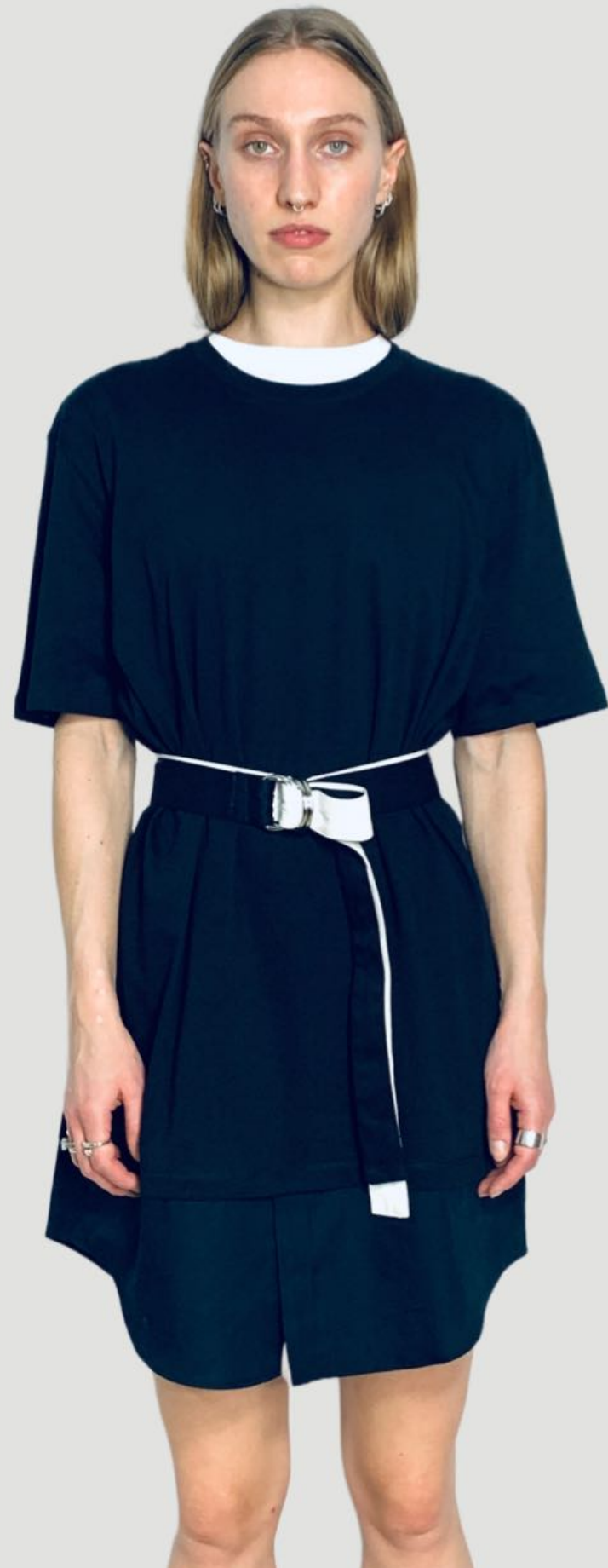
23W-503 SHIRT HEM T-SHIRT DRESS BLACK - WHITE