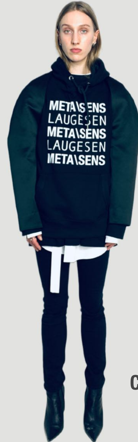
CAPE SLEEVE PIECE

// The collection stays true to the LAUGESSEN style: re/deconstructing pieces with gender-free tailoring //