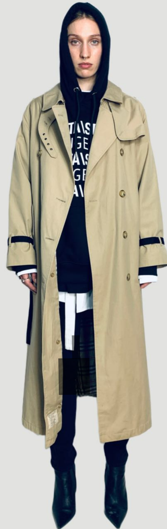
23W-101 TRENCH BEIGE - BLACK