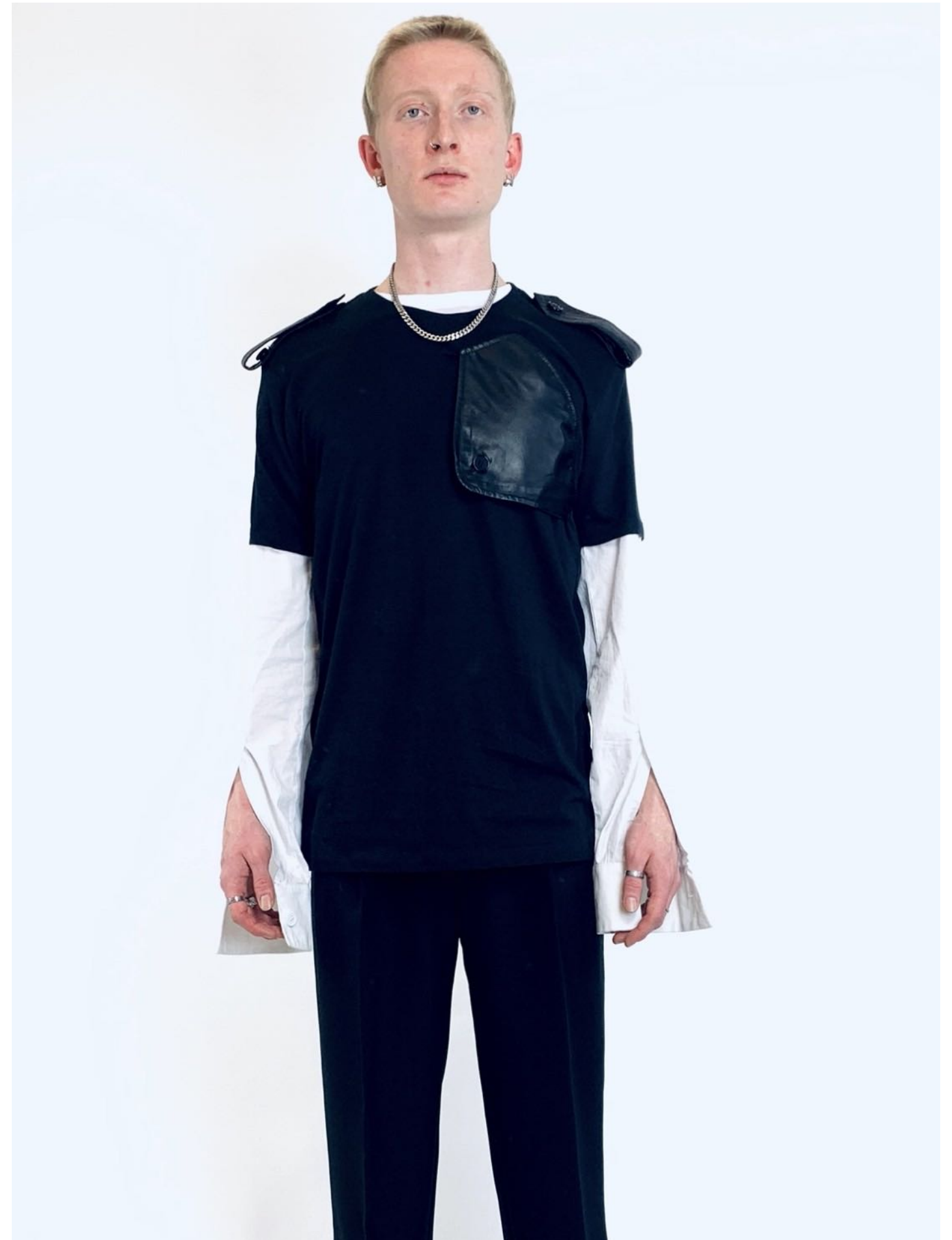
23W-505 SHIRT SLEEVE TSHIRT BLACK - WHITE