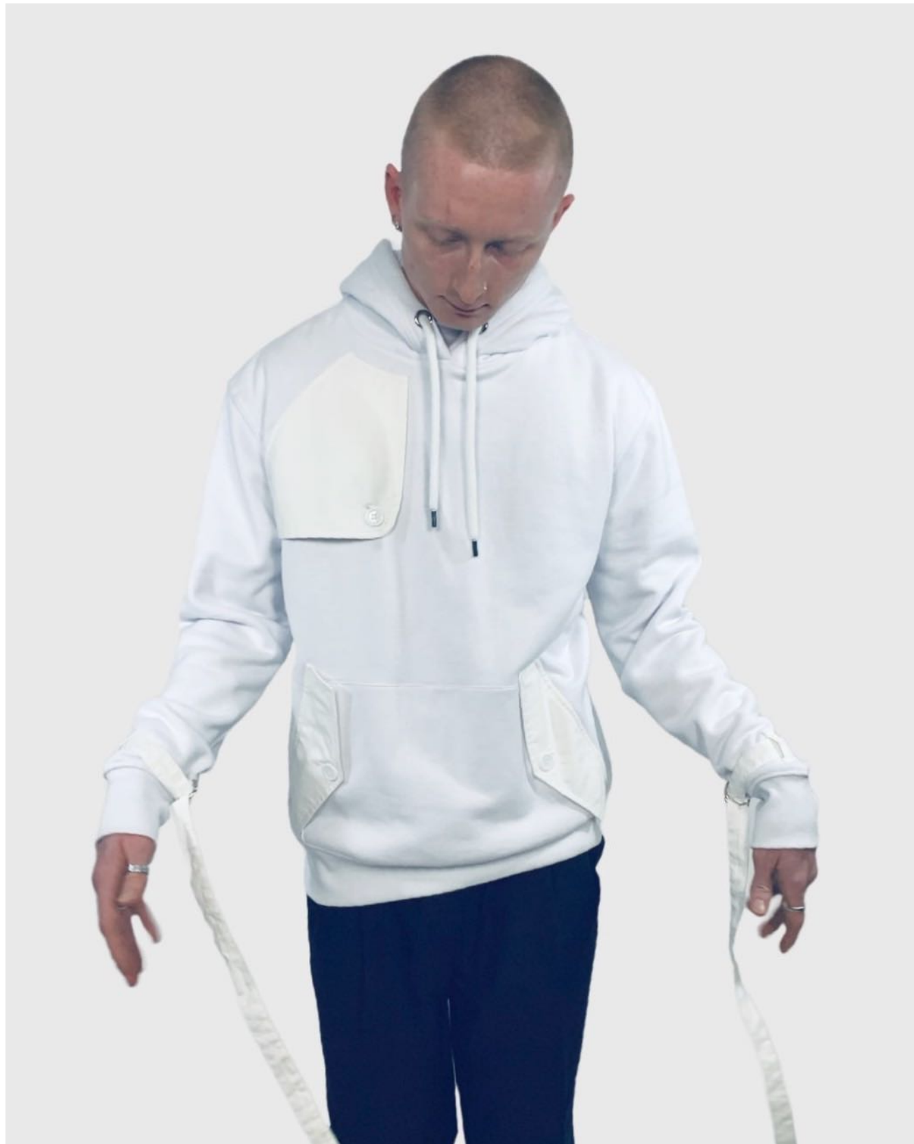
23W-403 TRENCH STORM FLAP HOODIE WHITE - BLACK